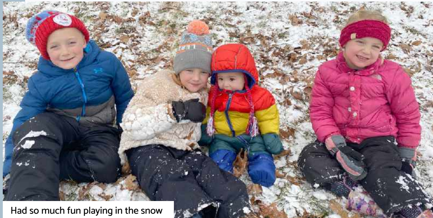
Had so much fun playing in the snow