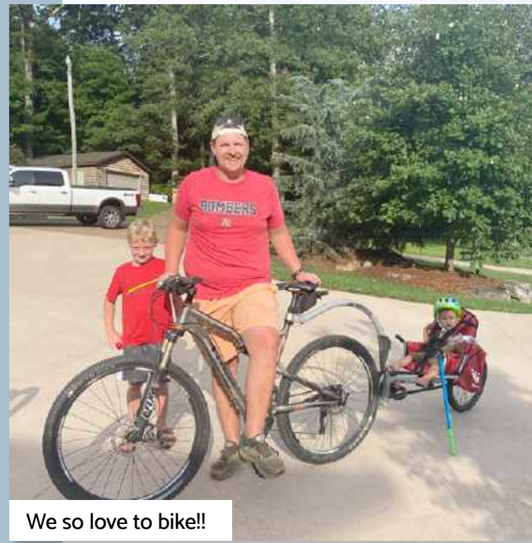
We so love to bike!!

Our family loves to be engaged with our kids. Depending on the time of year, the kids are involved in sports and a variety of other activities that interest them. We love to spend time with our kids, find what they love to do and give them opportunities to do those things.