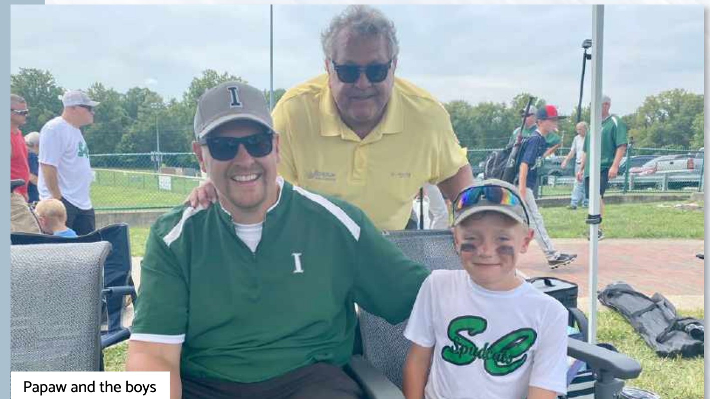
Papaw and the boys