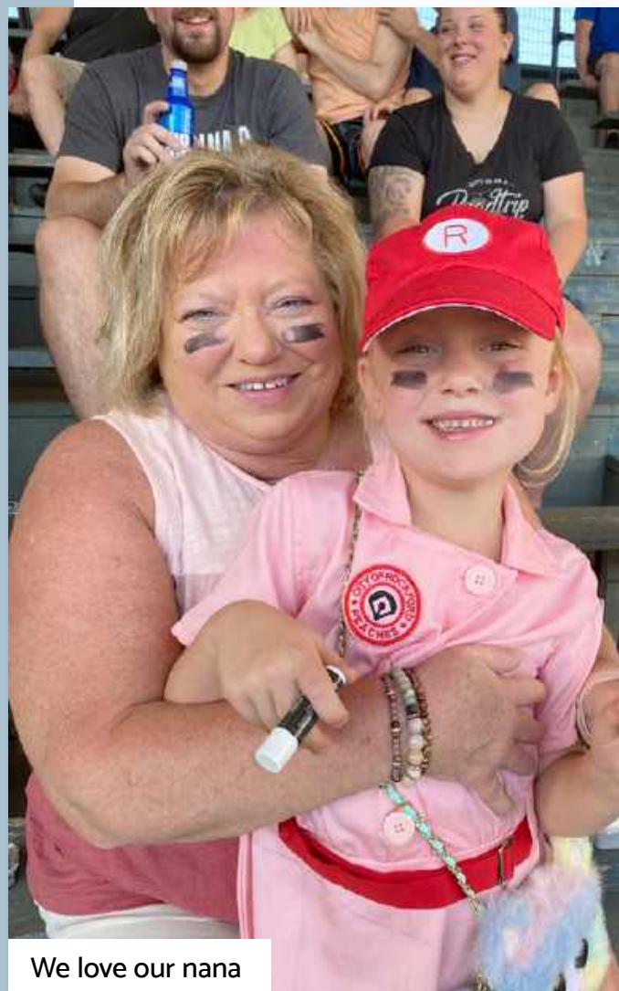
We love our nana