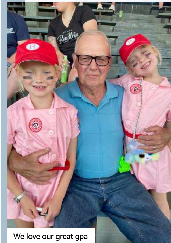
We love our great gpa

Our family motto is “ Work Hard, Never Quit, and Trust in God. ” Our goal is to live this out daily regardless of what we are doing. We spend a lot of time with our large families, cousins, aunts and uncles, and grandparents as we all live in the same town together.