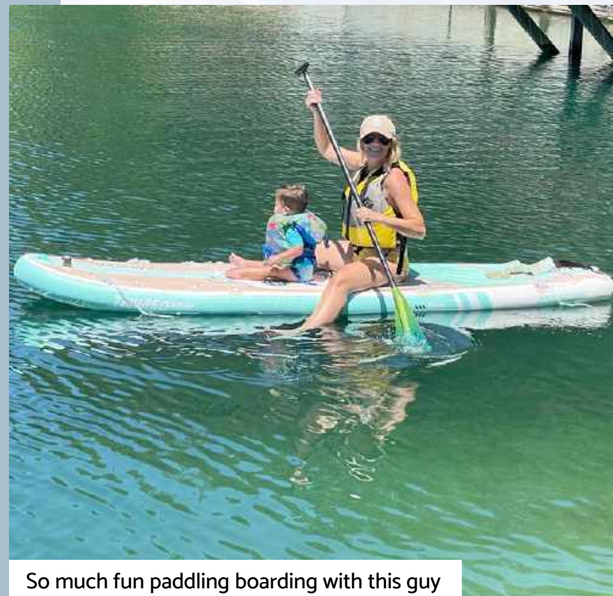
So much fun paddling boarding with this guy

As a family, we love to enjoy the outdoors and all the fun activities that go along with being in nature. A few of our favorite outdoor activities include biking, hiking and kayaking. We also enjoy arts and crafts, making things for folks, and spending time with our friends. We look forward to sharing these passions and exploring whatever passions this child has!