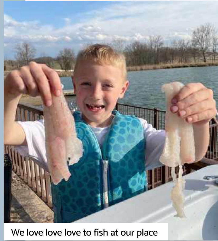
We love love love to fish at our place

Our city was rated as one of the top places to live and raise a family in the United States and our kids attend five-star public schools. Even living outside of the city, we are still able to be downtown in less than 10 minutes!