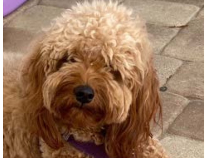
GRACIE, GOLDDOODLE, 4