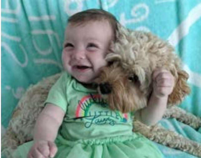
CALLIE, CAVAPOO. 4