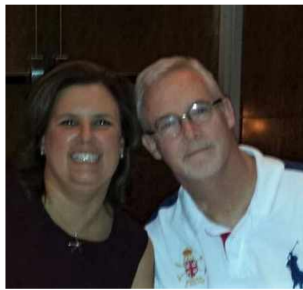
Me with my Uncle Sam