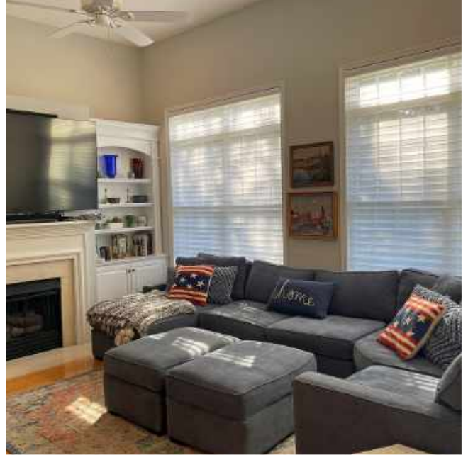
My family room

My home is the perfect place to create fun and amazing memories with a child and I know he or she will love it as much as I do.