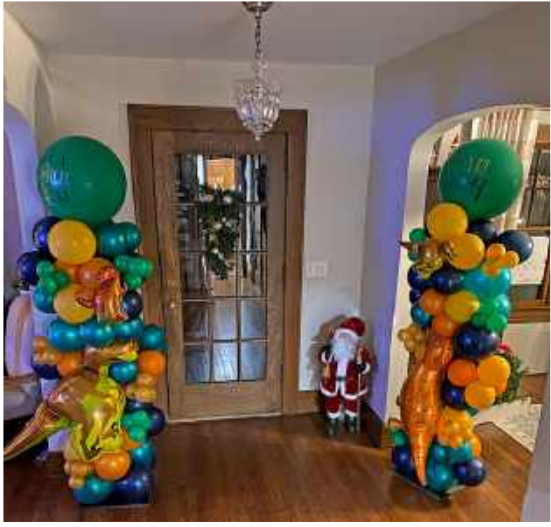
Celebrating my nephew Liam's birthday with a tower of balloons!