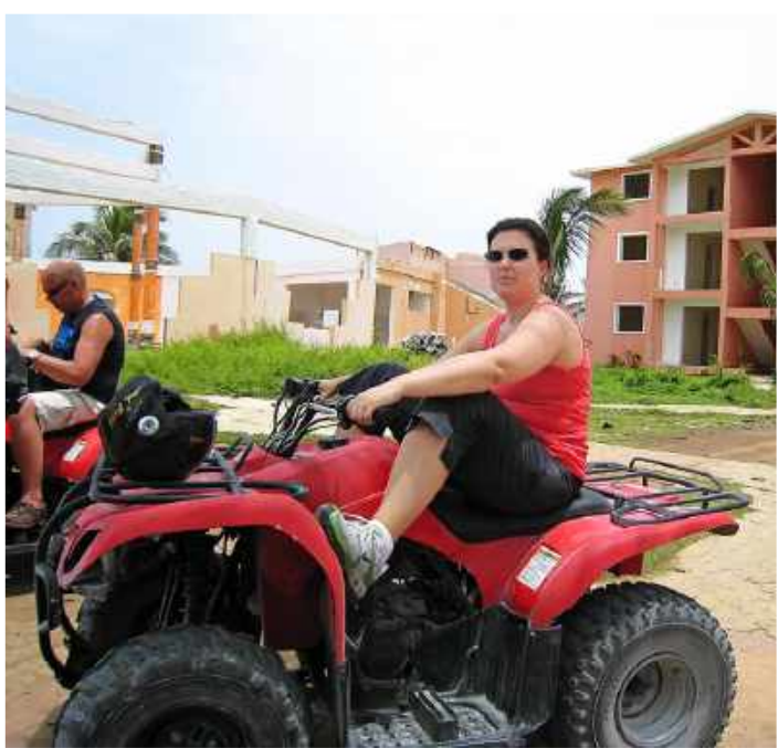
Riding an ATV in the Dominican Republic