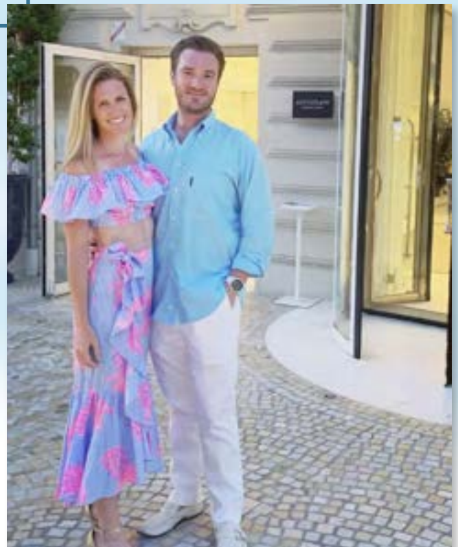
In Europe for a friend's wedding.