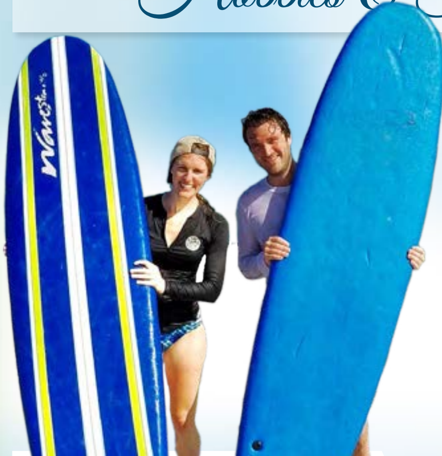
There's always time to catch some waves!

Surfing, paddle boarding, hiking, walking the dog, riding bikes – anything outdoors and active is fun for us.