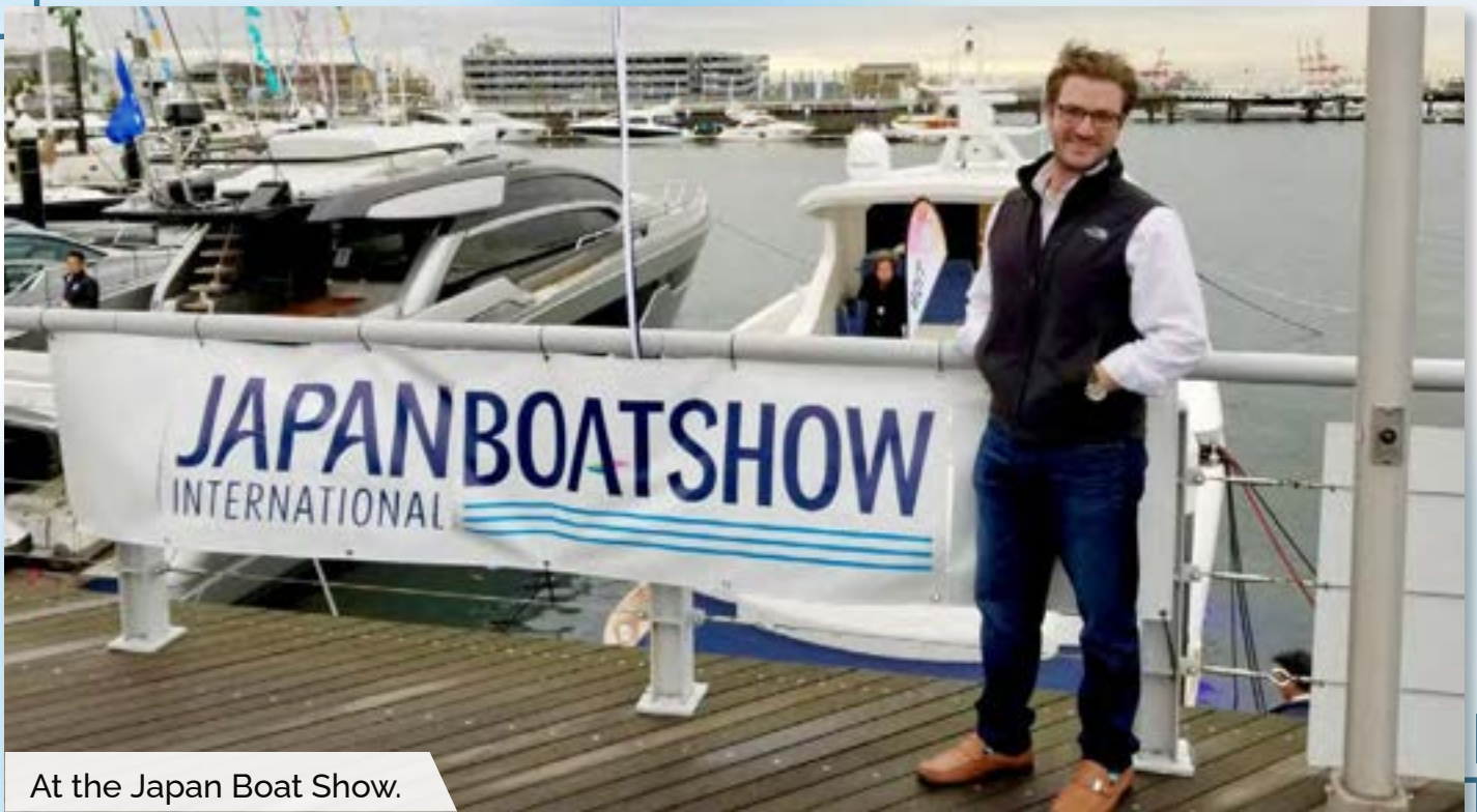
At the Japan Boat Show.

For the past 15 years I have worked in the maritime industry, both running and selling boats. Along the way, I have built a side business in event production and event technology. I am an entrepreneur at heart, so I am looking forward to supporting and encouraging our child's natural curiosities. I am equally excited for the teachable moments and opportunities to share some of the basic life lessons and "dadvice" – like home improvement, how to change a tire (whether I have a son or a daughter!), and how to drive stick shift.