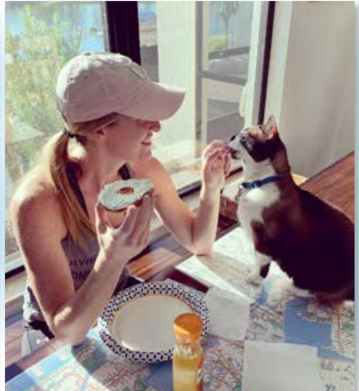
Our pets are part of the family too! Bagels and cream cheese with Chadwick the cat!