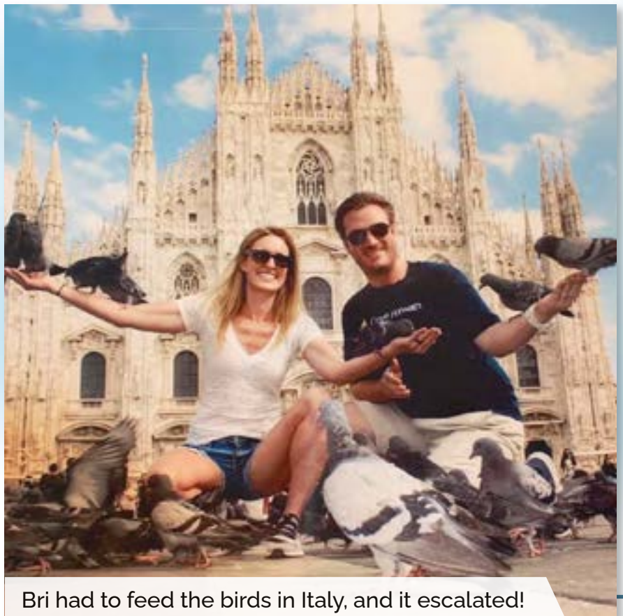
Bri had to feed the birds in Italy, and it escalated!