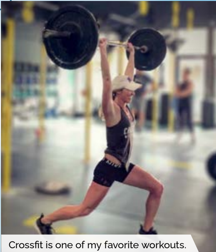
Crossfit is one of my favorite workouts.

For work, I am a tax attorney and CPA. I love my firm and its culture. I will be able to take maternity leave following the adoption, and I am really looking forward to this time with the baby. After that concludes, I will work from home most days, which will allow me to spend more time with our child!