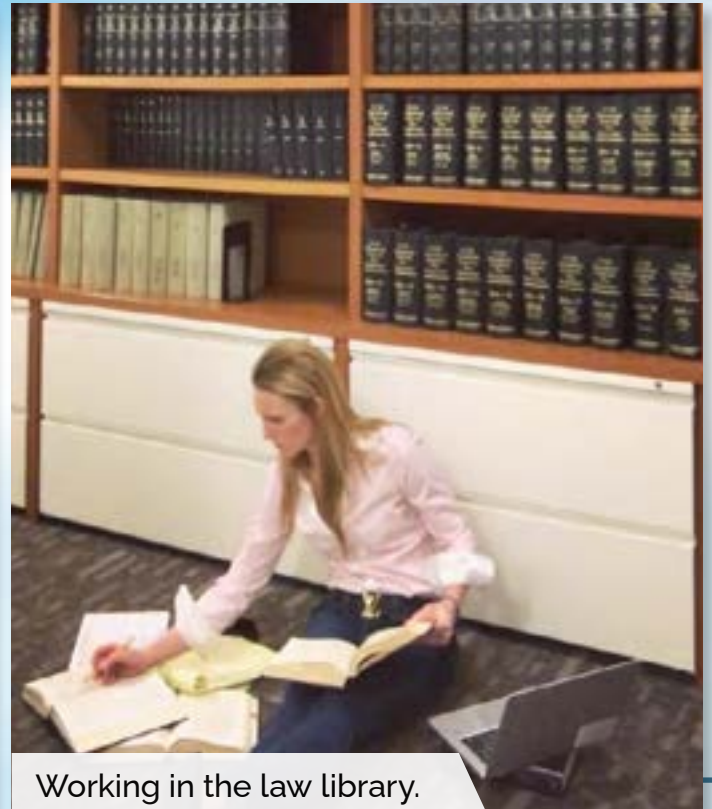
Working in the law library.