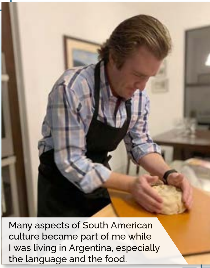
Many aspects of South American culture became part of me while I was living in Argentina, especially the language and the food.

at the beach in Connecticut. One of the things I most look forward to is being able to share these extraordinary experiences with a child one day. I look forward to sharing the family beach house, playing sports on the beach, sailing camp, diving, and boating with our child.