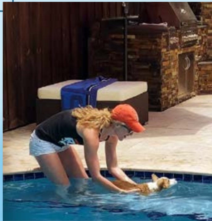
Sophie's first time swimming in the pool when she was a puppy!