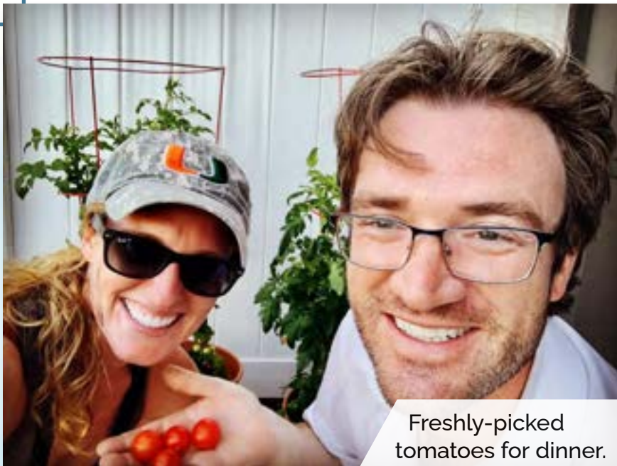
Freshly-picked tomatoes for dinner.

The beach is only 15 minutes away, so it's easy to take the dog to the beach for some exercise or grab the surfboards and catch some waves! We love being outside and being connected to nature and cannot wait to share this lifestyle with our child.