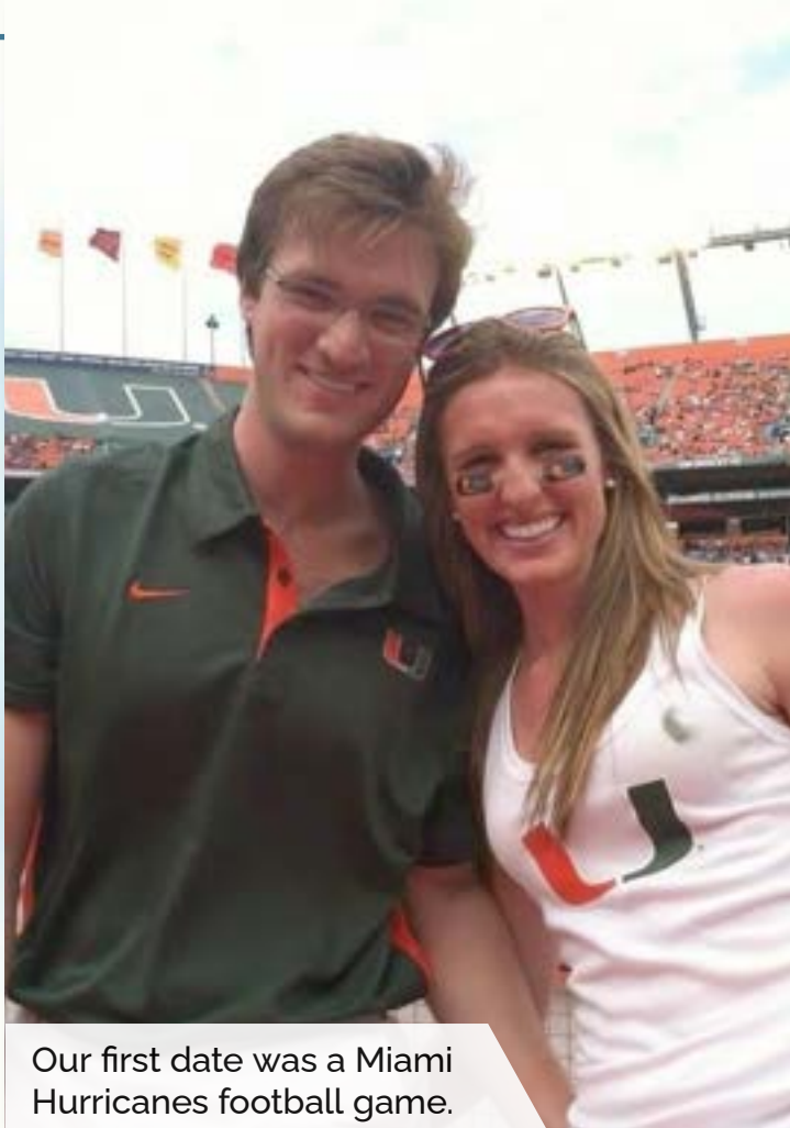
Our first date was a Miami Hurricanes football game.