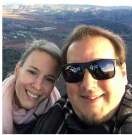
Hot Air Balloon Ride in Napa