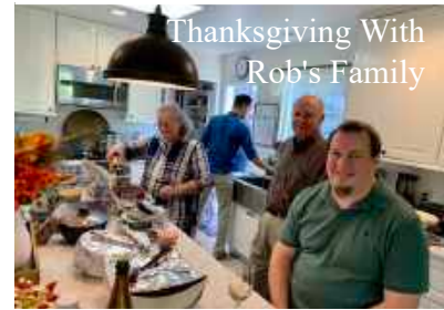
Thanksgiving With Rob's Family