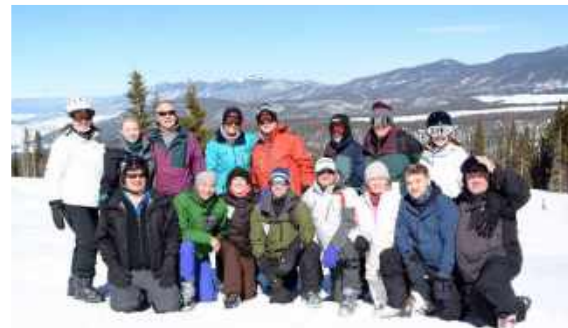
Family Ski Trip