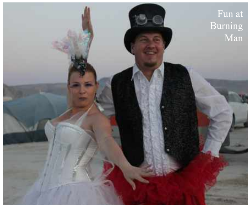
Fun at Burning Man