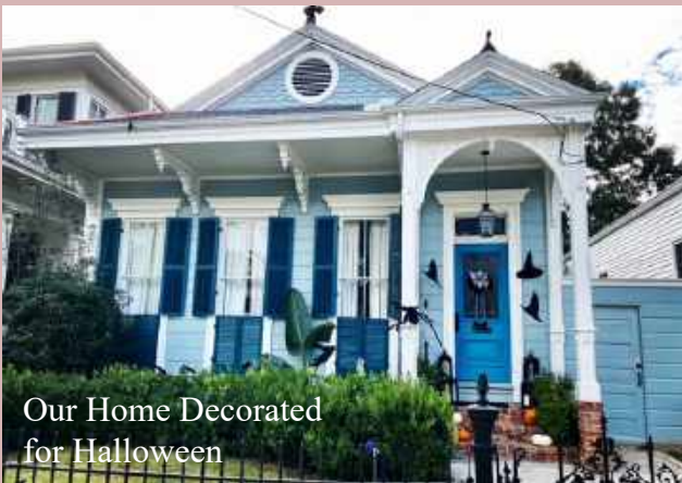
Our Home Decorated for Halloween

Our house was built in the late 1800s in the Italianate architecture style, it has 12-foot ceilings, and plaster moldings, but has been renovated with all the modern conveniences. It sits on what's called a key shaped lot which gives it a large backyard for the area. We love sitting on the back deck and enjoying the lush landscape and flower filled backyard. With two bedrooms and two bathrooms, it has plenty of space for a small family.