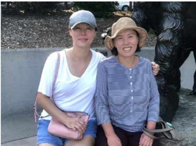
The Zoo with Mom:)