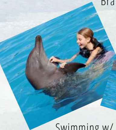
Swimming w/ dolphins in Cancun, Mexico