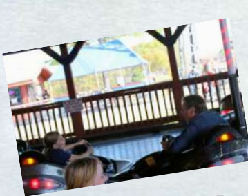
Fun at the Fair in Branson, MO