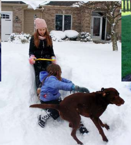
Fun in the snow with neighbor friend