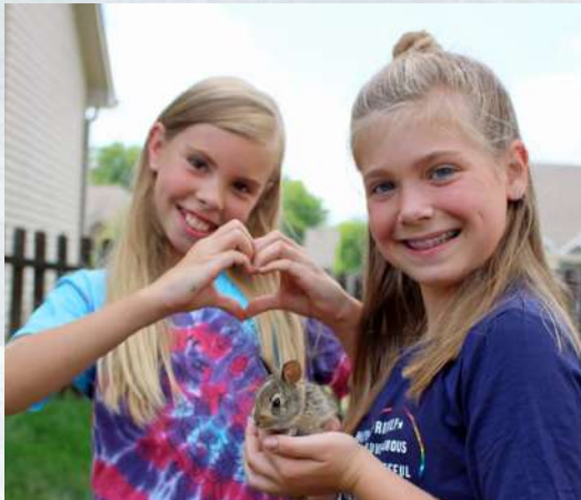
Taking care of backyard wild bunnies w/ lifetime church friend