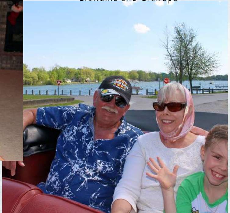
Fun car ride with Grandma and Grandpa