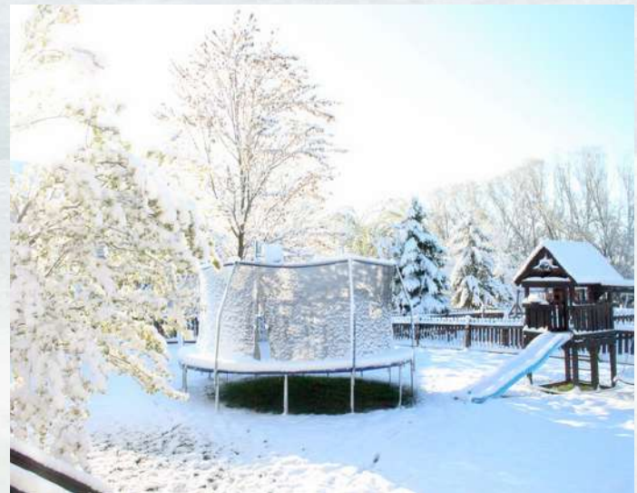
Beautiful backyard snowfall