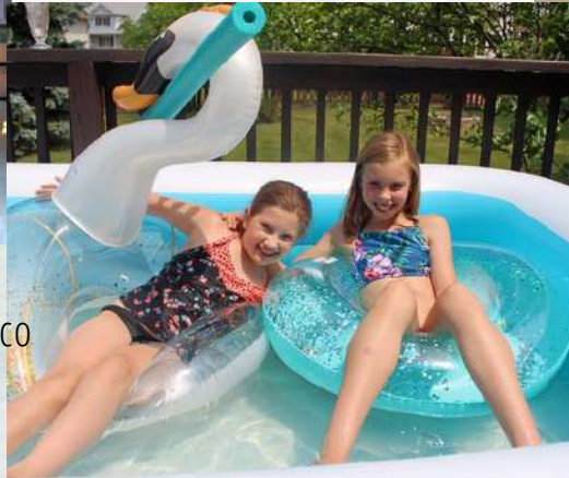
Backyard pool fun w/ best friend