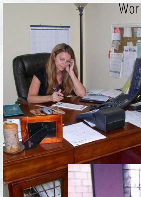
Working from home