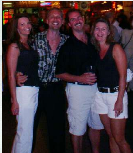
Sister & Brother -n-law