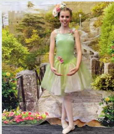
A flower in Beauty & the Beast ballet show