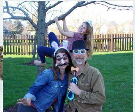
Backyard Easter shenanigans