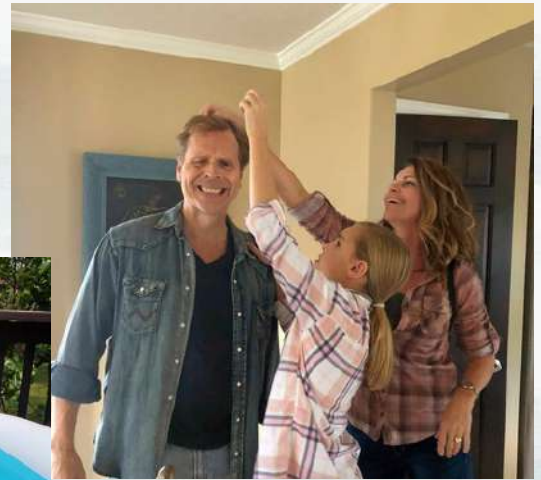
Messing around with Dad