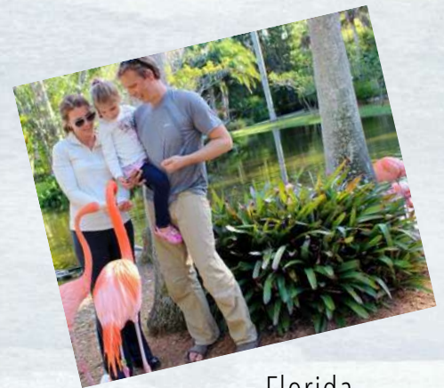
Florida Feeding Flamingos