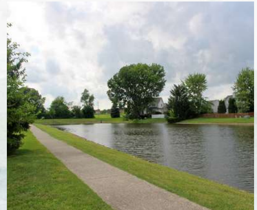
Fishing Pond nearby

We live in a quiet, family oriented neighborhood, with many children of all ages. One of our favorite places to meetup with neighbor friends is the cul-de-sac in front of our home to play a game of kickball. And our backyard for a bonfire with s'mores!