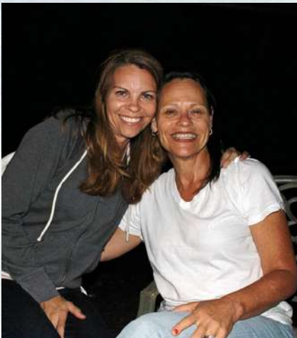
Sisters in Christ