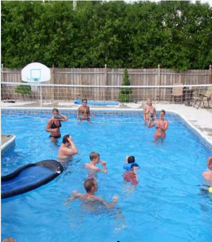
Summer fun at Aunt Heidi's pool