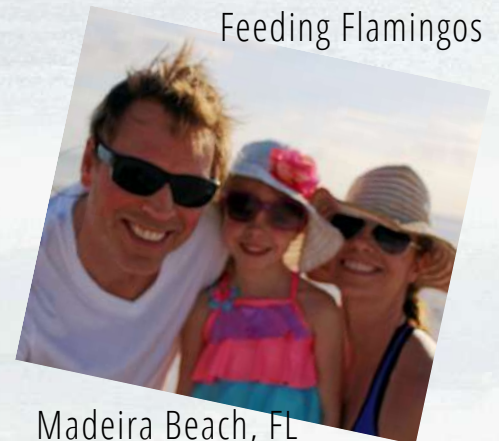
Madeira Beach, FL