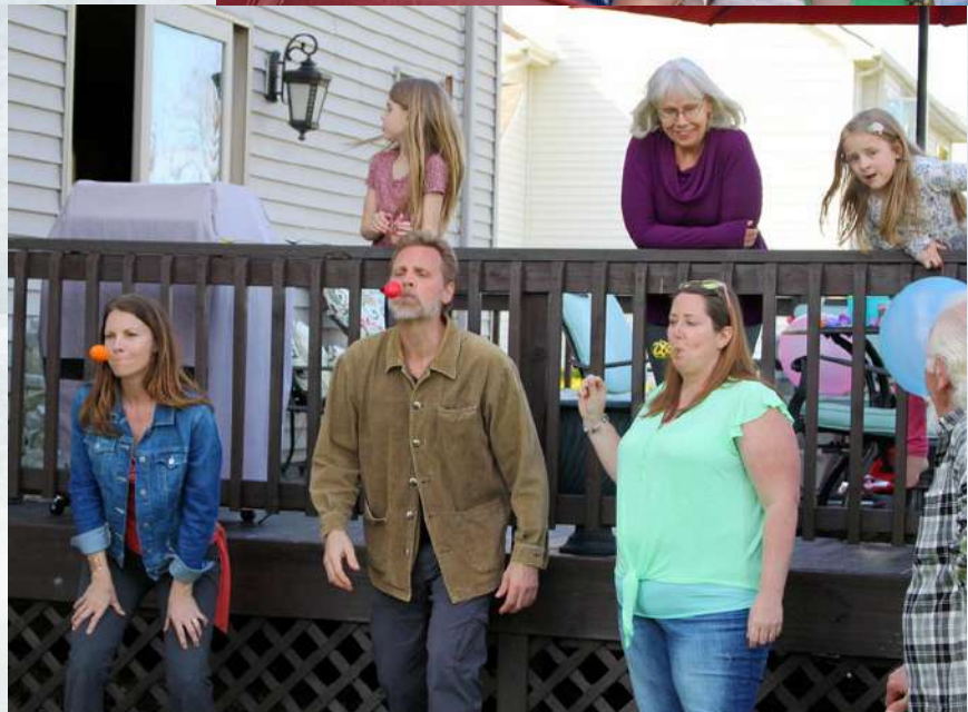
Backyard Easter fun with Grandma/Grandpa & friends