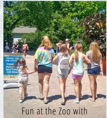
Fun at the Zoo with lifetime church friends