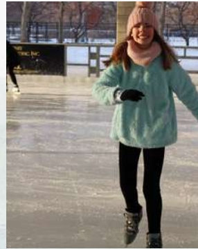
Downtown Ice Skating

Some fun places we have gone to over the years! Busch Gardens. Waterparks! Florida is one of our favorite vacation places!