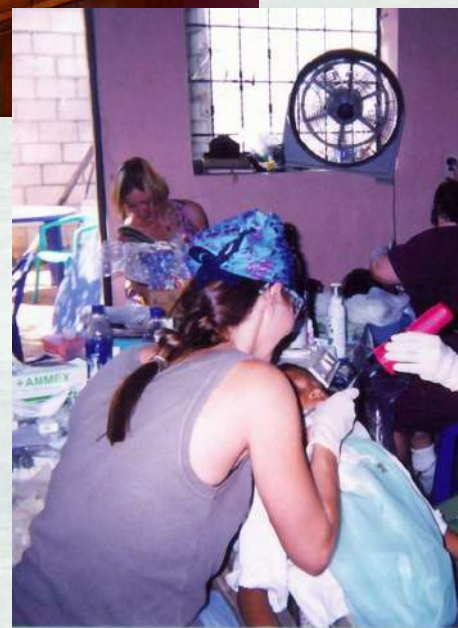
Dental Hygiene Missions Trip to Mexico