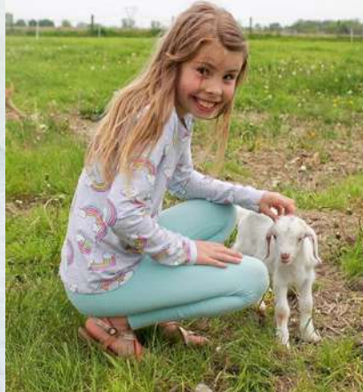
Petting the baby lambs at a farm