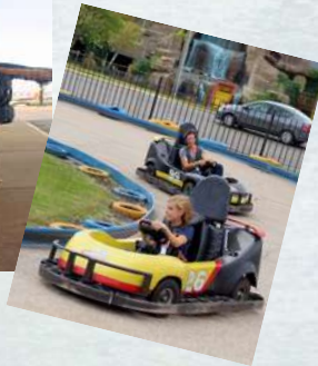
Florida 6 mo. pregnant