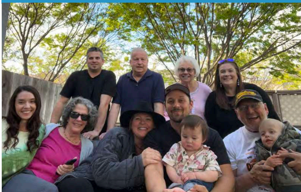
Celebrating my nephew's first birthday