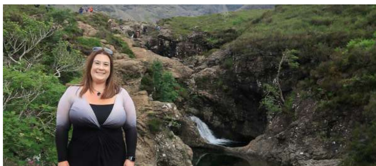
Checking out the fairy pools in Scotland

Adoption is an incredible exchange of trust and I will always hold this in my heart. No matter what, you will always be an integral part of your child's life. I want your child to grow up knowing their story, where they came from and having an understanding and appreciation for you and the choice you are making for them.