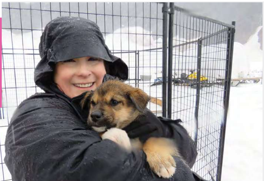
Dog sled camp in Alaska

I AM SO EXCITED TO PROCEED WITH MY DREAM AND CAN'T WAIT TO START A FAMILY.