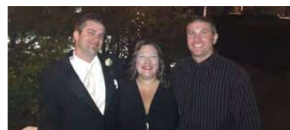
I have the best brothers!