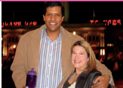
My ex is still an important part of my life

YOUR CHILD WILL ALWAYS KNOW AND UNDERSTAND THAT THEY HAVE TWO FAMILIES