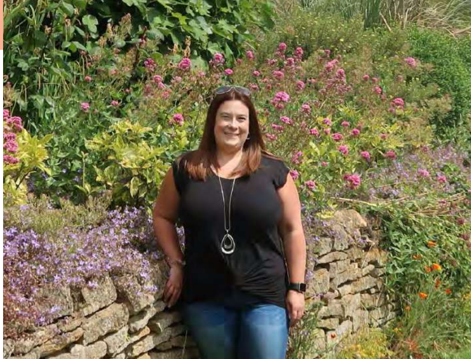
Enjoying all of the gardens around England

I was in a long-term relationship for many years. When we decided to start a family, I was diagnosed with infertility and learned I would never be able to have a biological child. I knew I still wanted to be a parent. He did not. So, I started on my journey to adopt as a single parent. While we are no longer together, we remain close friends and he is very supportive of my decision to adopt.