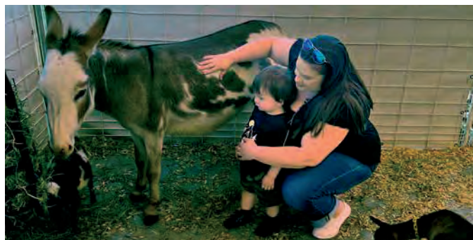
At a local petting farm with my nephew

My home has three bedrooms, two bathrooms, and a backyard that is a child's dream! There's plenty of space to kick a ball, play a game of tag or have an overnight backyard camping experience.