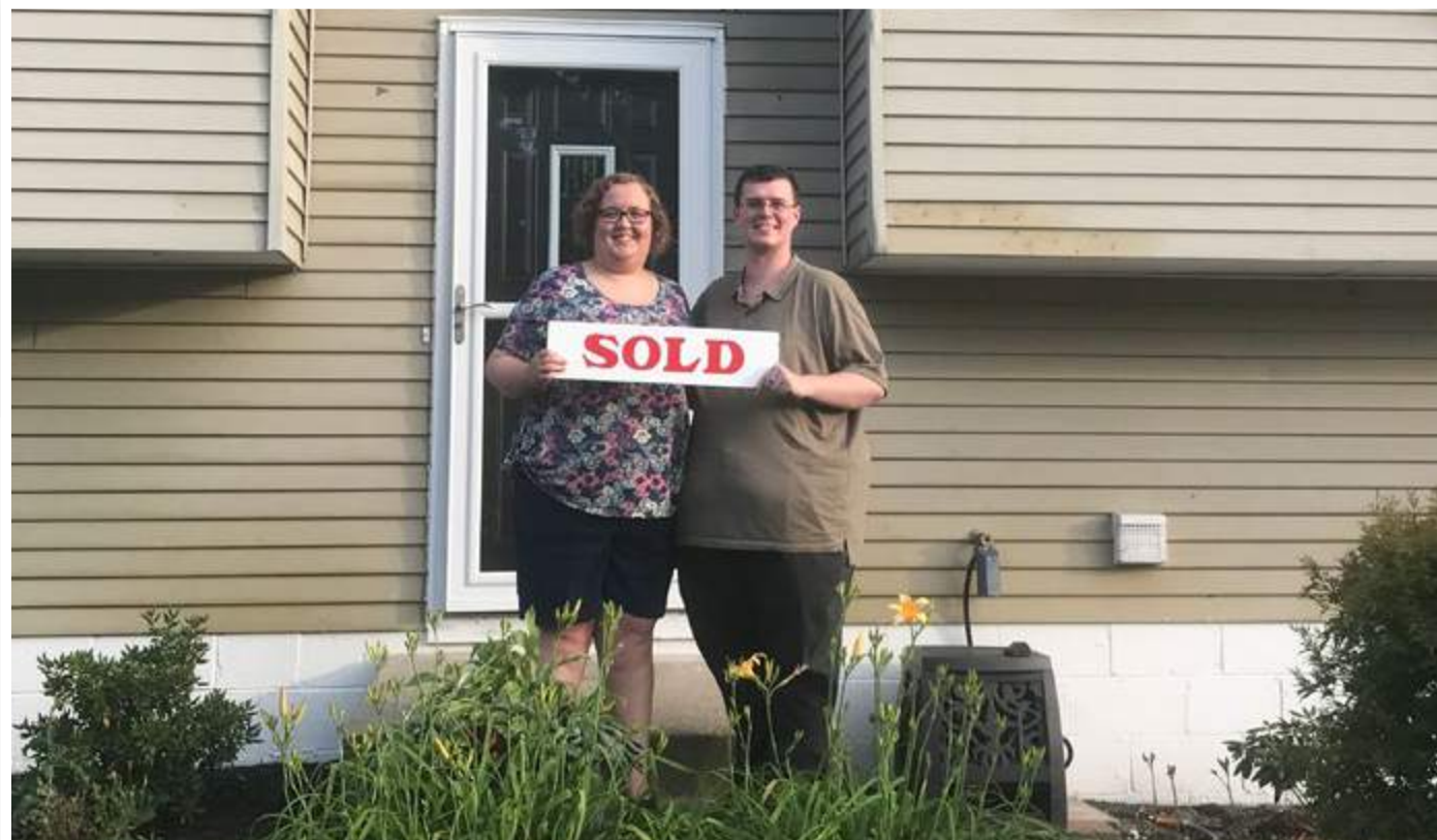
The day we bought our house!