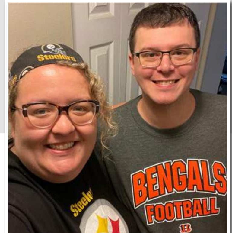
A House Divided - Steelers vs Bengals