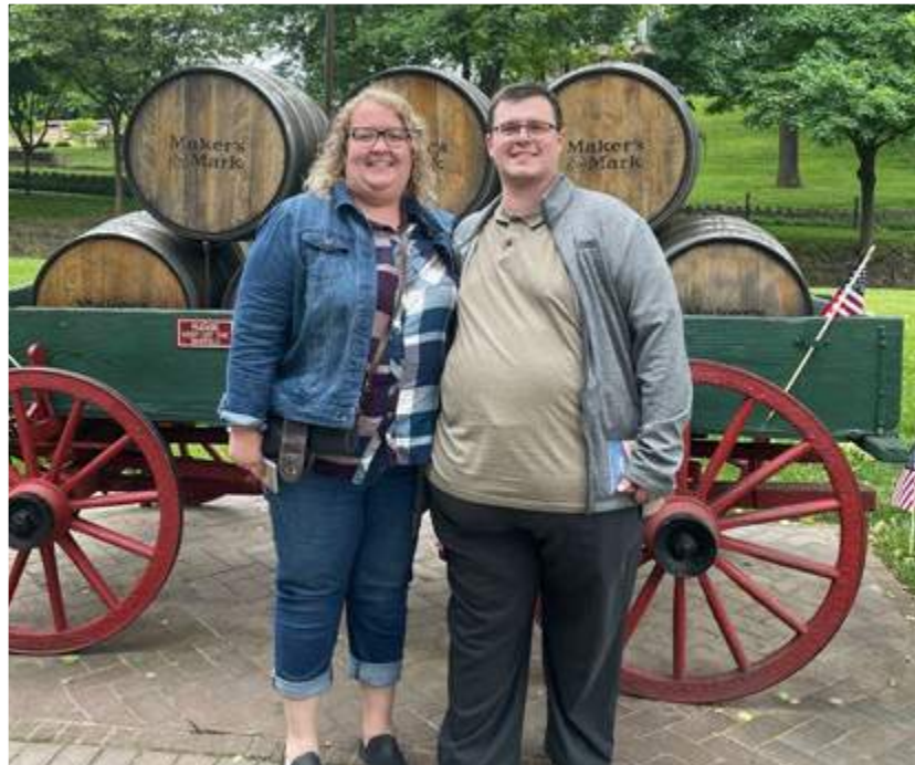
Trip to Kentucky