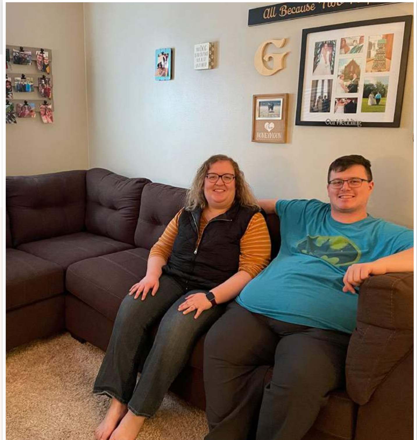
Sitting in our living room enjoying the new couch we just purchased

The best part of living in Cincinnati, besides being close to both of our families, has to be the culture. We feel like this area gives us the best of both worlds: a big city and a small-town feel. It's a wonderful place to raise a family. We cannot wait to take a child to their first Reds game, The Museum of Natural History or just a nice picnic next to a pond (who doesn't like ducks?).