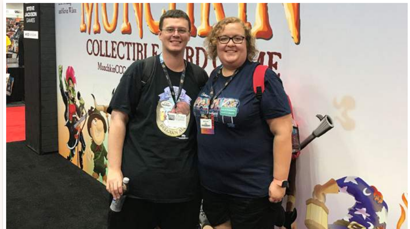
Us at Gen Con - a board game convention