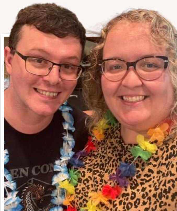
At our friend's daughter's birthday party

Upon our return from our honeymoon, we decided on three major things. We wanted a house, we wanted a dog and (most importantly) we wanted a family. The first two weren't that difficult for us! We adopted a Corgi named Luna and found a wonderful home in Cincinnati. The third, however, proved to be a challenge. After two years of trying to conceive, our doctors informed us that our chances were basically zero. After digesting this news, we decided it wouldn't stop us; our hope of becoming parents can overcome anything! We hope that you can join us on this journey to give a child a loving, caring and embracing family through adoption.