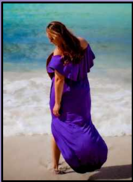
Justin took this picture during our travels to the Bahamas