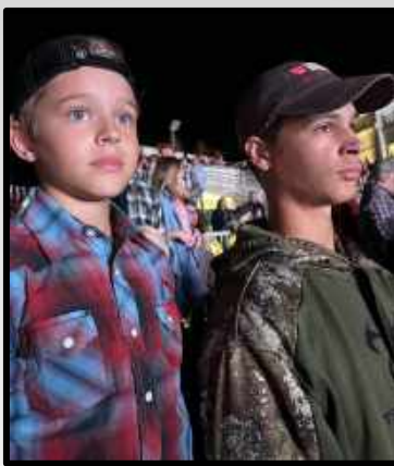
First concert at an outdoor amphitheater