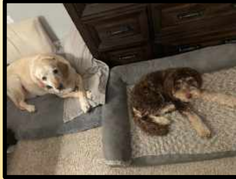
Our boys ready for bed