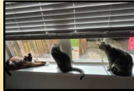
Bird watching from the kitchen window