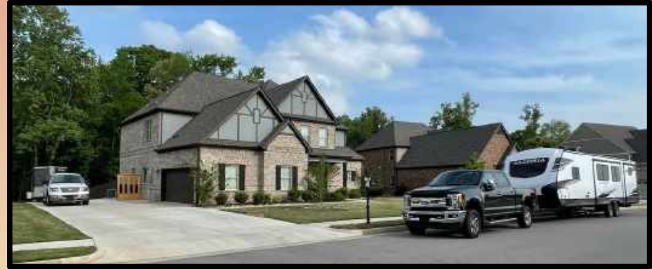
Our home on wheels and permanent residence