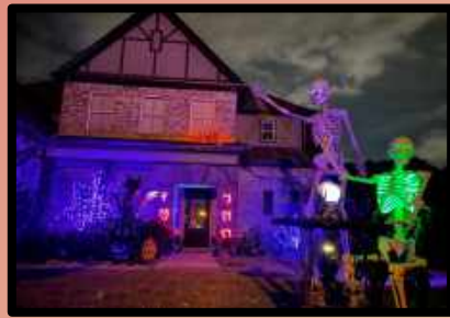
Yard ready for Halloween