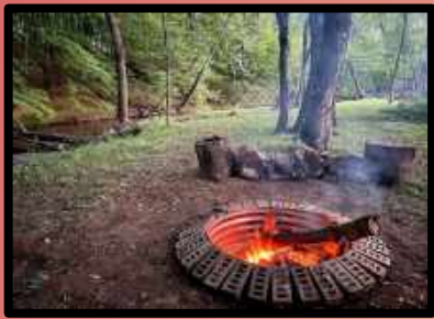
Fire pit by the fishing hole in our backyard