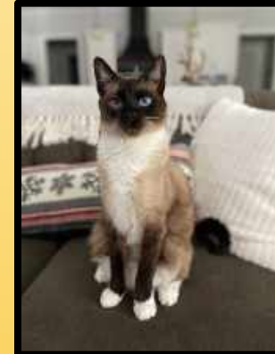
Lord Commander Jon Snow (aka Snow)

We have a big loveable yellow lab named Rambo who LOVES children! By his side comes young Rocky, our Aussiedoodle fur-blur puppy that keeps Rambo young. We also have our three cats, Polly (the matriarch), Clary (the "middle child"), and Snow (the instigator).