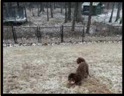
Rocky catching snowflakes for the first time