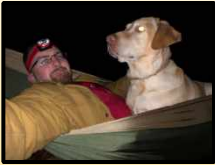
Hammock snuggles in the backyard