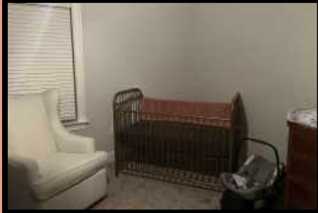
Nursery with all the basics, ready for baby