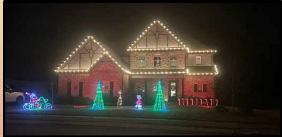
Decorating for Christmas is a family past time