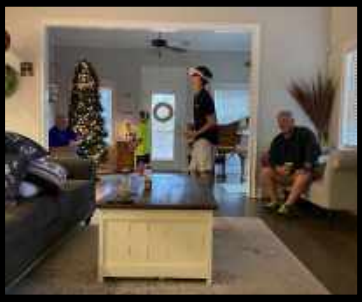
Large family room to entertain