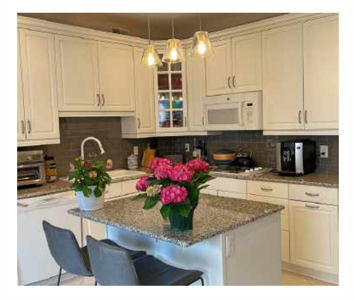
I love to cook in my kitchen!