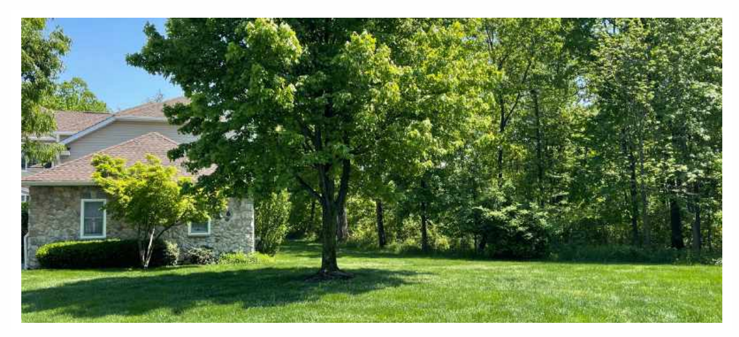
There's lots of space to play!

To me, my home is my happy place and I find pleasure in the simple things like cooking, listening to music, walking my dogs, talking to my neighbors, or watching a show on tv.