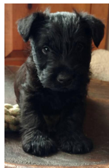
Ziggy as a pup