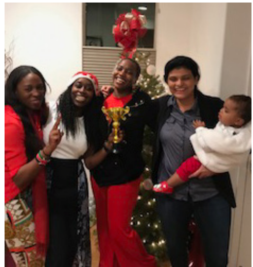
Christmas with nieces and great niece