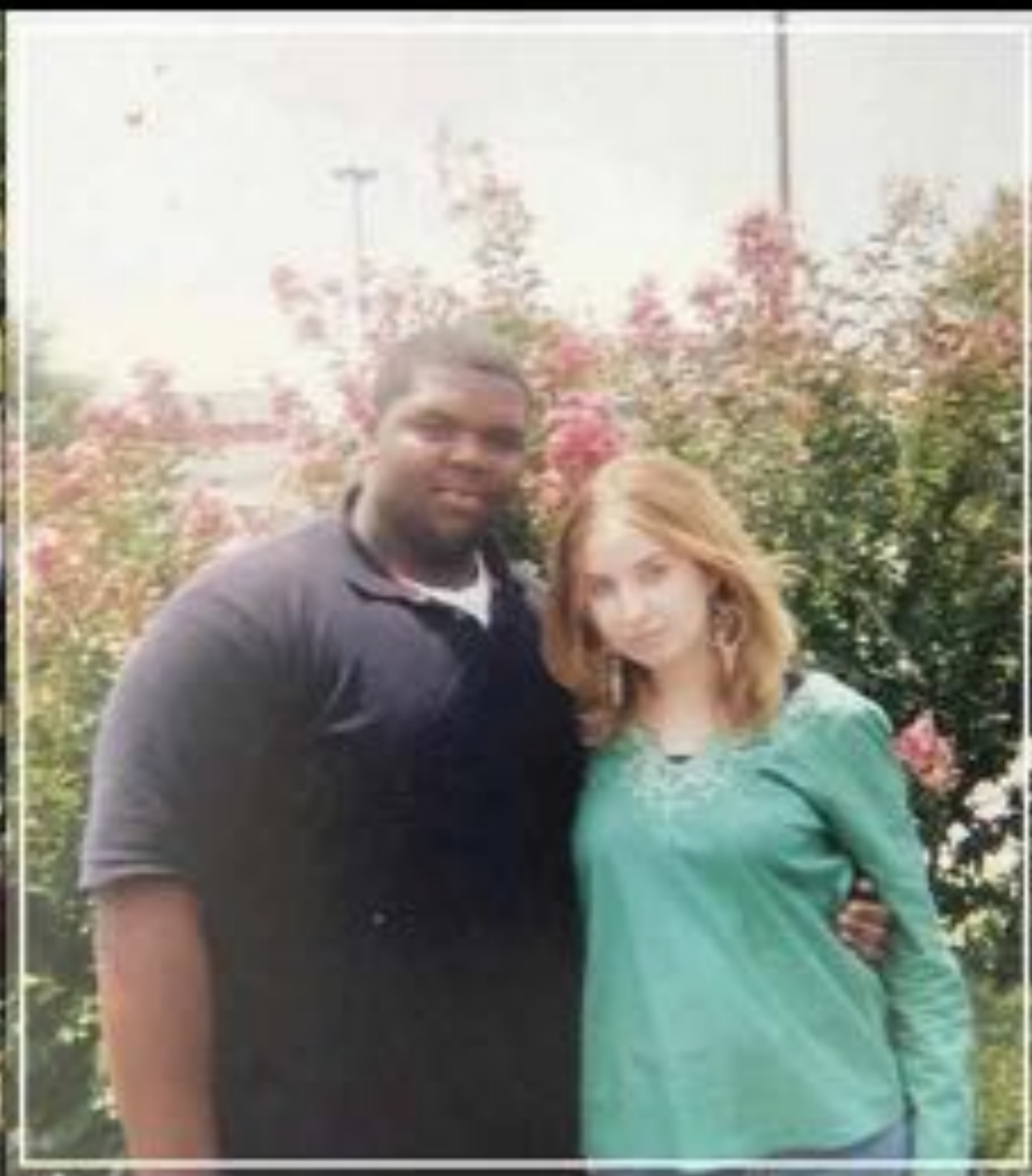
Us while dating in high school