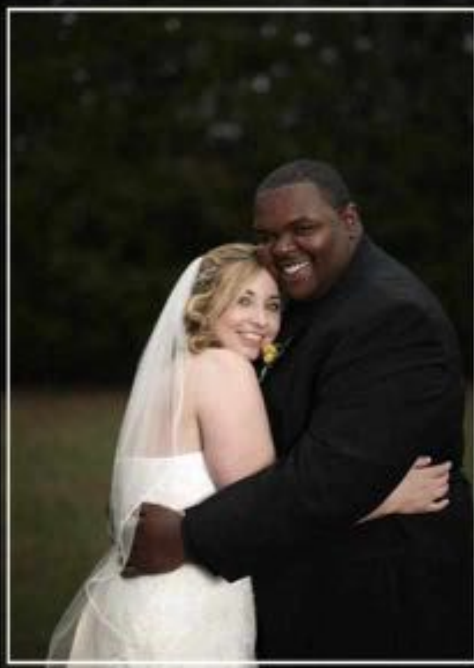
Our wedding day March 29, 2014