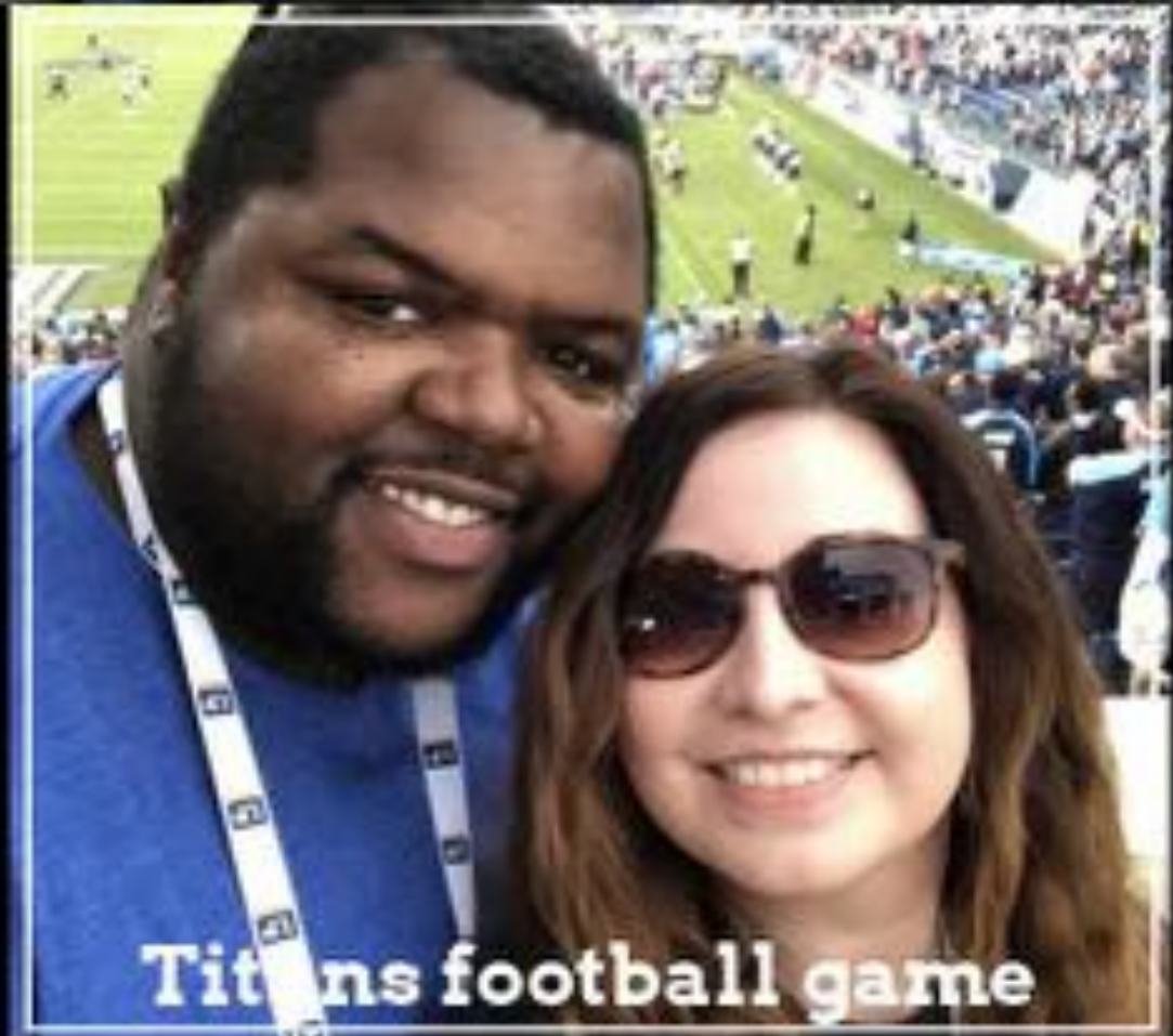
Titans football game