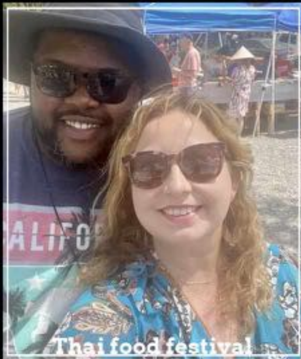
Thai food festival