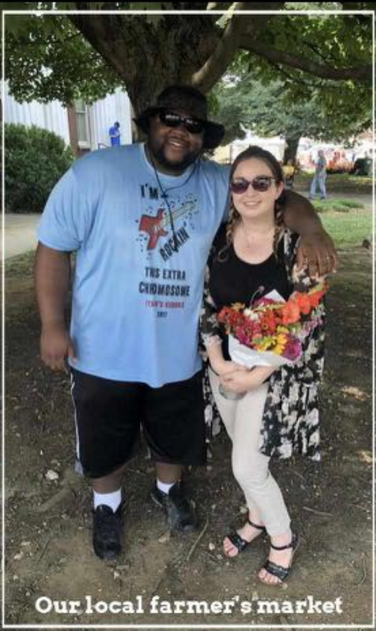
Our local farmer's market