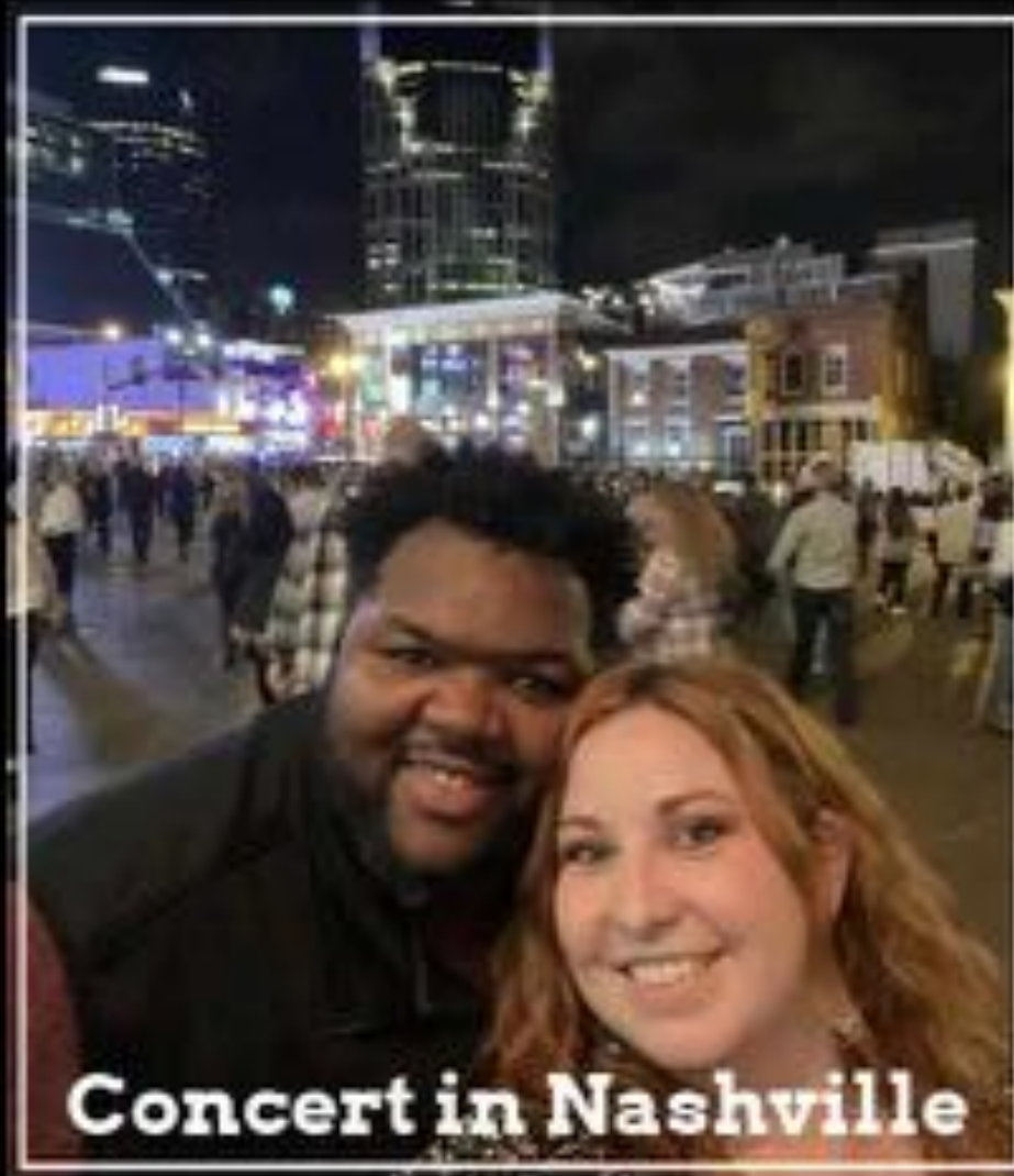
Concert in Nashville