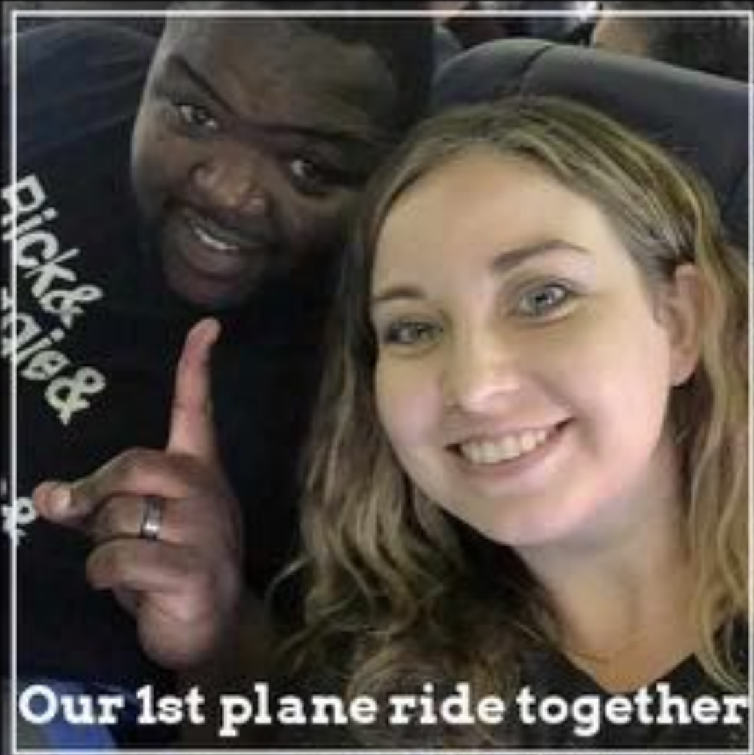
Our 1st plane ride together