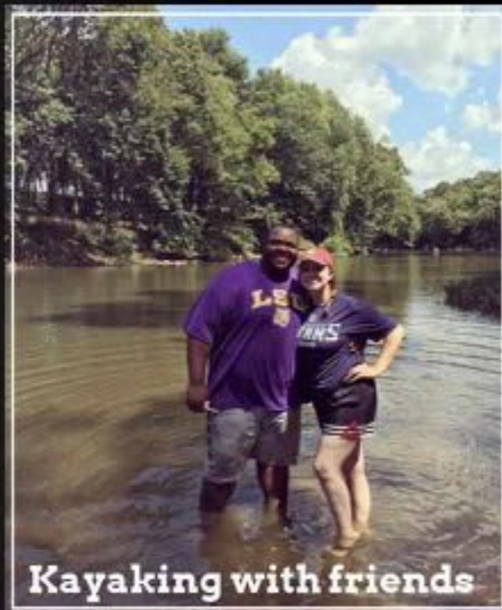
Kayaking with friends