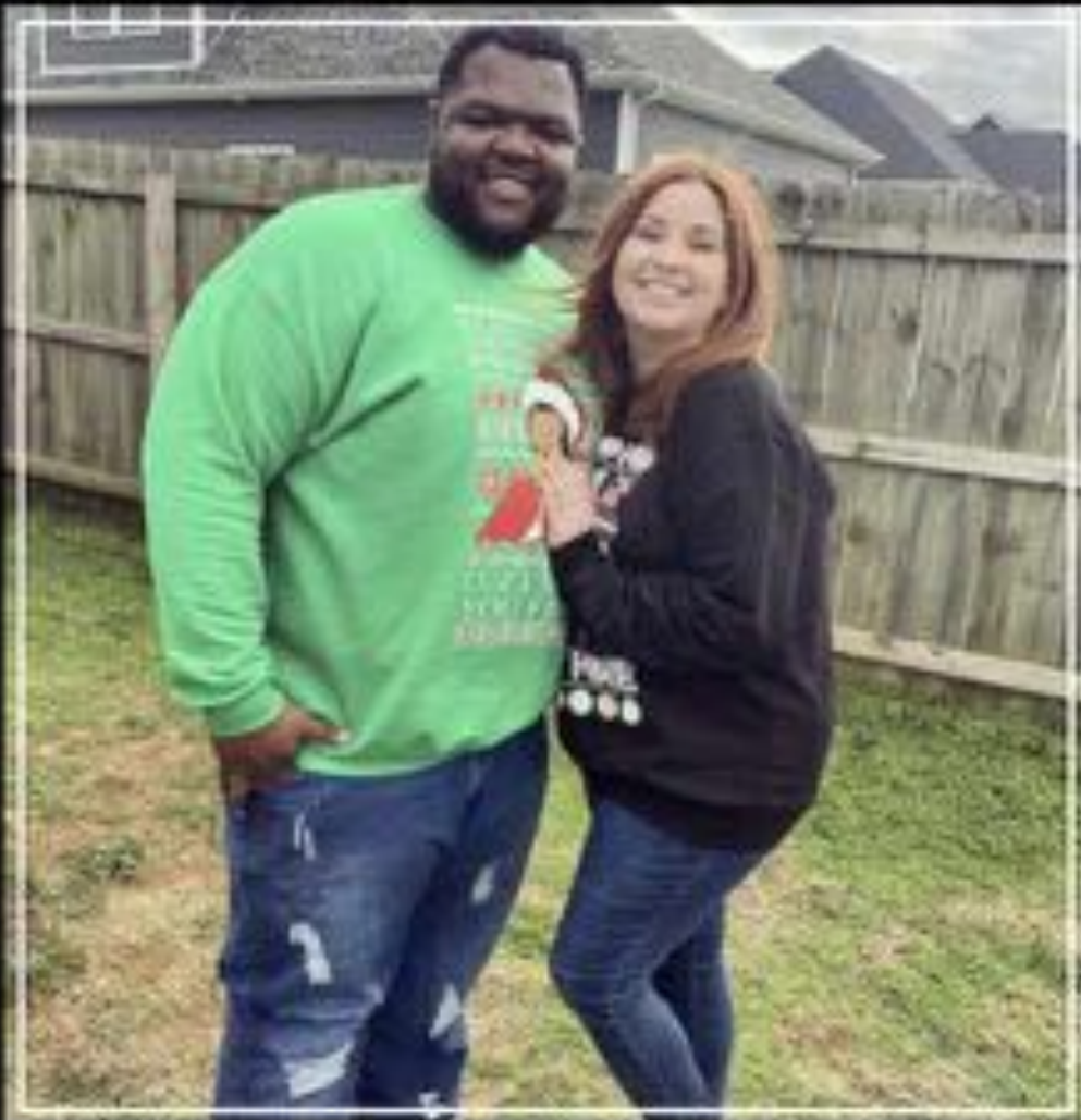
Our annual matching Christmas sweatshirts