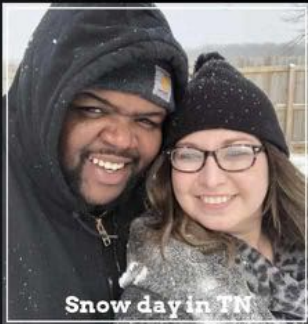
Snow day in TN