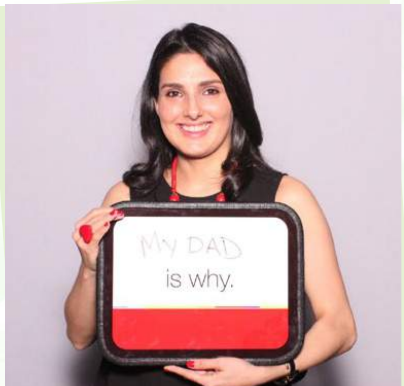
American Heart Association Fundraiser

I feel very fortunate that we found each other, and the idea of being parents together makes me feel that way all over again!