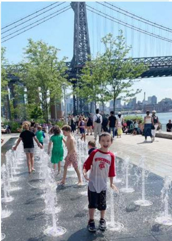
Our nephew at the nearby riverside park

The neighborhood we live in is diverse and thriving. New restaurants and stores have opened up, and our farmers market expanded, so we are spoiled with great, healthy food options. In very close proximity are several ethnic communities (Dominican, Jewish, Italian, and Polish), which provide an abundance of opportunities to experience different cultures.