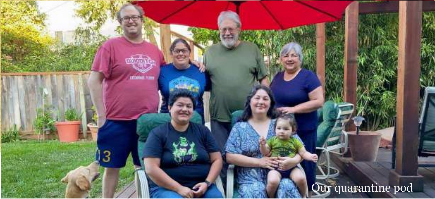
Our quarantine pod