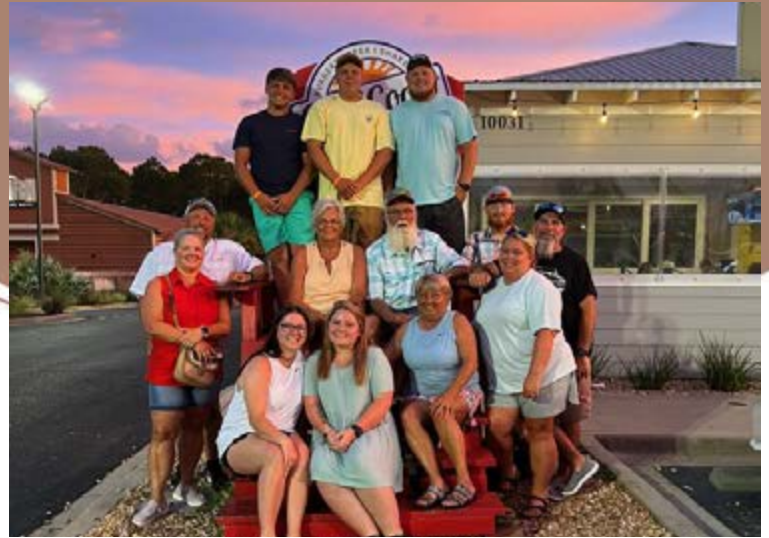
Family Beach Trip 2022