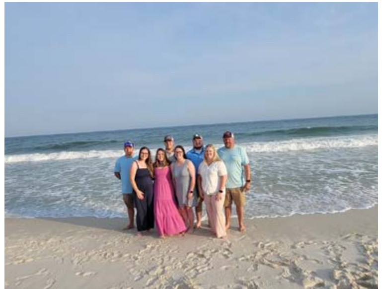
Family Beach Trip 2023