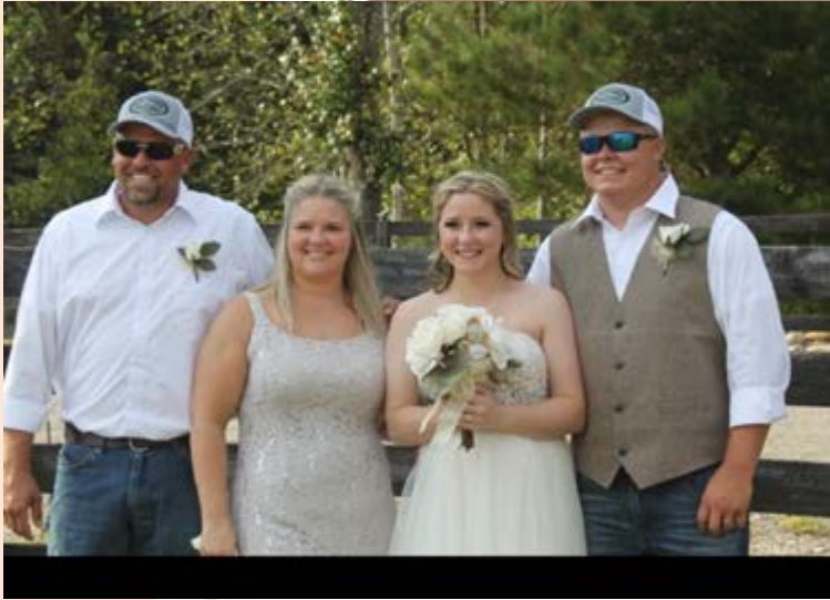
Our Wedding 2019