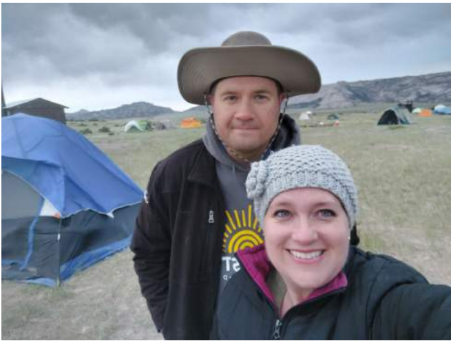
We were a 'Ma' and 'Pa' on a pioneer trek...it was cold!