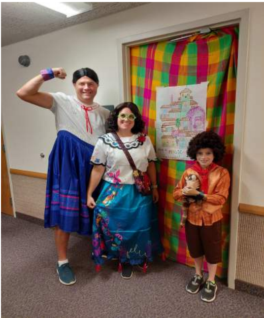
We love to coordinate Halloween costumes