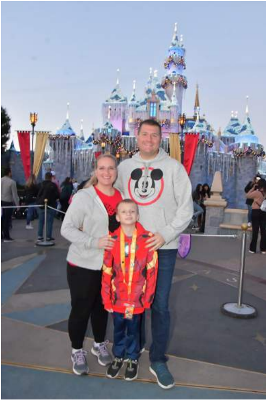
We love Disney!!