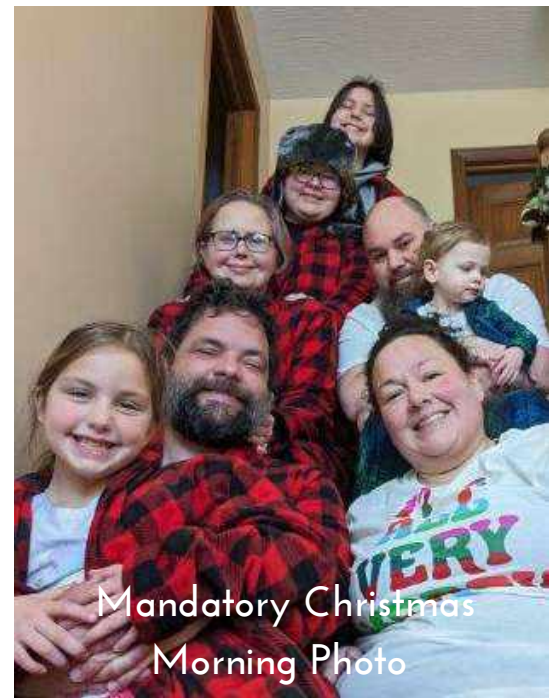
Mandatory Christmas Morning Photo