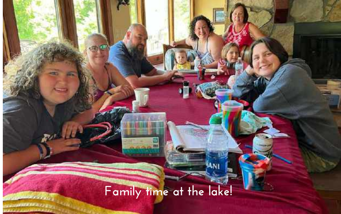
Family time at the lake!