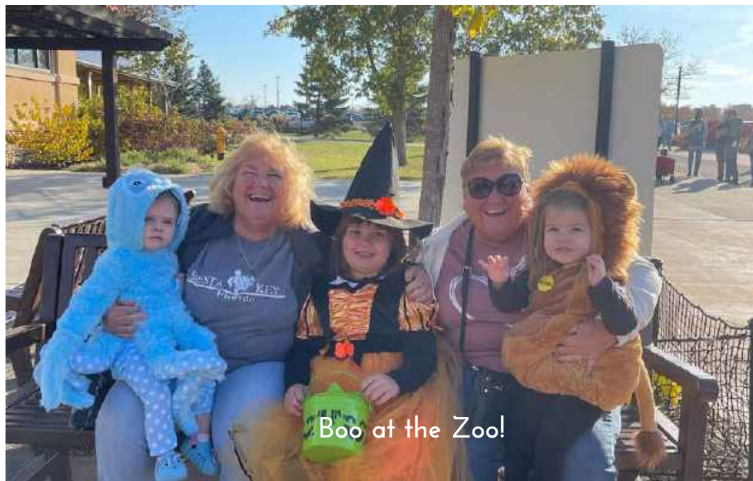
Boo at the Zoo!