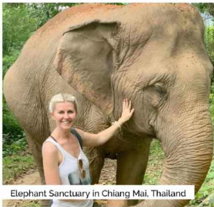
Elephant Sanctuary in Chiang Mai, Thailand

I'm a cosmetic nurse and owner of a medical spa. Being the owner allows me the flexibility to adjust my schedule as needed for when the new baby arrives. My staff is extremely supportive and equally excited about our adoption! I plan to take off work for 12 weeks to bond with the baby. When I go back to work, we plan to have a private nanny/sitter in our home. My mother plans to help out as well!