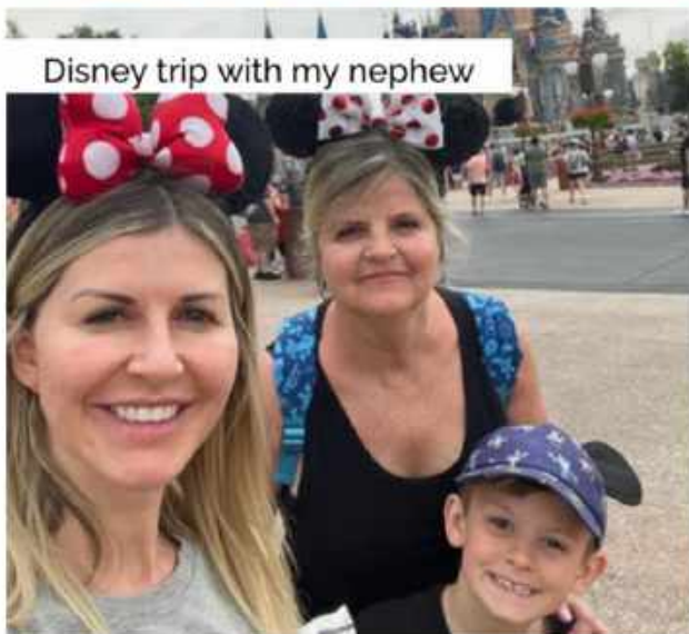
Disney trip with my nephew