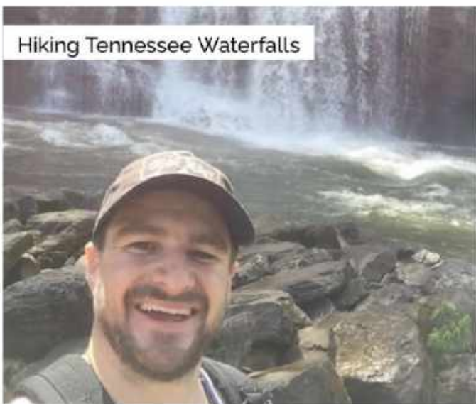
Hiking Tennessee Waterfalls