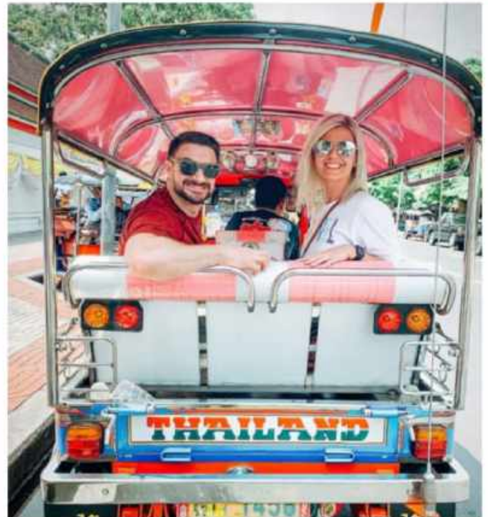
Riding a Tuk TuK in Thailand on our Honeymoon!

We have had countless incredible adventures together! We enjoy traveling to learn about different cultures and visit historical sites. We are foodies and love to research and try unique restaurants. We love visiting Florida to enjoy the beach. There's even a dog beach where we can bring our dogs, to enjoy the sunshine.