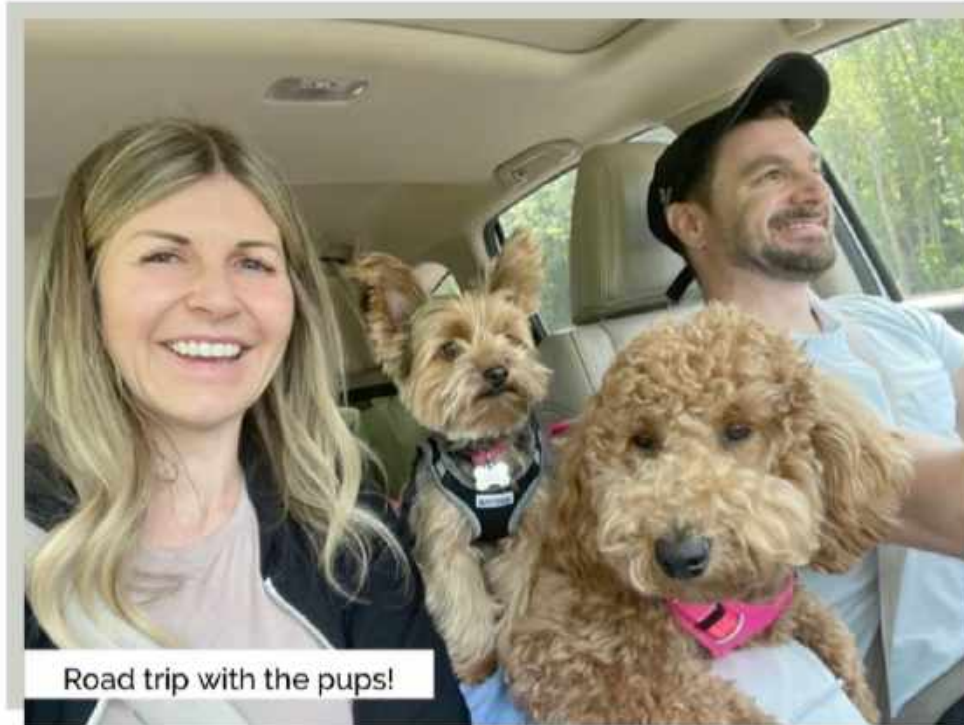
Road trip with the pups!