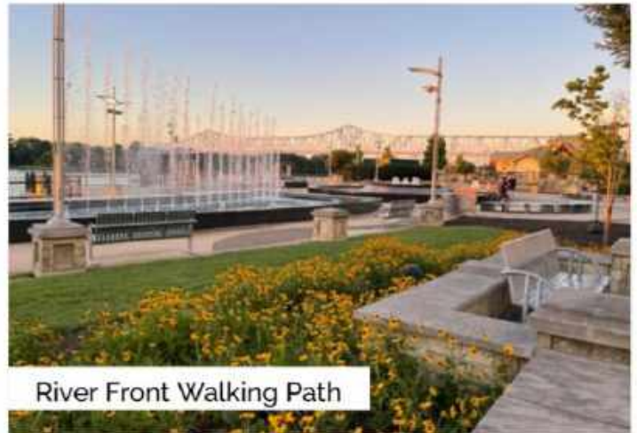
River Front Walking Path