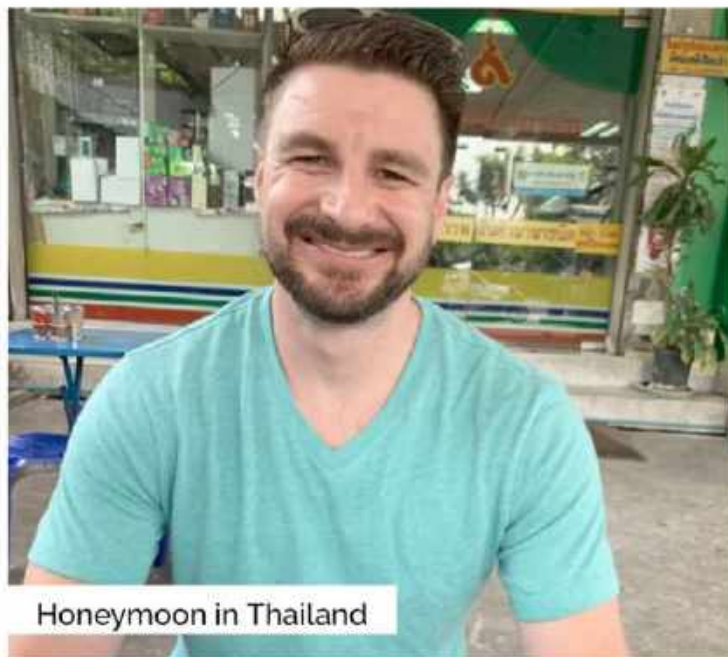
Honeymoon in Thailand