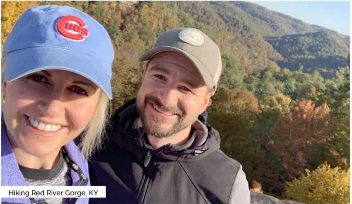
Hiking Red River Gorge, KY