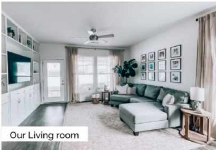
Our Living room