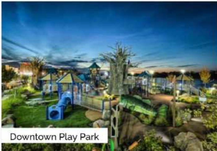
Downtown Play Park