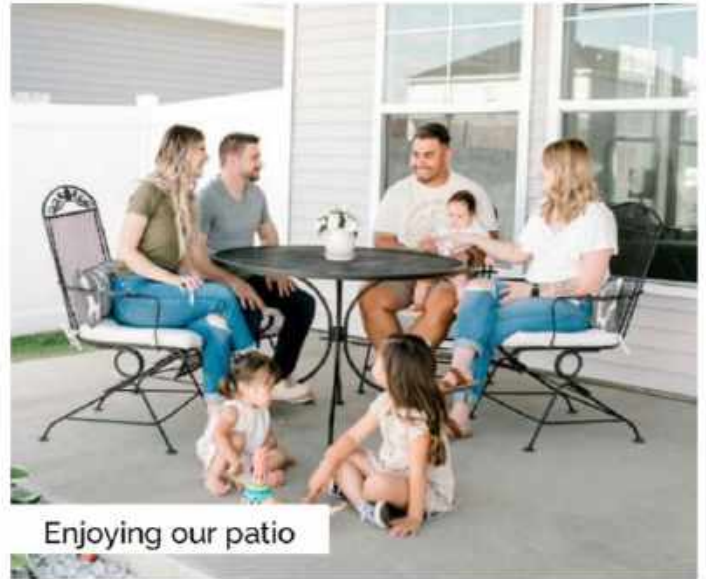
Enjoying our patio

We love the small-town lifestyle and have a wonderful support system here. We reside in a very diverse neighborhood in a small town where there are lots of young couples raising their children. It is a quaint little community nestled right beside the Ohio River with a beautiful waterfront playground that is rated one of the best in the world. The schools are fantastic, and the community has several family events throughout the year. We are so grateful to start a family in such a wonderful place.