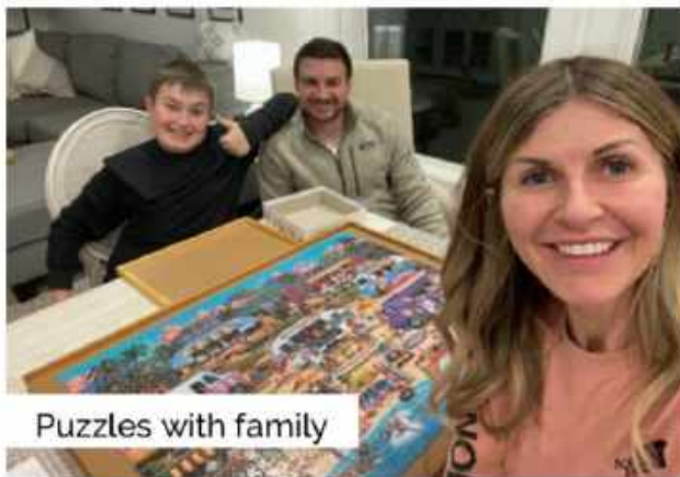
Puzzles with family