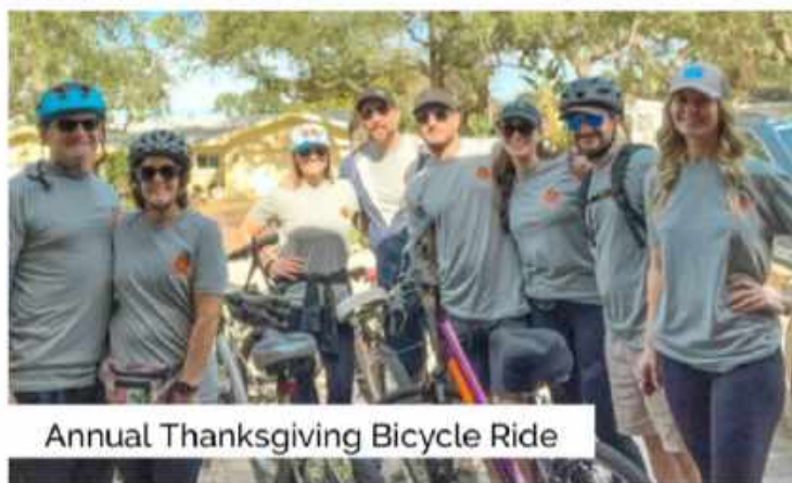
Annual Thanksgiving Bicycle Ride