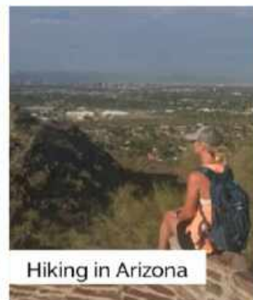
Hiking in Arizona