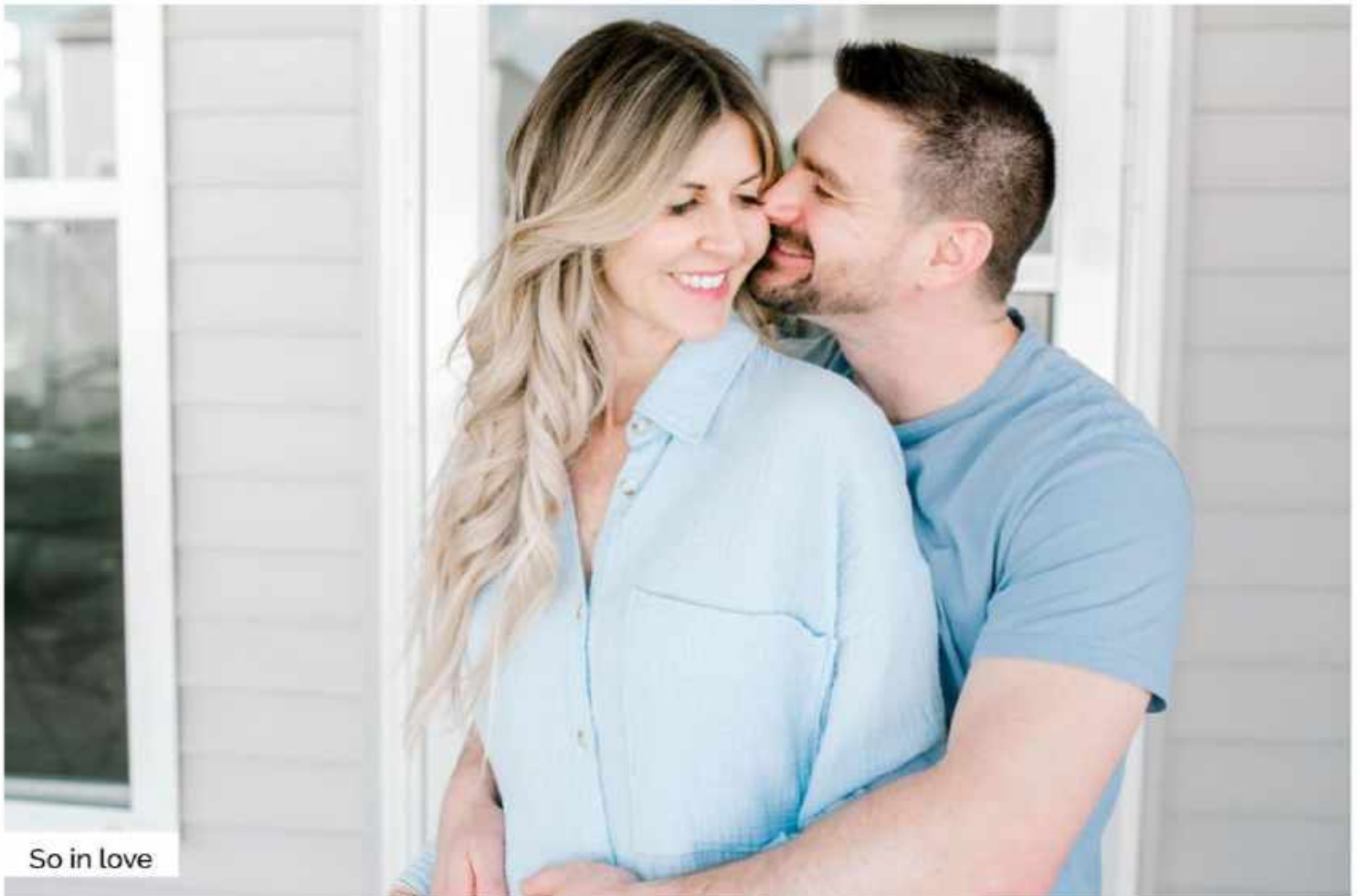
So in love