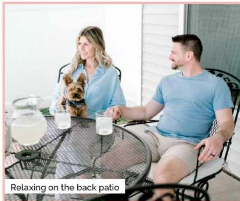
Relaxing on the back patio

We have lived in our three-bedroom, two-bathroom home since 2020. We love hosting dinners and barbecues with family and friends. In the mornings, you can find us on our back porch enjoying a freshly brewed cup of coffee as the sun rises. There is a covered back porch and a fenced-in backyard, perfect for a child to play and explore in.