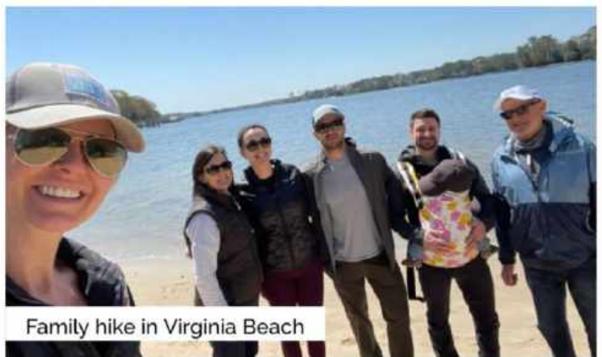
Family hike in Virginia Beach