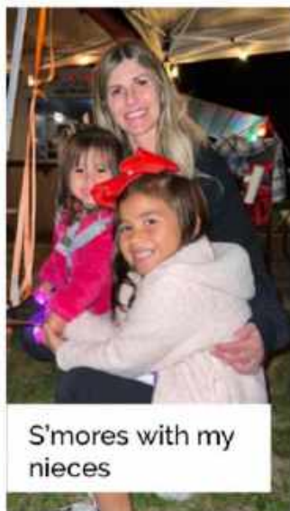
S'mores with my nieces