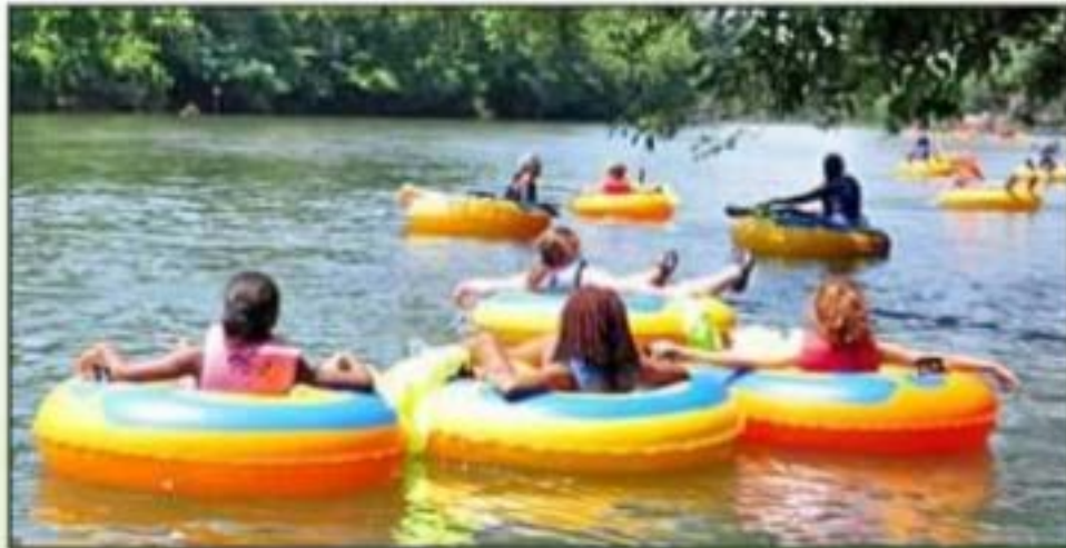
Tubing down the Chatahoochee River

Atlanta has so many fun things to do. We love to visit the aquarium downtown, go to Braves games or Six Flags amusement park, and even visit or tube on the Chattahoochee River.