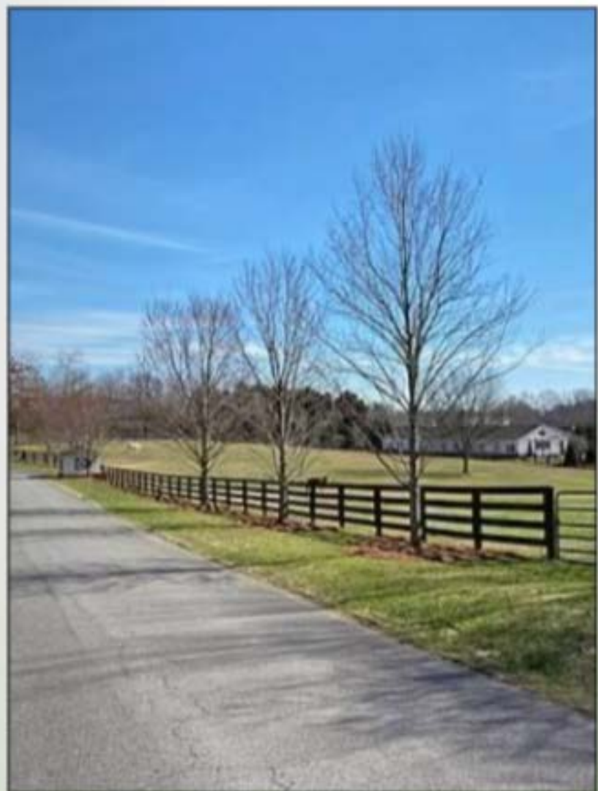
Horse farm behind our house