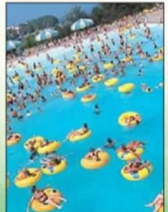
Water Park at Lake Lanier