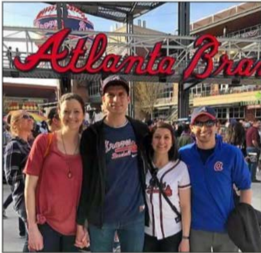
Atlanta Braves game