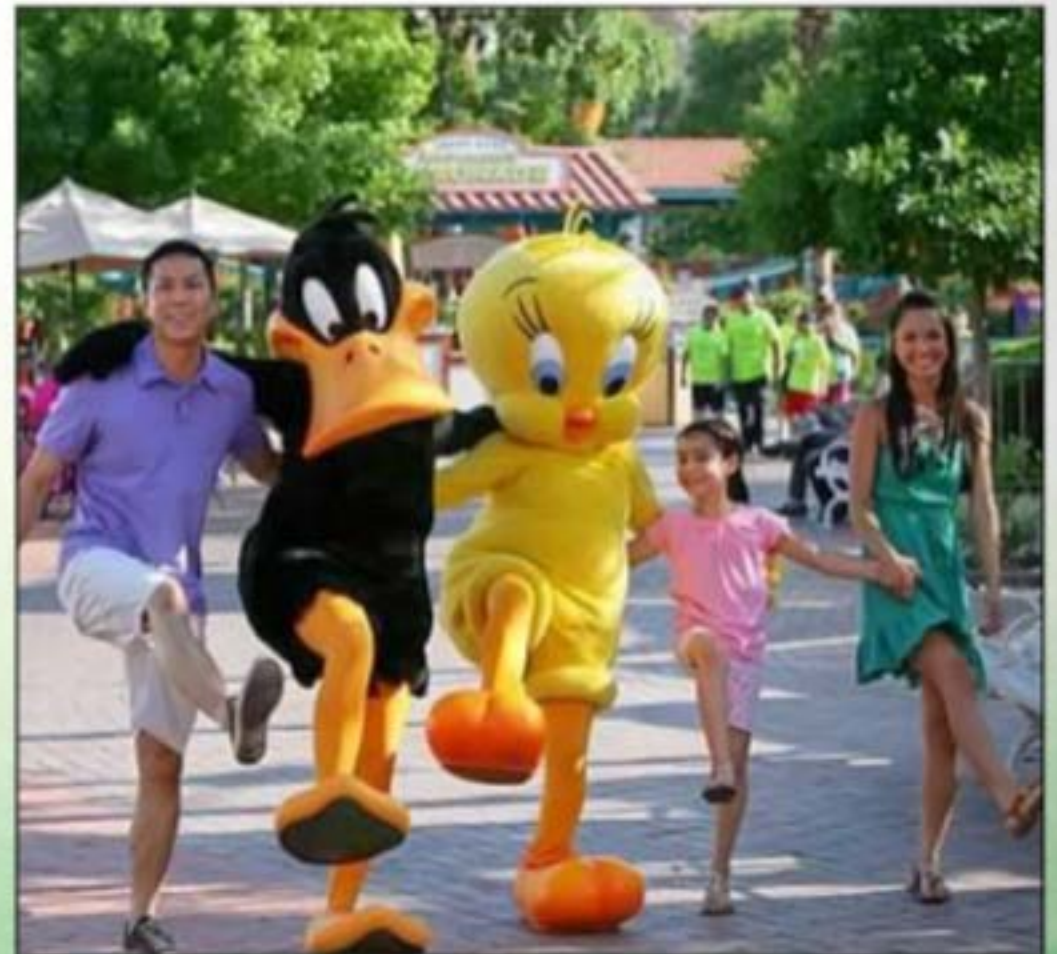
Six Flags Over Georgia

Atlanta has so many fun things to do. We love to visit the aquarium downtown, go to Braves games or Six Flags amusement park, and even visit or tube on the Chattahoochee River.