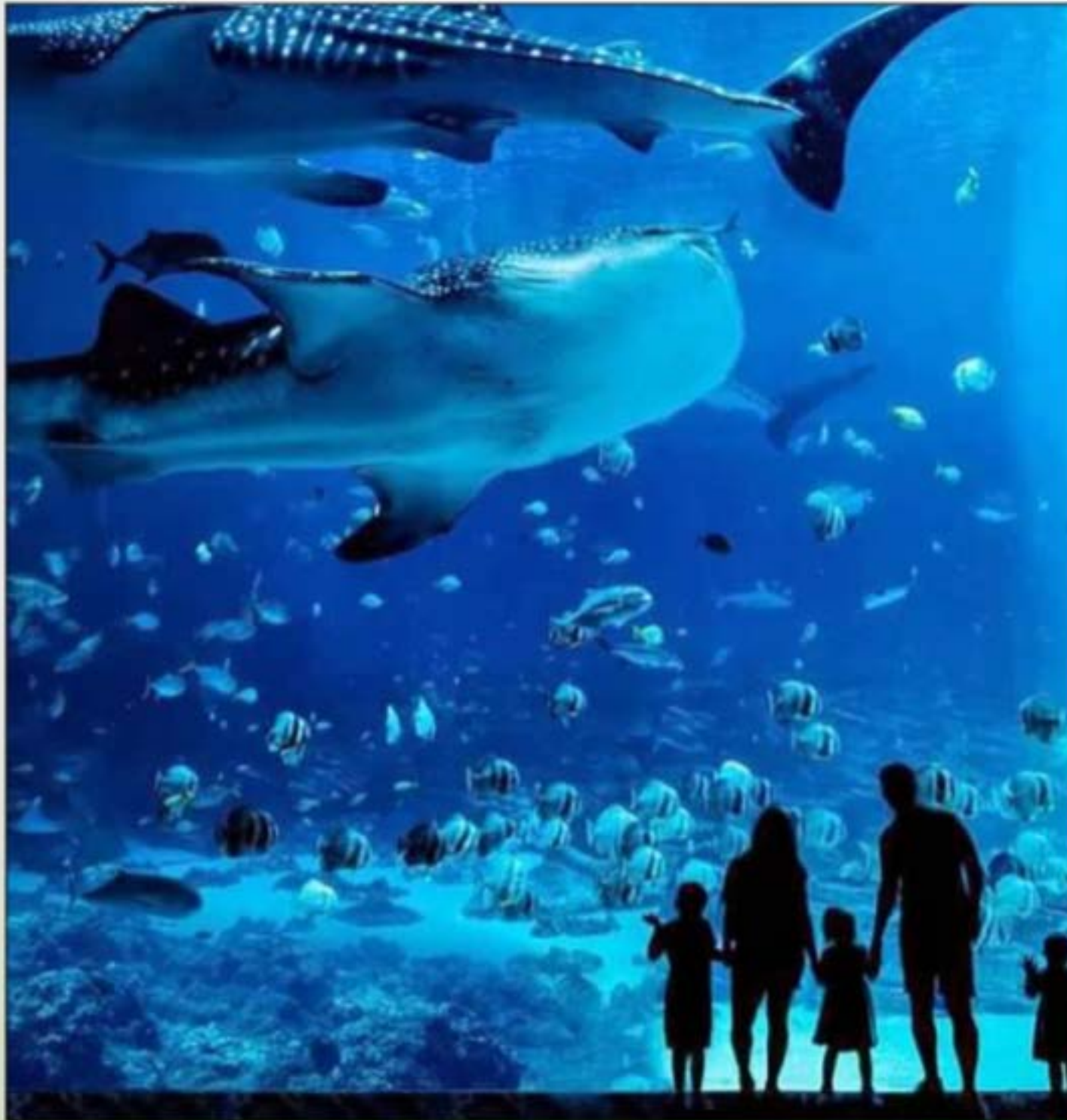
Whale sharks at the Georgia Aquarium