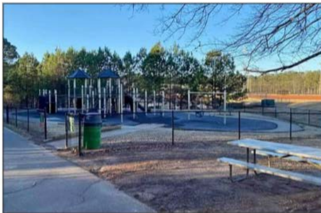
Playground at the nearby park