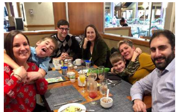
Us and the Family and Nephews