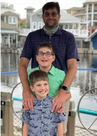
Our Brother-in-Law and Nephews

spending time with her and our brother-in-law and two nephews, which is once every two or three months. One of our favorite activities is to plan a fun-filled visit full of family games, zoo/aquarium visits, outdoor activities, and more whenever we all get together. We spend holidays with both families, making sure to include all of our family traditions.