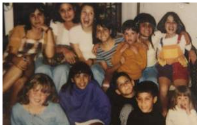
Endless Cousin Fun

It's a hot summer day and all my cousins' towels are lined around the pool. Coming from a large extended family I have always spent my summers surrounded by cousins. We are playing our favorite game "Sharks and Minnows". I am the shark and everyone tries to jump in quietly to make it across. My sister is the youngest and fast, and am able to tag her through our nonstop laughter.