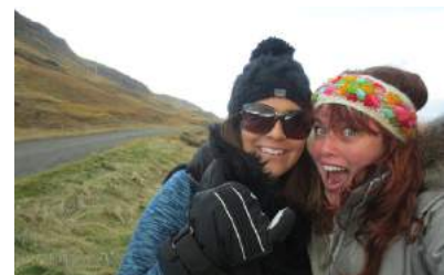
Life Long Best Friend

Our bond is deeper than a typical friendship since we are also cousins. We reminisce on the small duplex our families shared and the time we had a picnic with our favorite chips, Cheetos. We were building sandcastles at the bay and glanced at our blanket watching in horror as our lunch was viscously raided by seagulls. My Mom tried to chase them but it was too late. The Cheetos were gone!