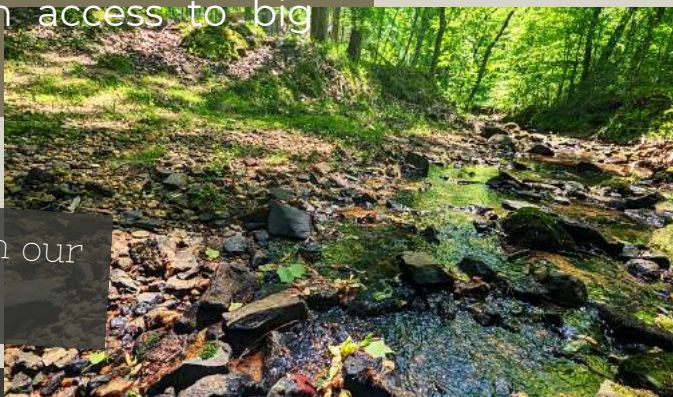
The creek in our backyard