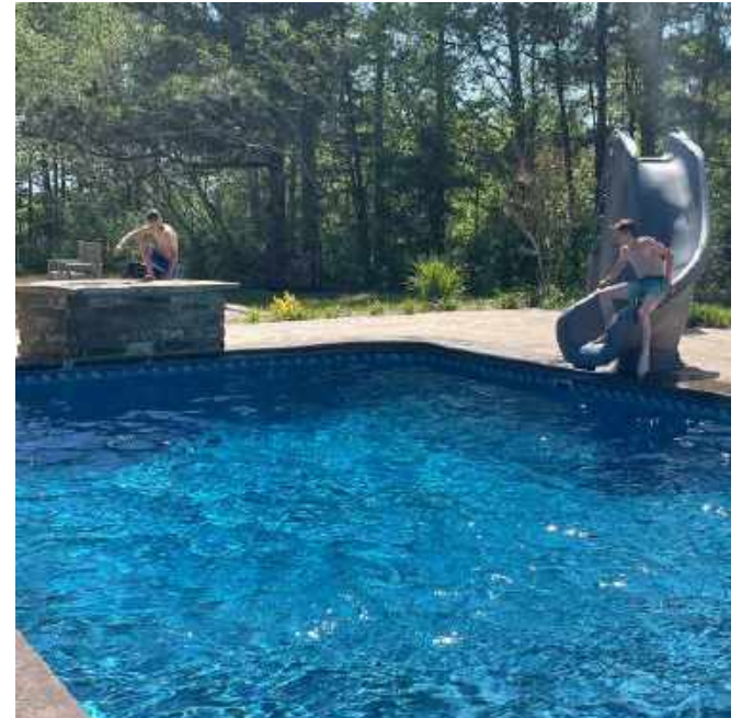
NIECES, NEPHEWS, HUNTING, SPORTS AND SWIMMING IN THE BACKYARD