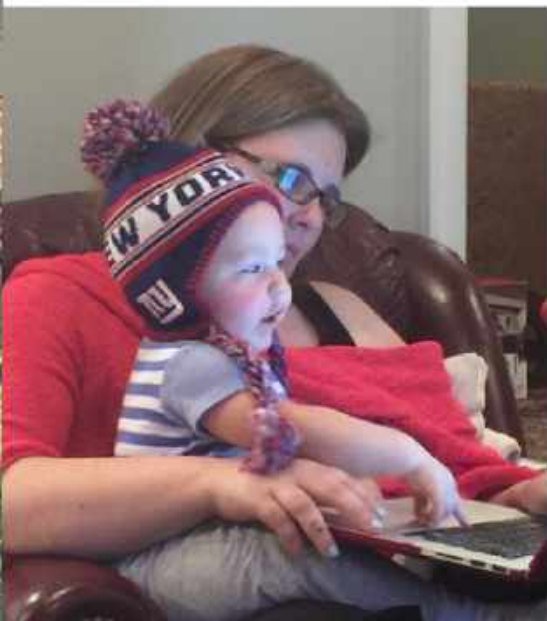
Me with my Nephew