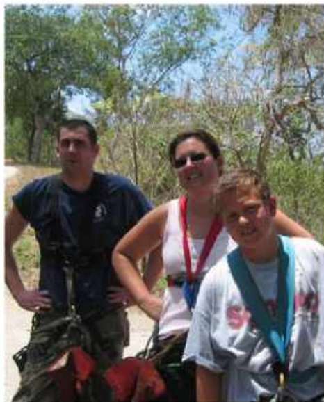
With Brothers in Costa Rica