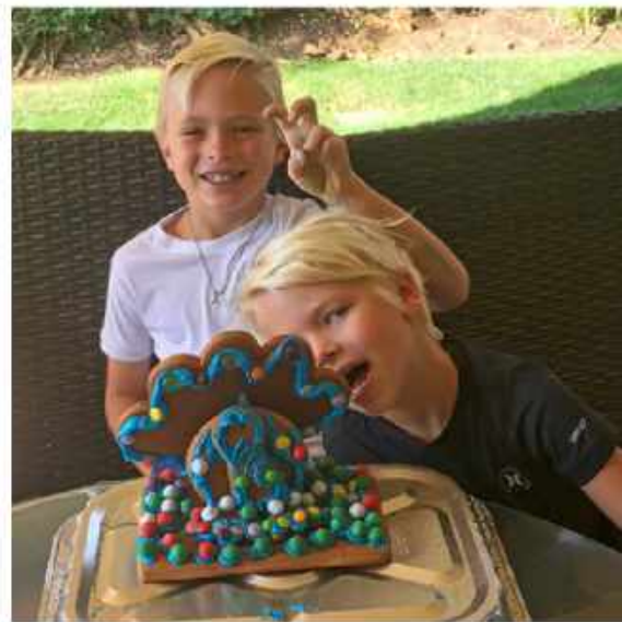
My nephews decorating a Gingerbread Turkey, Thanksgiving

3 • I was the first female in my high school to earn 12 Varsity letters; 4 in Field Hockey, 4 in Basketball, and 4 in Track & Field.