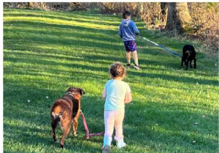
My Niece and Nephew walking my dogs

They are always excited to throw tennis balls for them or give them treats – and the dogs love it, too!