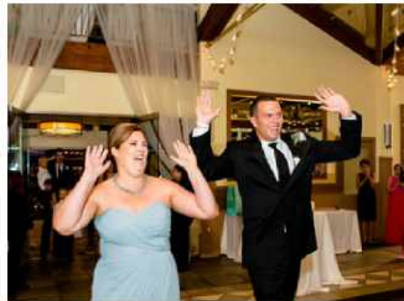
Me with my Brother making our entrance at a wedding