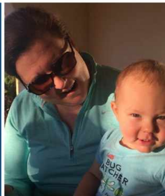
Me with my Nephew

the kids in my life bring me so much joy.