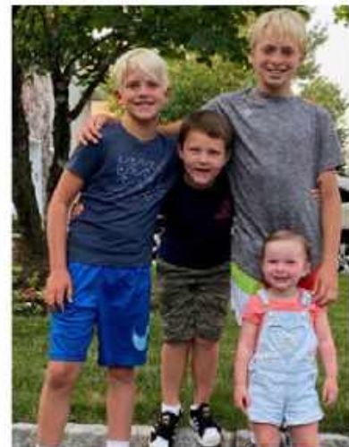
My Nephews and Niece