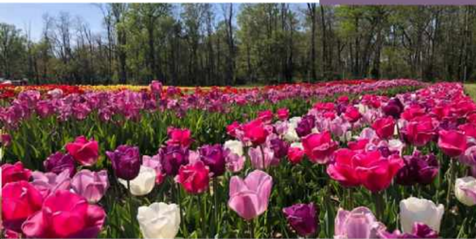
A tulip farm in New Jersey - my favorite!