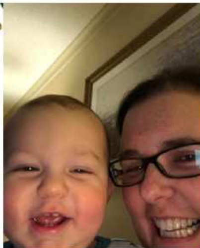
Me with my Nephew