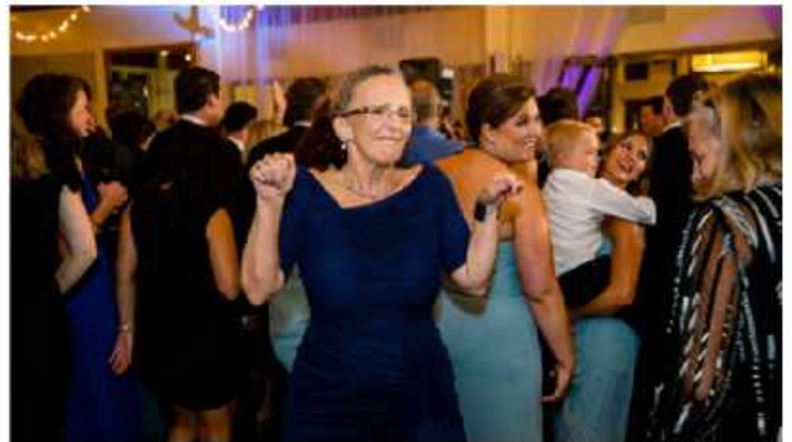
Me dancing with my Aunt at a wedding

My mom, my dad, my aunt, my uncles, my brothers, my sisters in law, my nieces, and my nephews – they are my people. They are my support system as well as a constant source of laughter, love, joy, smiles, and adventure.