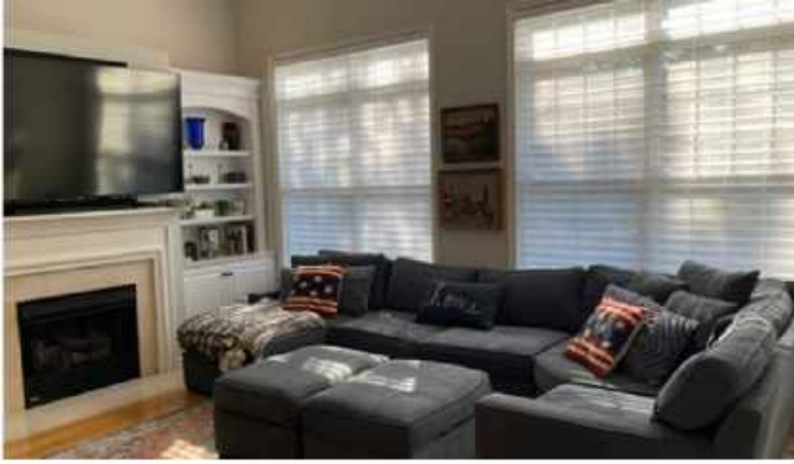
My family room