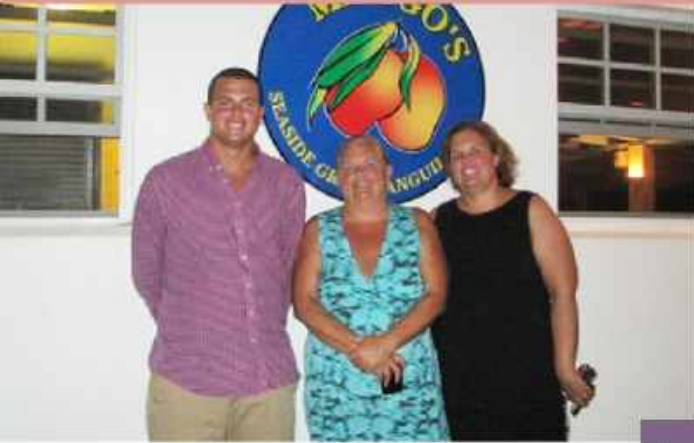
With my Mom and Brother in Anguilla