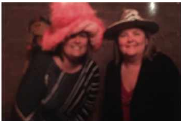
Me with my Mom at Halloween