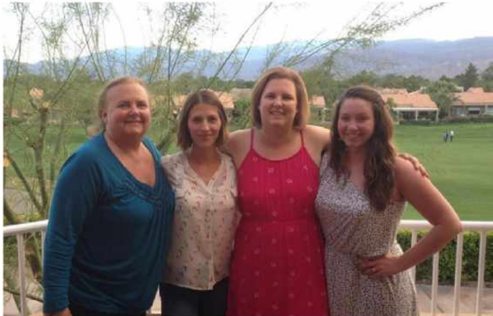
Me with my mom and two sister in laws in Palm Springs, California