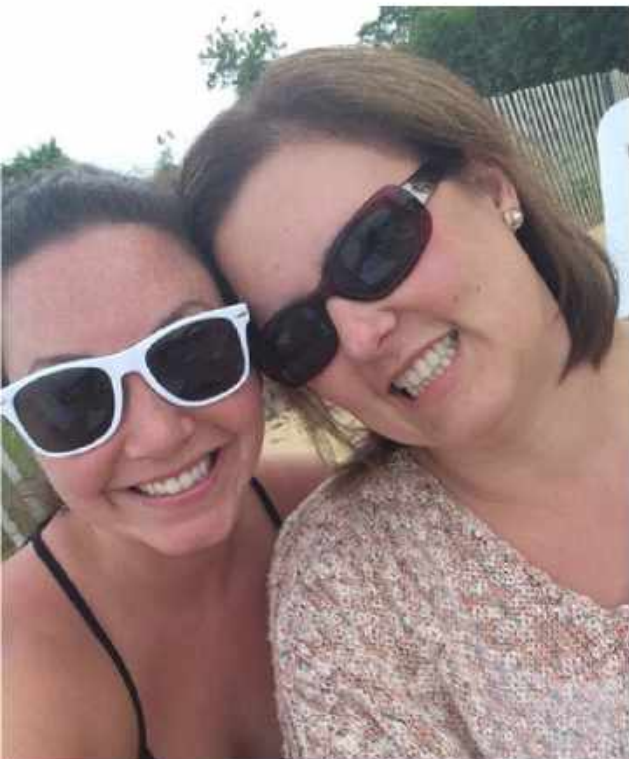
Me with my Sister in Law

I babysat throughout high school and college, and continue to babysit for my nieces and nephews now.