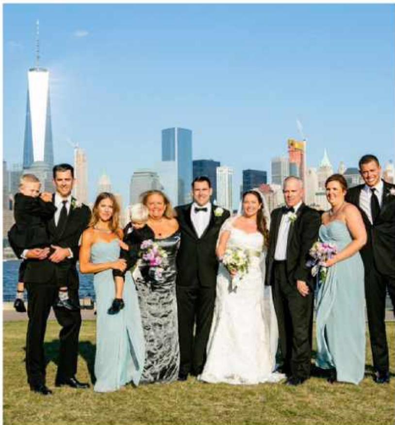
Me with my family at my Brother's wedding