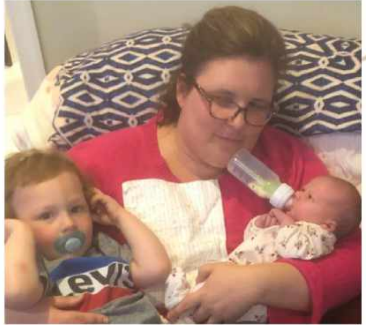
Me with my Niece and Nephew

I ENJOY EVERY MINUTE I SPEND WITH MY FAMILY.