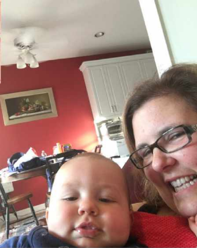
Me with my Nephew