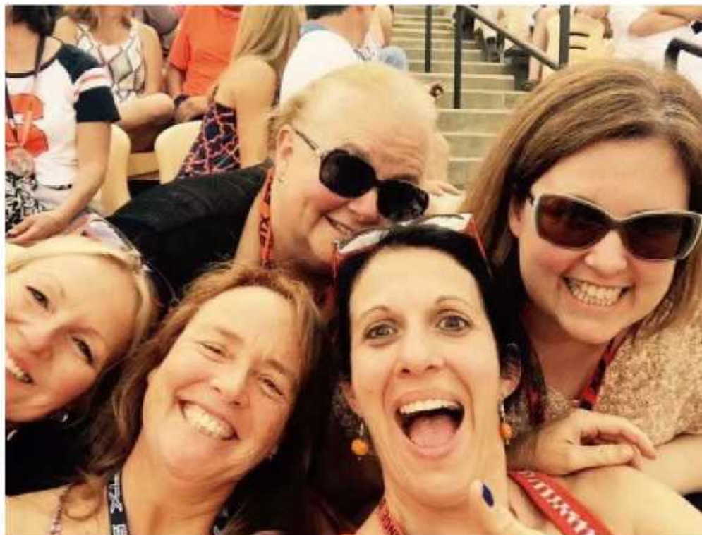
Me with my Mom and friends at a lacrosse game

My family and friends consider me loving, fun, loyal, and responsible. I am a positive and happy person. I believe in being kind and humble, and am raising my child to be the same.