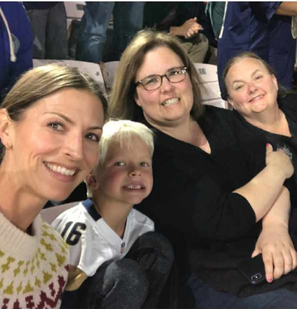
Me with my Sister in Law, Nephew, and Mom at a football game