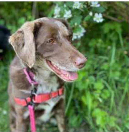
Lexi, my rescue