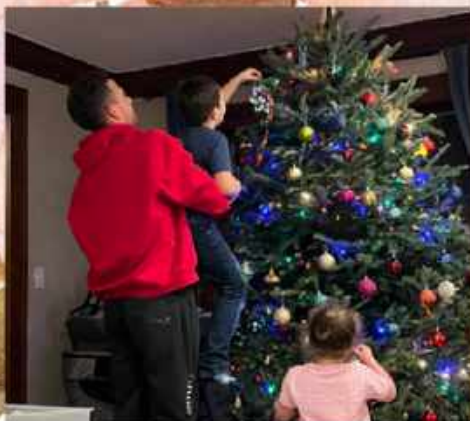
My Brother, Nephew, and Niece decorating Christmas tree