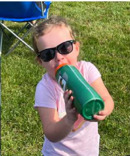
My Niece watching soccer

the kids in my life bring me so much joy.