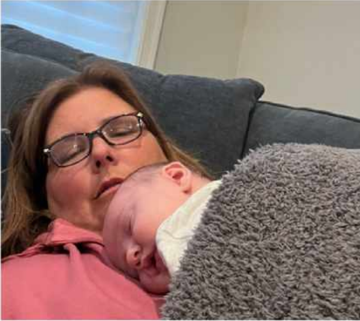
Me with my (newest) Niece