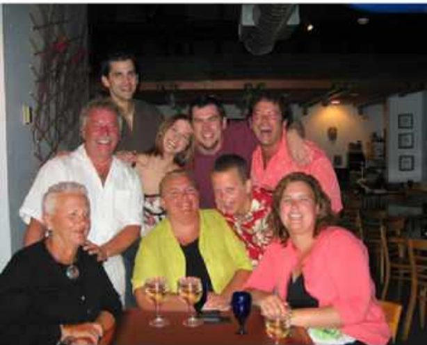
Me with my Grammy, Brothers, Mom, and family friends in Hawaii

I have a true passion for and absolutely love to travel the world! I travel as often as possible. Now that traveling is safe again, I look forward to traveling after adopting so that your child can see the world with me. I also love that I don't have to go far from my own home to enjoy museums, zoos, shows, and summer activities that my community offers. I am excited to introduce different types of life experiences to your child and I can't wait to explore even more with them!