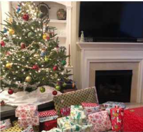
Christmas at my house