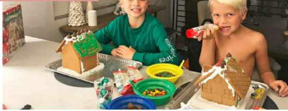
My Nephews decorating gingerbread houses