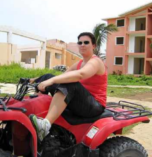
ATV'ing in Dominican Republic