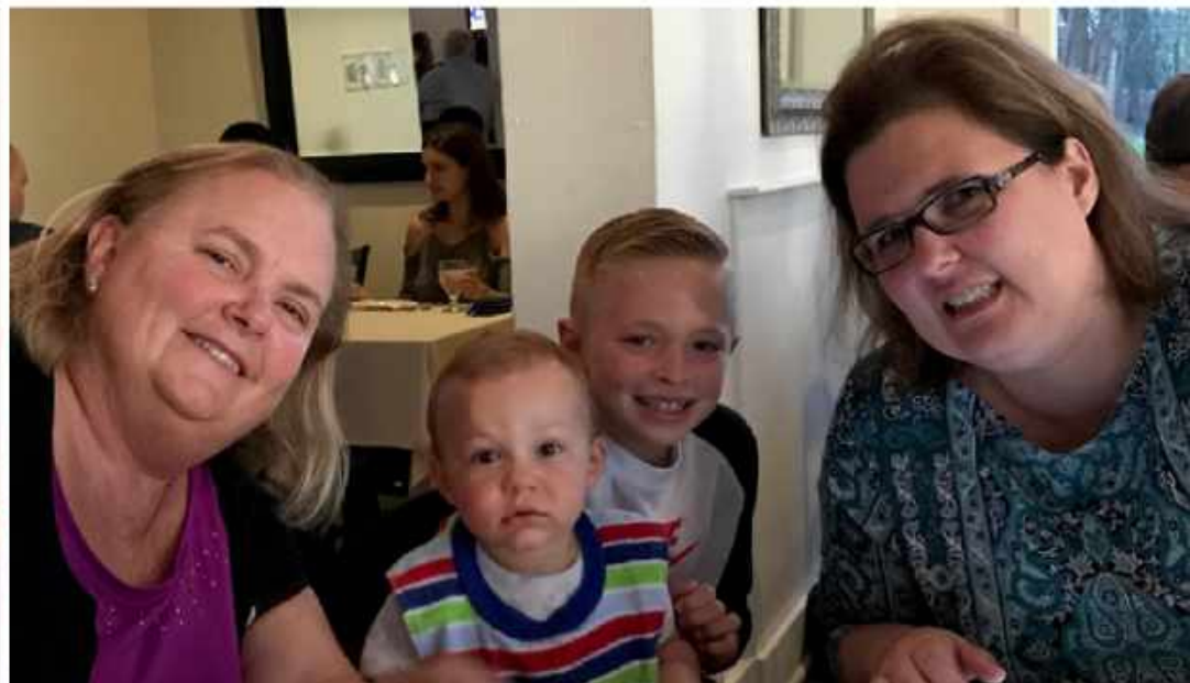
Me with my Mom and two of my Nephews out to lunch