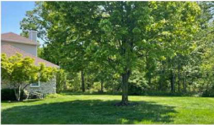
Woods across the street from my house

My home is my happy place and I find pleasure in the simple things like cooking, listening to music, walking my dogs, having friends over, watching a show on tv - and most of all - having a playdate with my nieces and nephews.