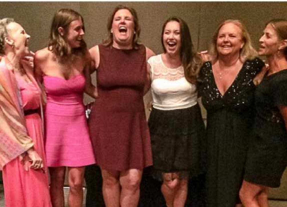
A night out with friends

I was born and raised in a small town in New Jersey – not far from New York City. After graduating from college, I lived in Boston for several years before moving back home to be closer to my family! I love to travel, cuddle with my two dogs, cook, spend time with my nieces and nephews, watch sporting events, volunteer, read, go to the mountains, and visit the beach.