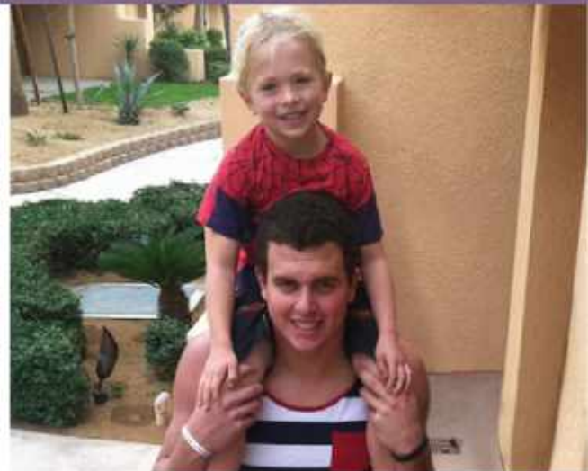
My Brother and Nephew

Beautiful flowers and baking. Telling jokes and being silly