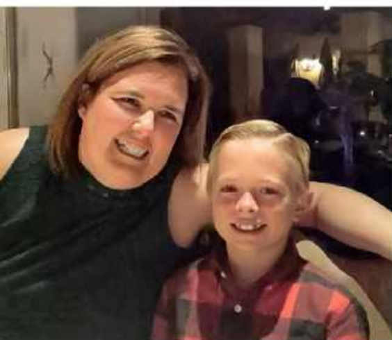
Dinner with my Nephew