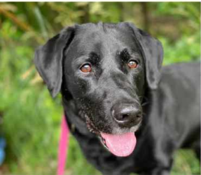
Dakota, my Lab