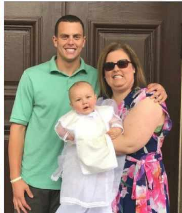
Me with my Brother and Godson

I have a very flexible, successful career in real estate and I truly enjoy it. I love its flexibility, as it allows me to be a completely present mom. I make my own hours and a little one is always welcome to join me. I feel fortunate that my job allows me to be a full time, stay at home mom and when I do need a babysitter, I feel incredibly lucky because my mother lives right next door to me.