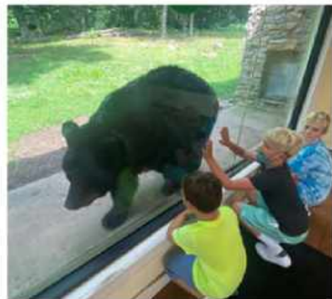
My Nephews at the Zoo