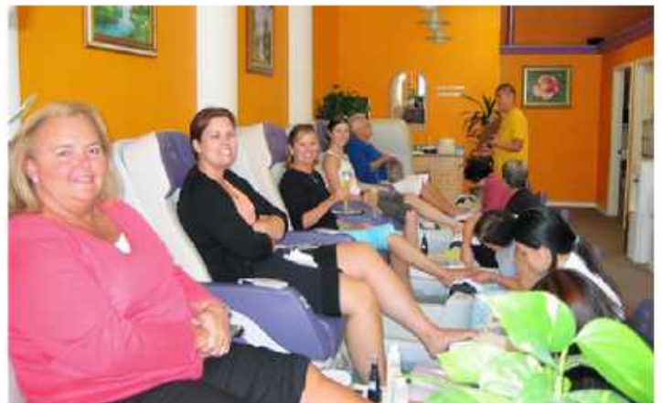
Me with my Mom, Sister in Law, and family friends getting pedicures