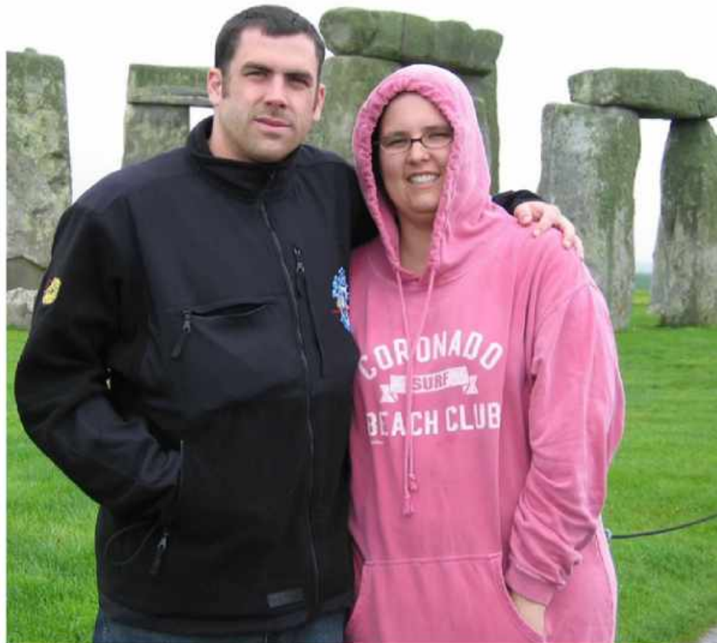
Stonehenge in England with my Brother