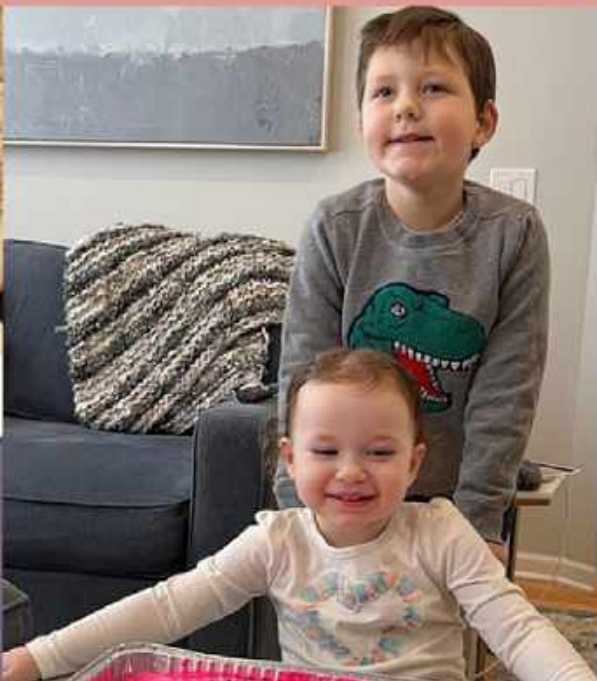
My Nephew and Niece

Beautiful flowers and baking. Telling jokes and being silly