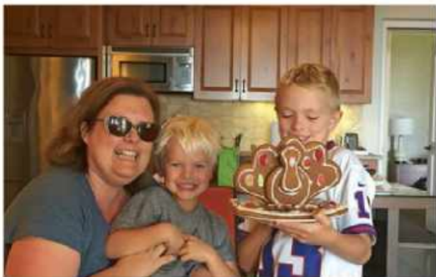
Me with my Nephews and our Thanksgiving Gingerbread Turkey