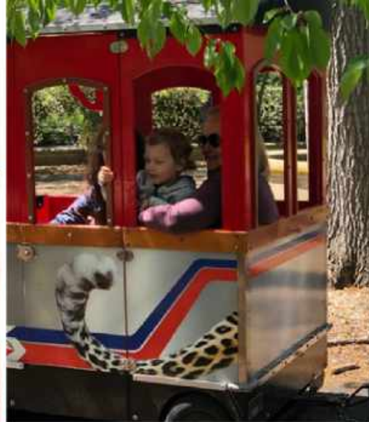
At the Zoo with my Nephew