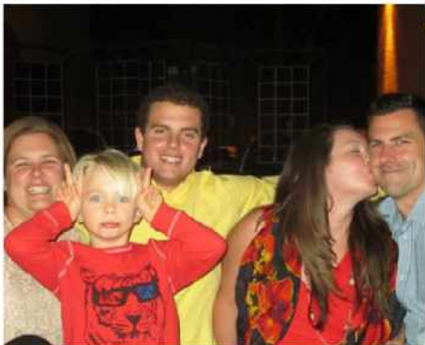
Me with my Nephew, brother, sister in law, and my other brother