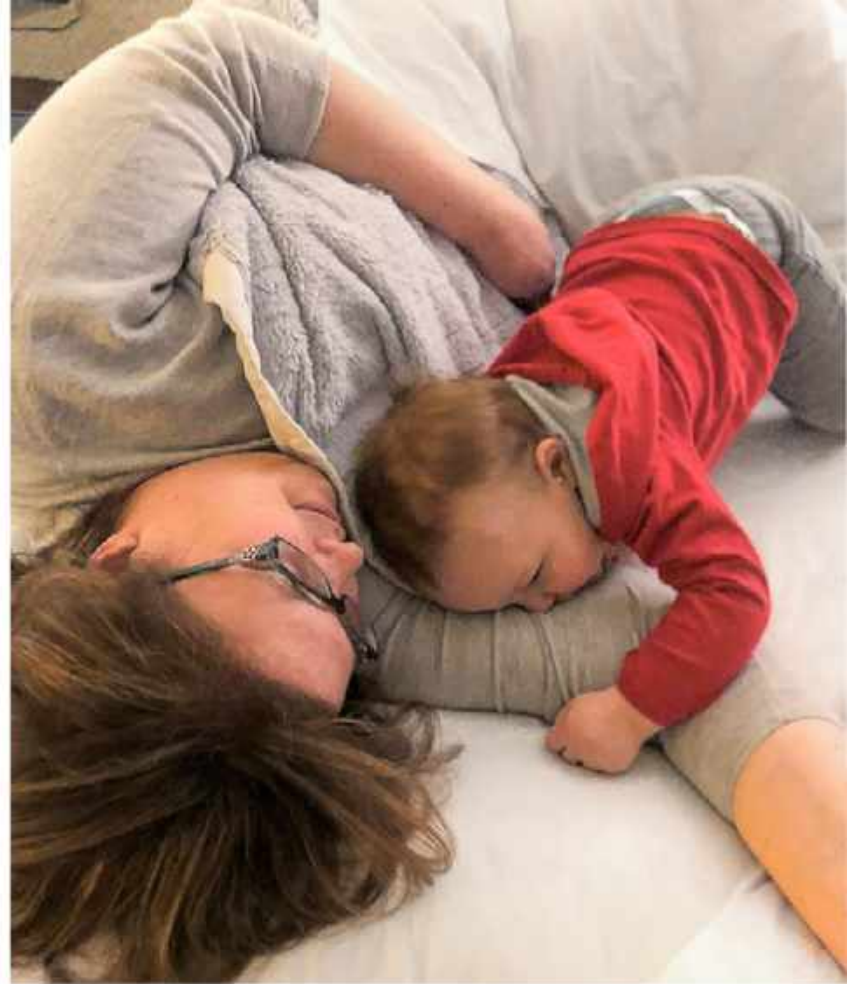
Being silly with my Nephew