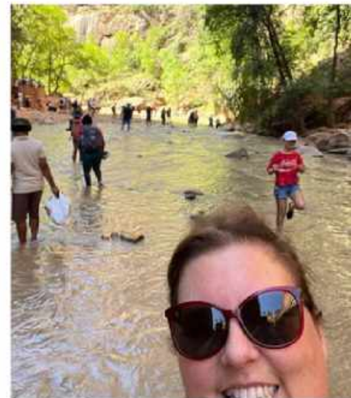
Me in Zion National Park, Utah