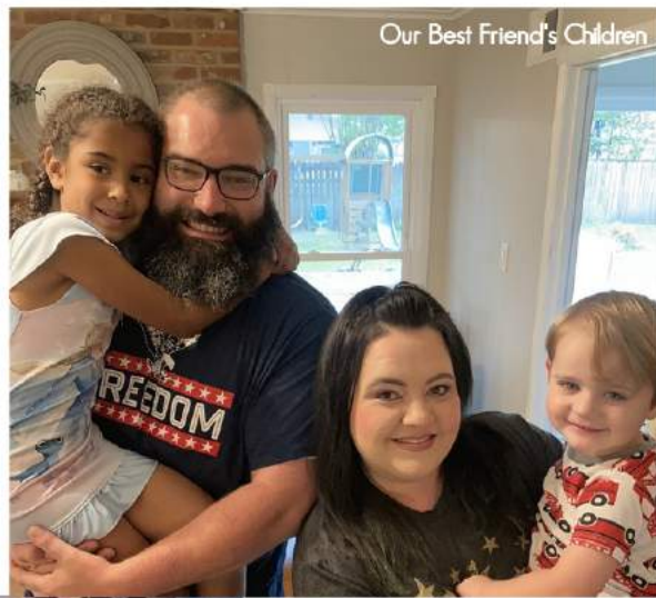
Our Best Friend's Children