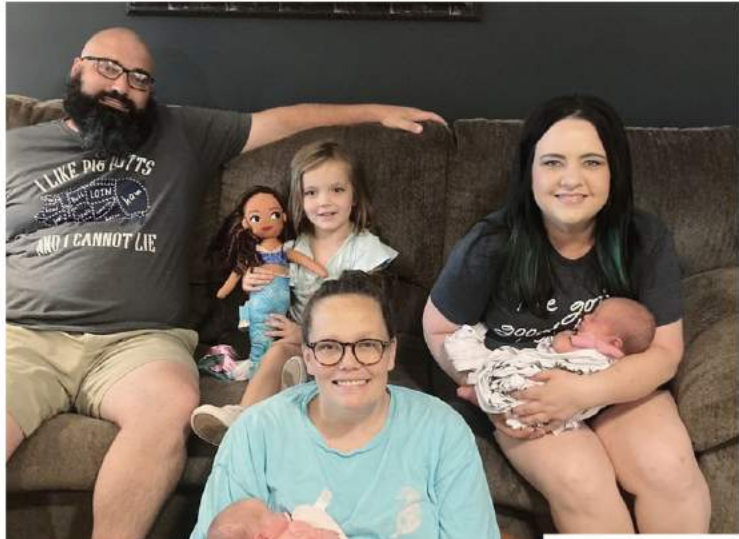
Our Best Friends & Their Daughter