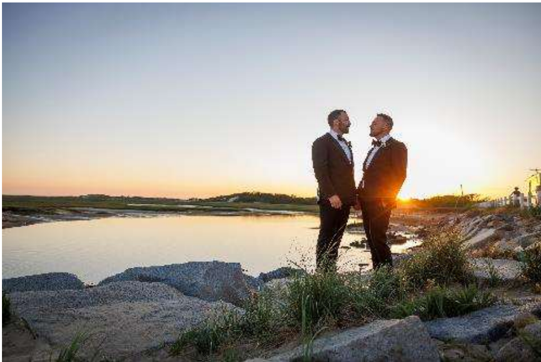
The sunset was spectacular for our special day.