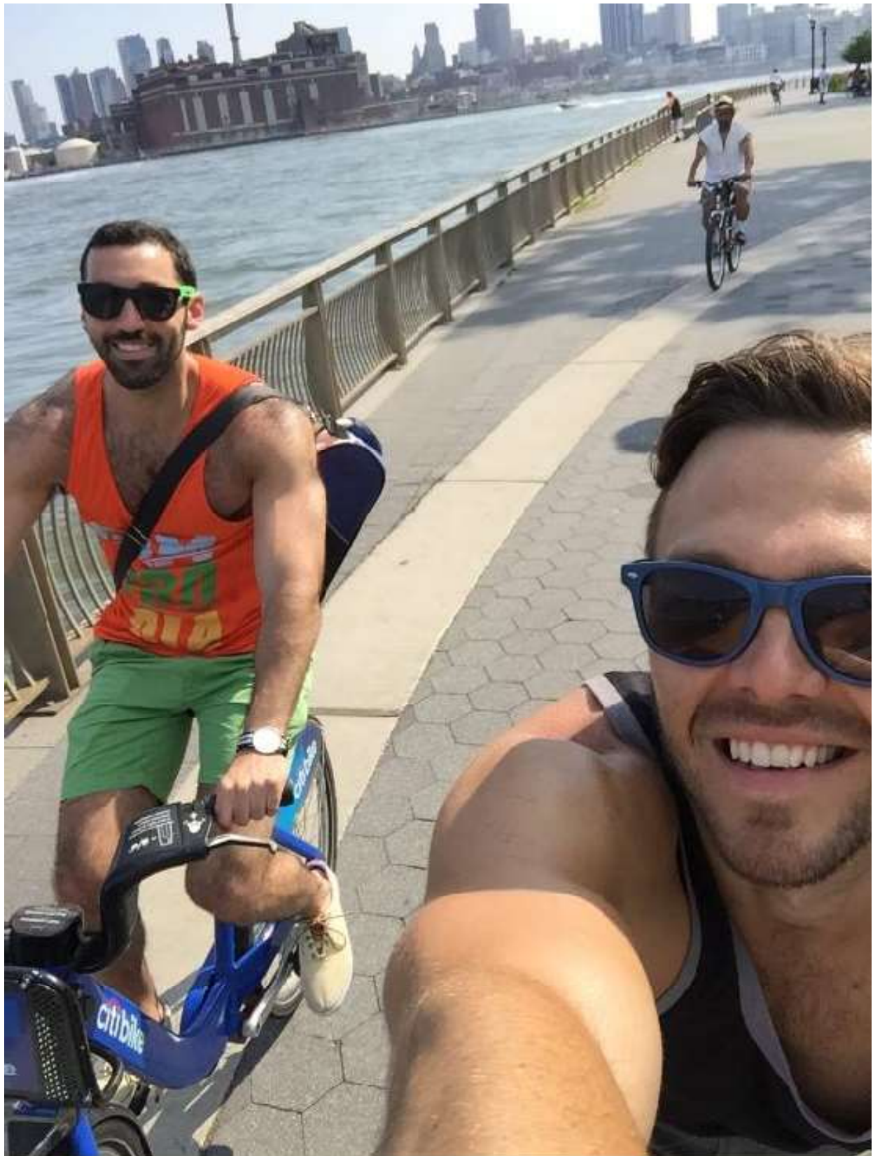
Our first summer together out in NYC biking.

Our dates to come centered around good food, long walks with Daisy, hikes, music and theater. We make the most of what New York City has to offer, whether it is cuisine from around the world or Broadway shows, sports or concerts.