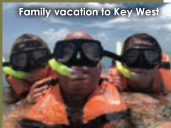
Family vacation to Key West