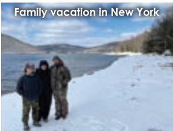
Family vacation in New York