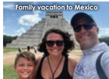
Family vacation to Mexico