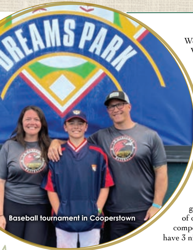
Baseball tournament in Cooperstown