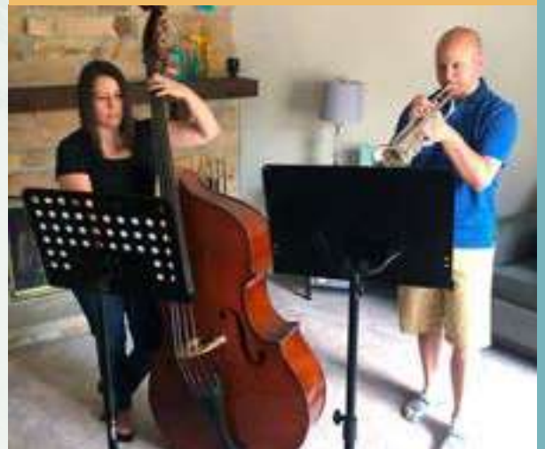
Summer music festival