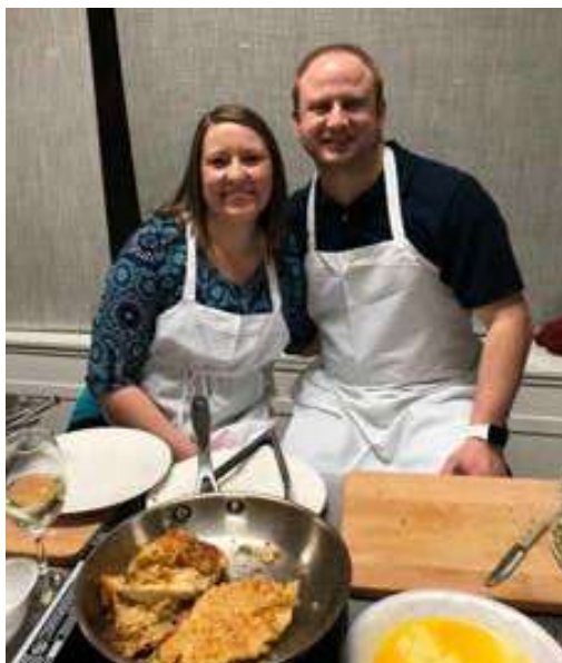
At a cooking class