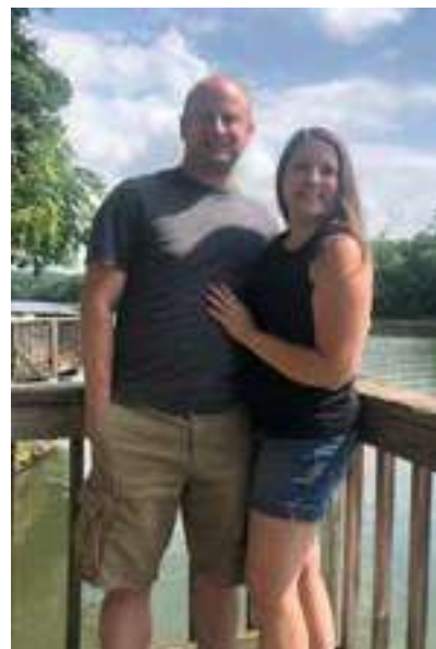
Exploring a park on vacation