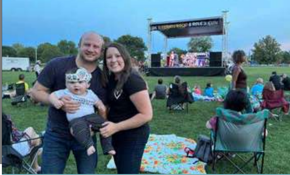
Summer concert in our community

Our community, along with many other neighboring communities, holds festivals throughout the summer months with good food, parades, carnivals, and live music. We have so many opportunities to get out to different festivals within a 15 minute drive of our home. We have been able to take Asher to many different festivals and are looking forward to doing this as a family of four someday.