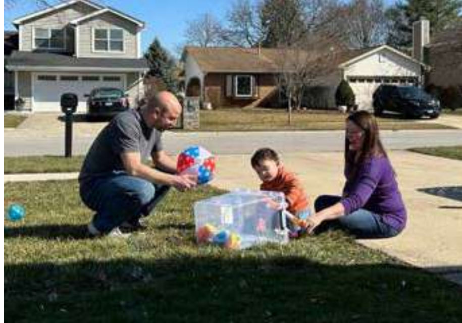
Playing outside as a family