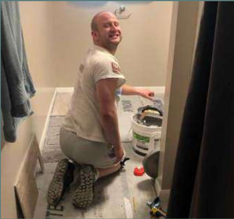
Working on a project around the house