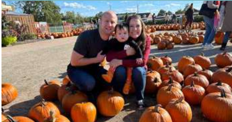
Visit to the pumpkin patch