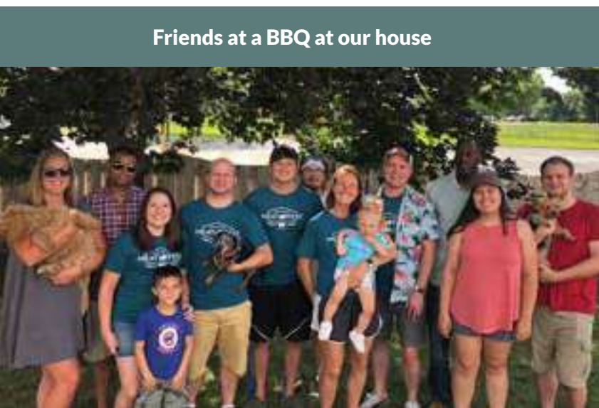
Friends at a BBQ at our house