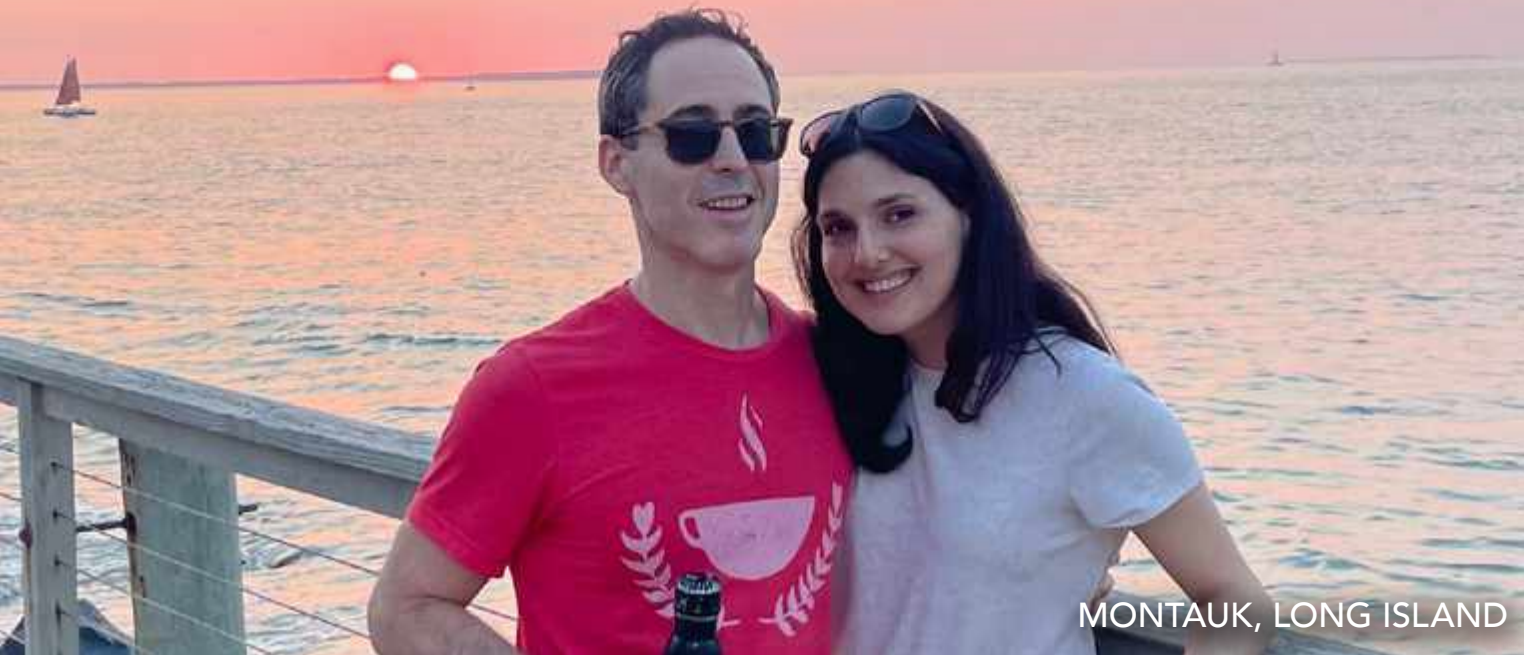
MONTAUK, LONG ISLAND