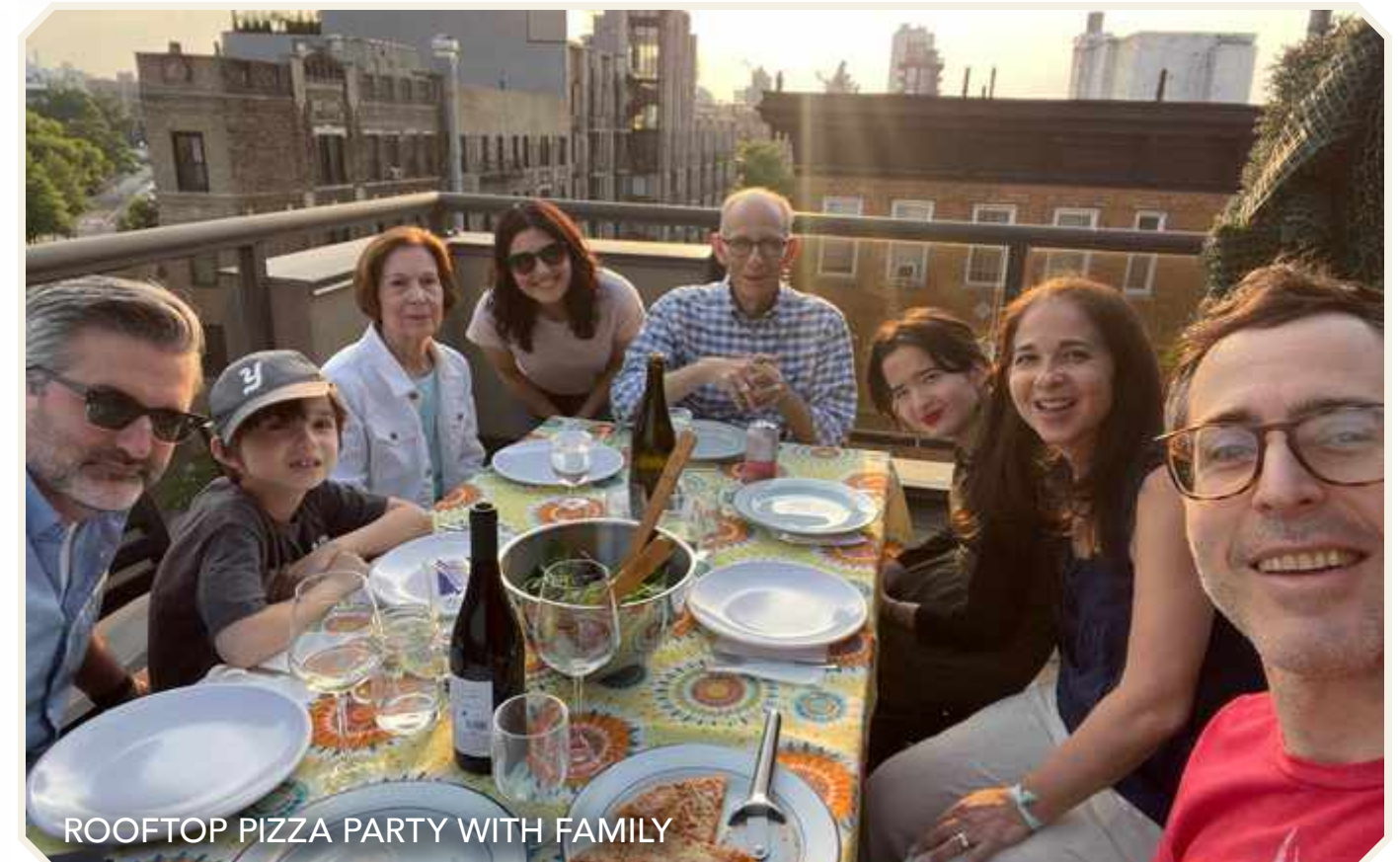
ROOFTOP PIZZA PARTY WITH FAMILY

Outside includes two beautiful rooftop patios that are private to our area; a courtyard, which we make good use of for relaxing, working, and entertaining; there are half a dozen parks in walking distance, small and large, offering everything from playgrounds with water features to sports fields to picnic lawns with incredible skyline views.