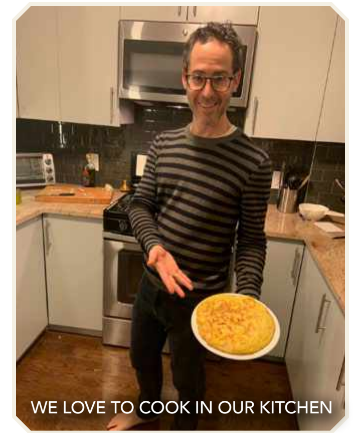
WE LOVE TO COOK IN OUR KITCHEN

Finally, New York City will be such a fun place to grow up. The city is our playground, and we can't wait to bring a child along.