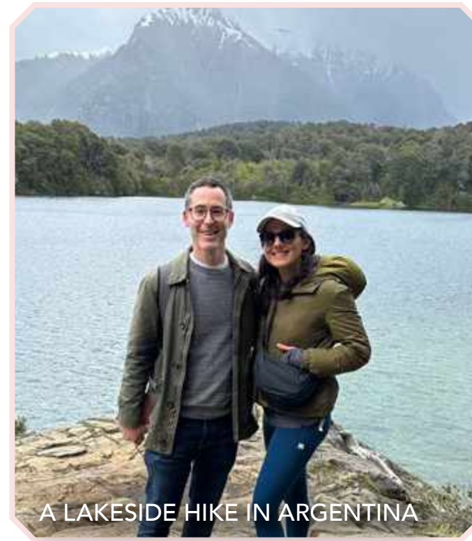
A LAKESIDE HIKE IN ARGENTINA