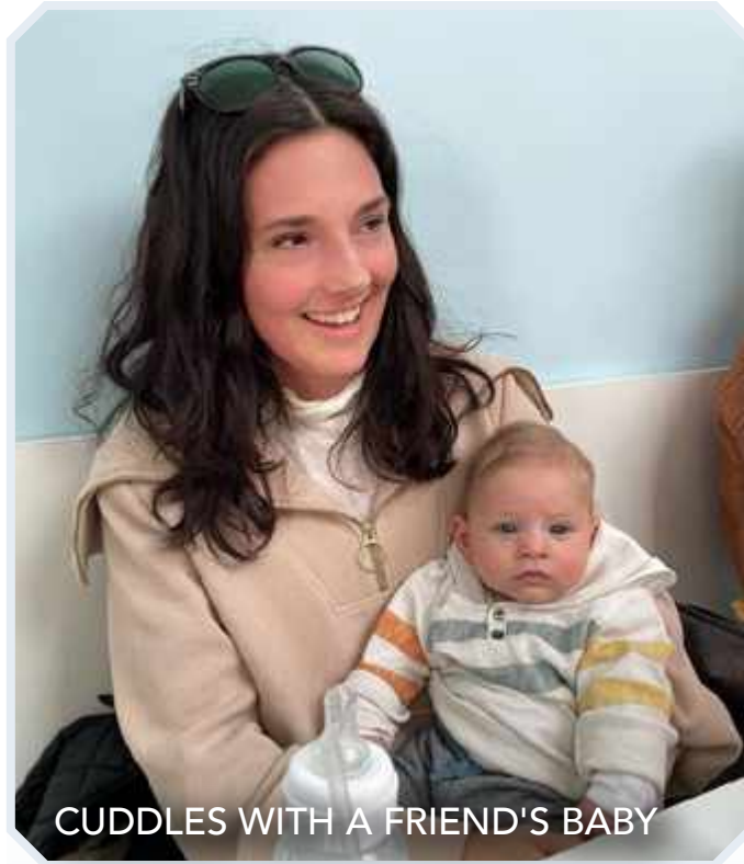
CUDDLES WITH A FRIEND'S BABY

She gives so much to her relationships with friends and family. As a result, we have a large network of friends and family who are eager to support us in raising a child.