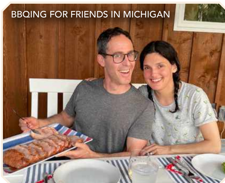
BBQING FOR FRIENDS IN MICHIGAN

We have so many great memories traveling and cooking together and can't wait to share these experiences with a little one!