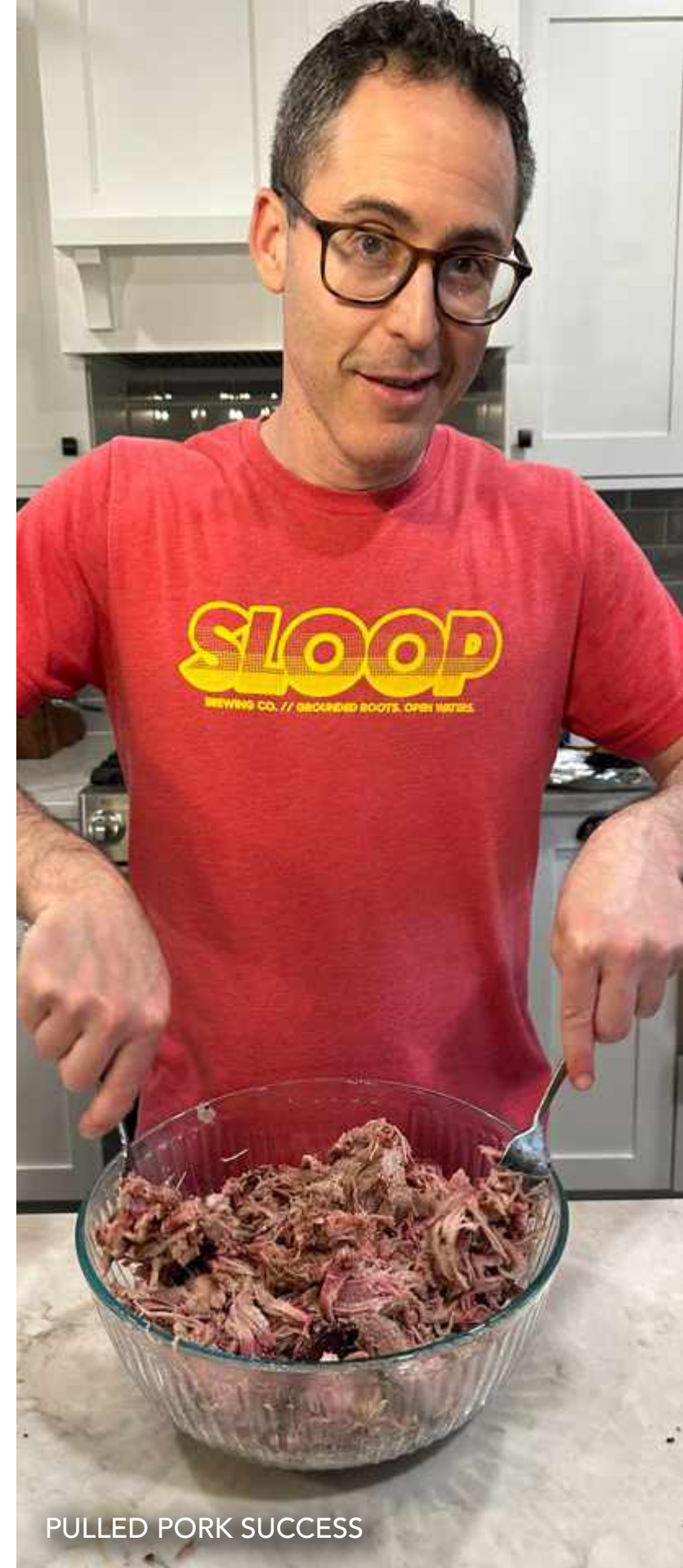
PULLED PORK SUCCESS

EXTRA BEDROOM & PLANT NURSERY... TO BECOME BABY NURSERY