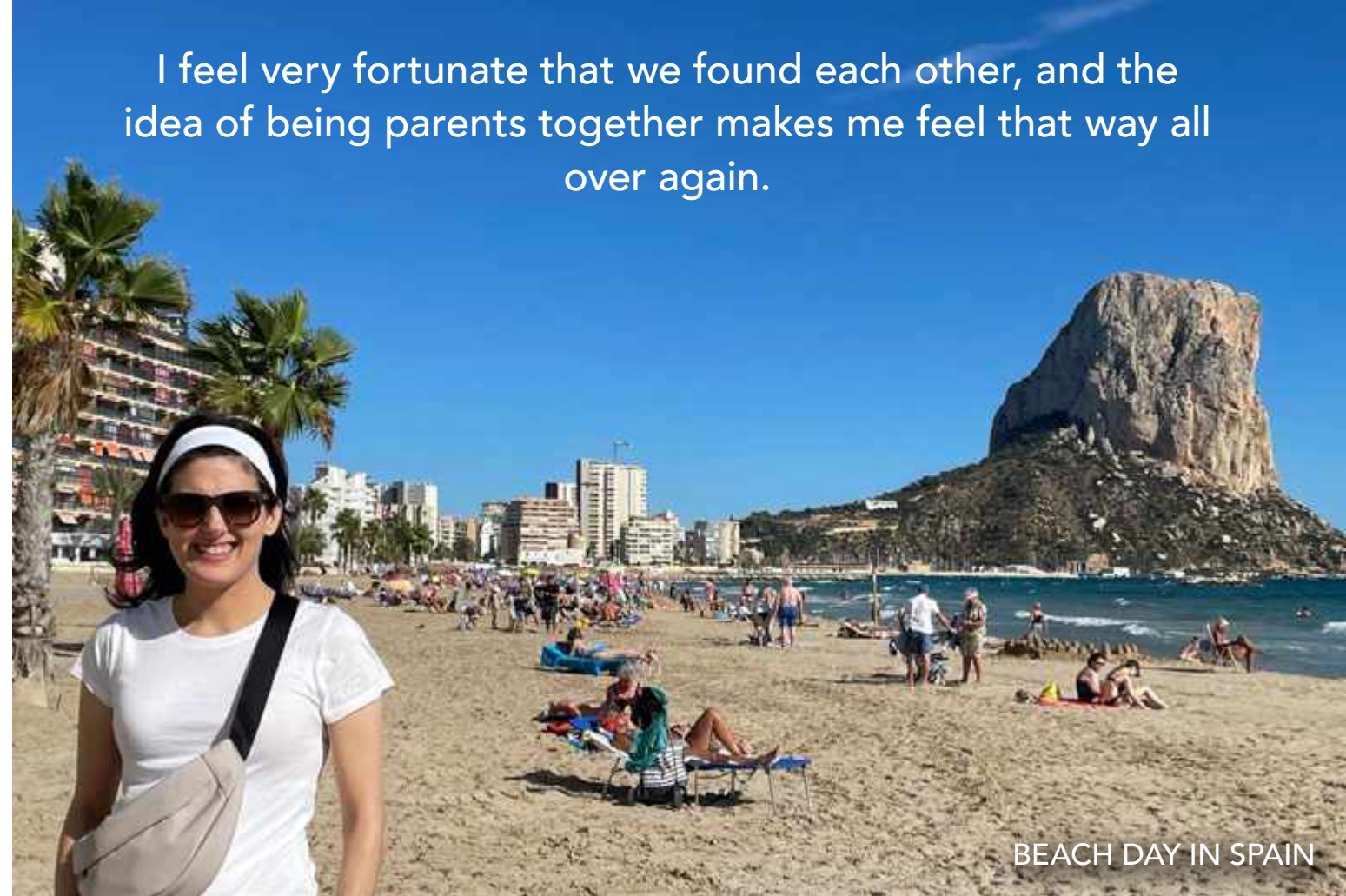
BEACH DAY IN SPAIN