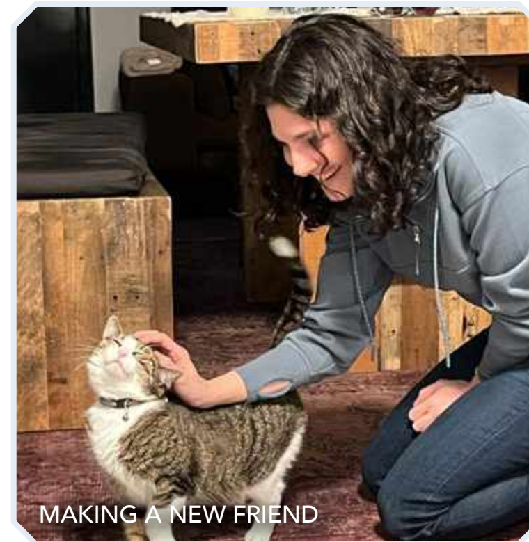
MAKING A NEW FRIEND