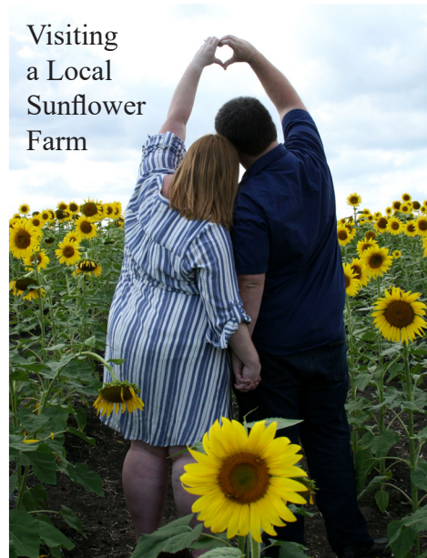
Visiting a Local Sunflower Farm