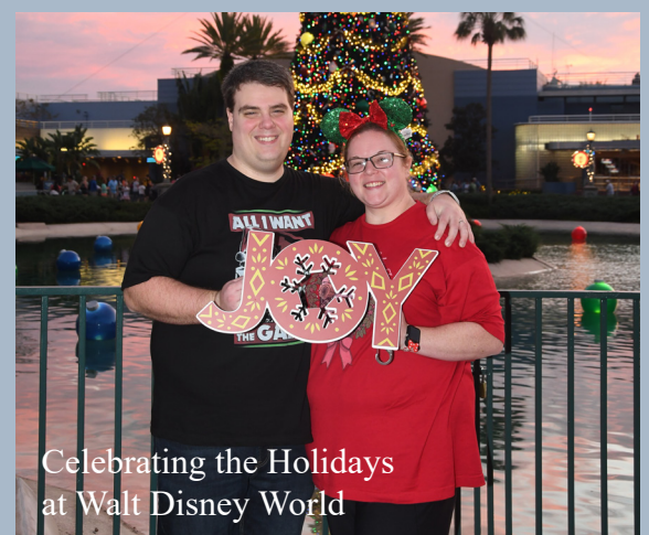
Celebrating the Holidays at Walt Disney World

At home, you can also find us watching movies in our home theater. We often host movie watching or premier parties at our house. We invite our family and friends to come enjoy the latest must-see movie or binge watch the latest Netflix show. We recently hosted a Barbie movie premiere party, where we had everyone dress up like their favorite Barbie and we ate only pink colored foods. Even some of the husbands got in on the fun and came dressed up as "dad bod" Ken.