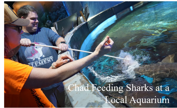
Chad Feeding Sharks at a Local Aquarium