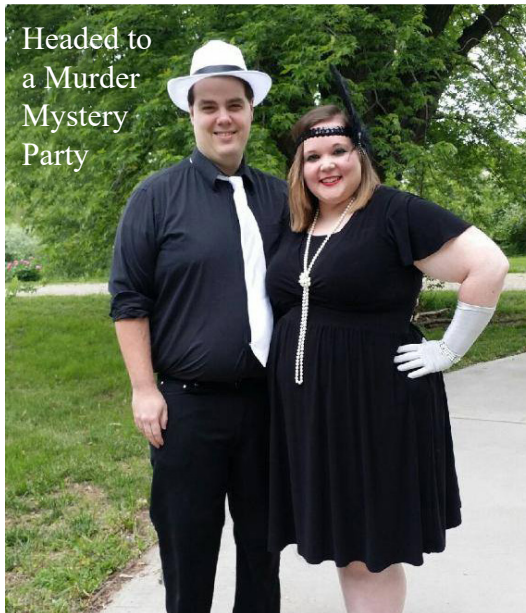
Headed to a Murder Mystery Party