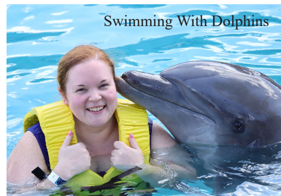
Swimming With Dolphins