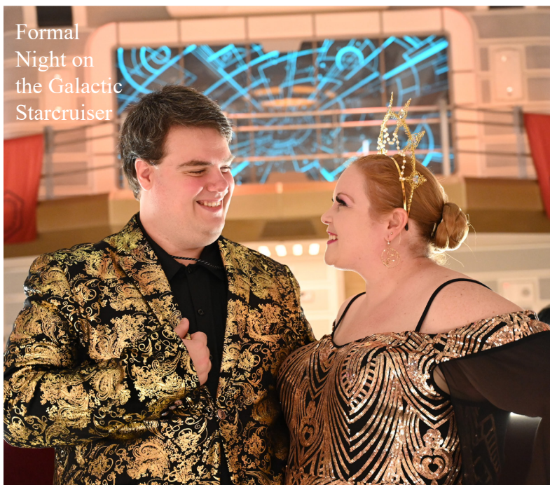
Formal Night on the Galactic Starcruiser