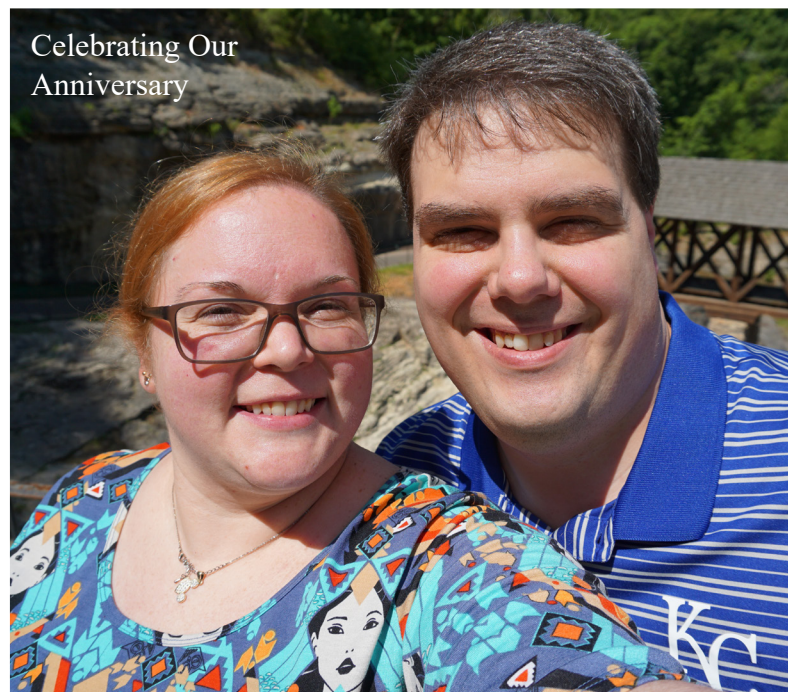
Celebrating Our Anniversary