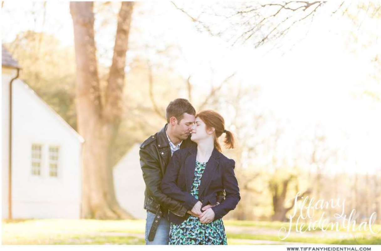
Engagement photo 2014