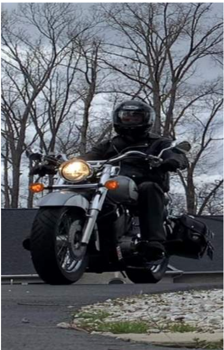
Riding his Honda Shadow motorcycle