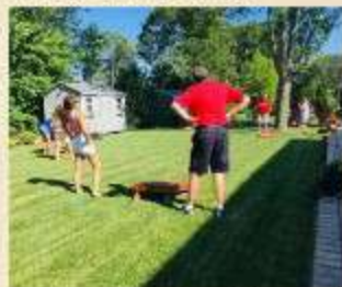
Fourth of July!