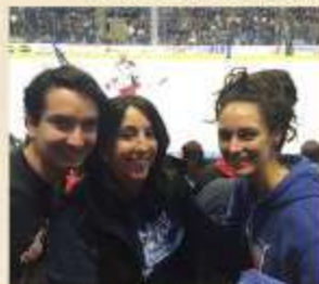
Wolfrack Hockey game