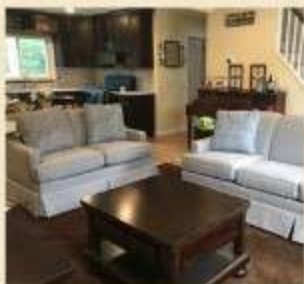
Moving day after our renovation!