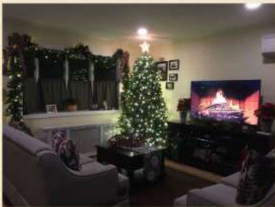
All decorated for Christmas!