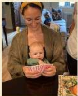
Cozy fall afternoons!