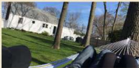
Relaxing in the yard!