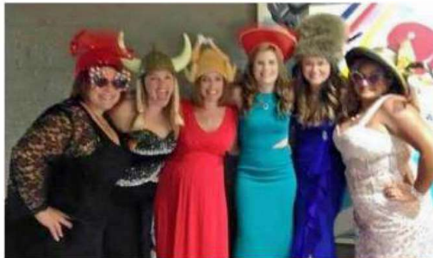
Below: Fun hats at a black tie party with college friends