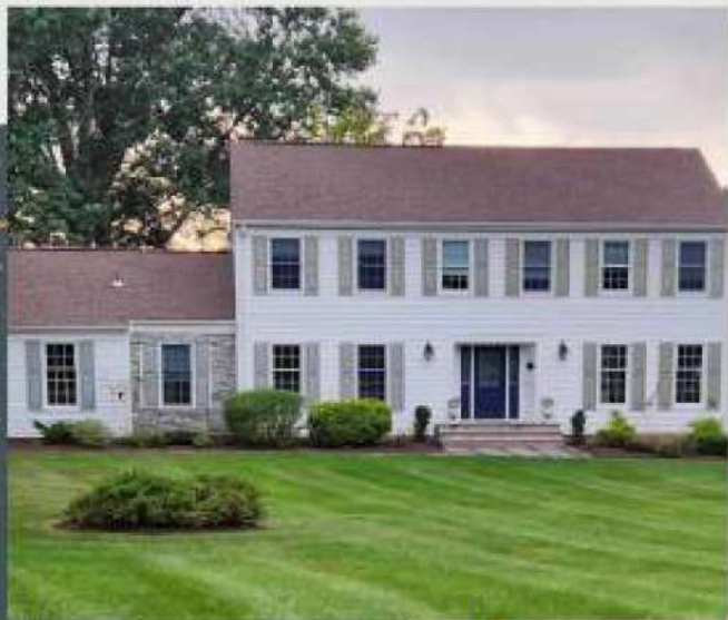
Our home and the surrounding farms