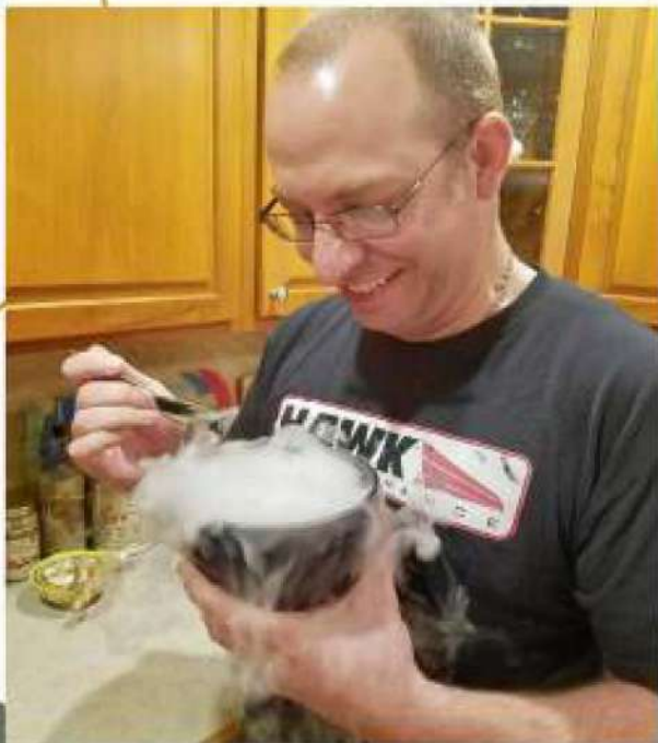
Playing with dry ice