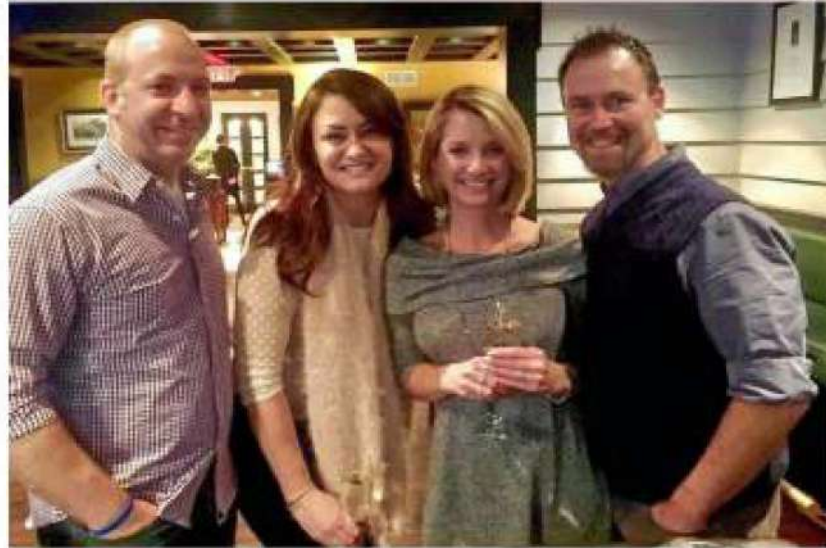
Above: Dinner with good friends