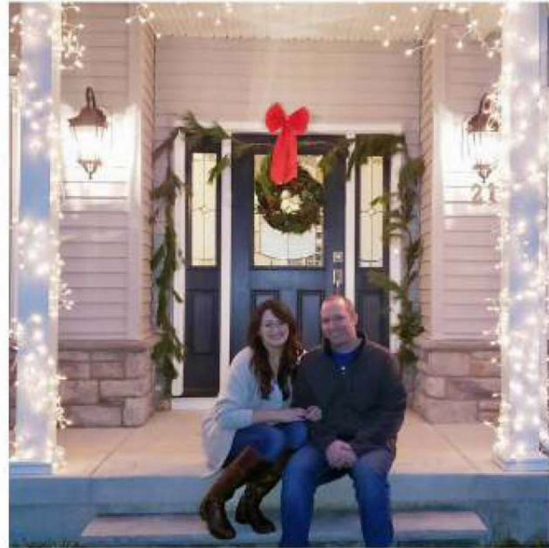
Us in Big Sur (left page), La Jolla, and our home at Christmas