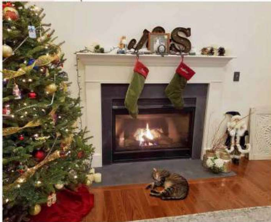
Diego soaking up some warmth by the fire and Christmas tree in our old home