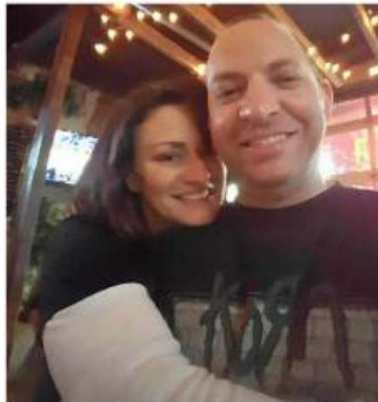
At a concert