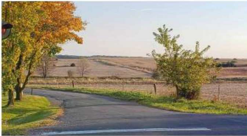
Left: Farmland view from our road Below: Our living room