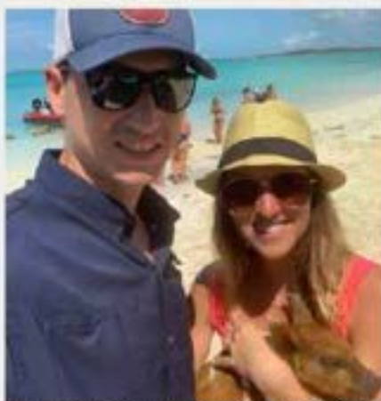
PIG ISLAND IN THE BAHAMAS