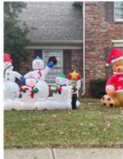
THE INFLATABLES ARE A BIG HIT IN THE NEIGHBORHOOD