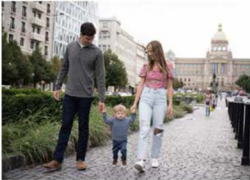
Sight seeing in Prague!