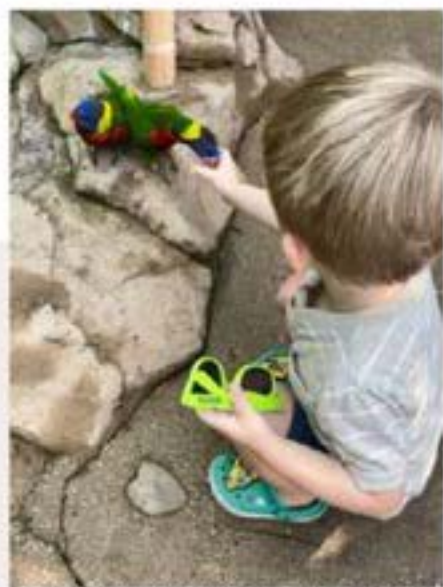
FEEDING LORAKEETS AT THE ZOO