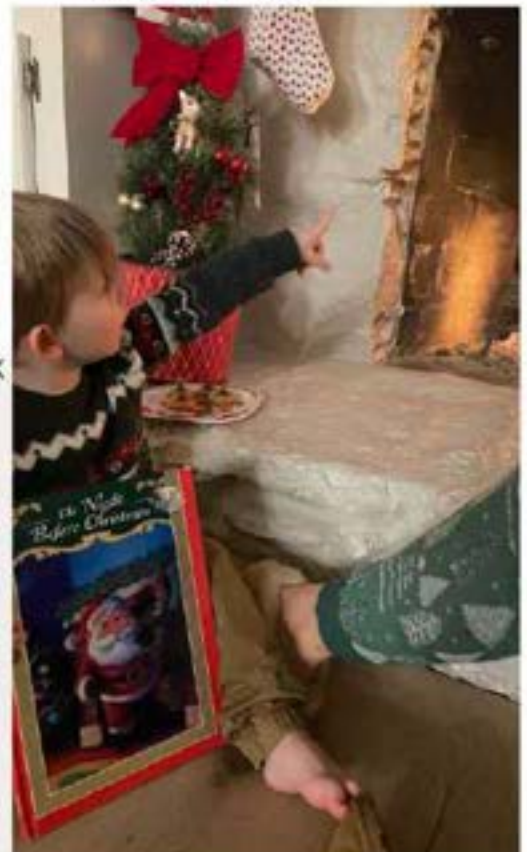
SANTA COMES DOWN THE CHIMNEY