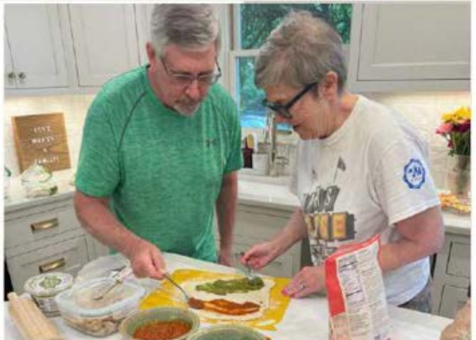
MAKE-YOUR-OWN PIZZA NIGHT WITH NANA AND GRANDBOB