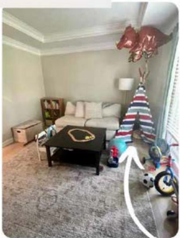
MILO'S FAVORITE HIDE-AND-SEEK SPOT!