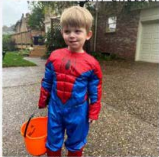
HIS FAVORITE SUPER-HERO