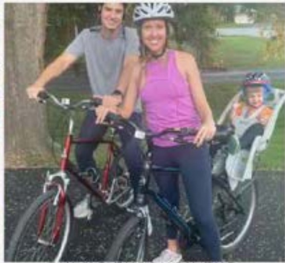
BIKING THROUGH THE NEIGHBORHOOD