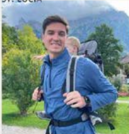
BACKPACKING IN MITTENWALD, GERMANY!