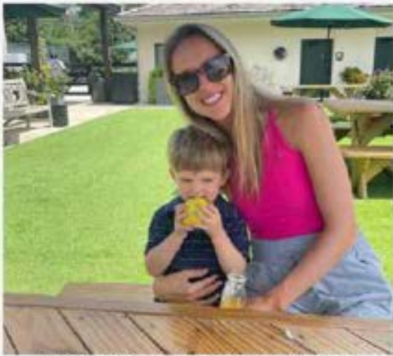
VISITING A LOCAL MARKET