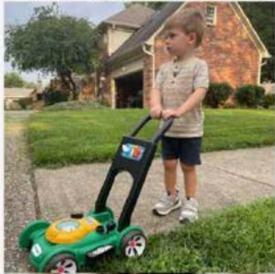
HELPING DADA MOW THE LAWN