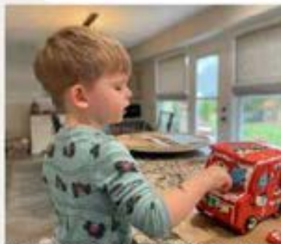
GINGERBREAD FOOD TRUCK