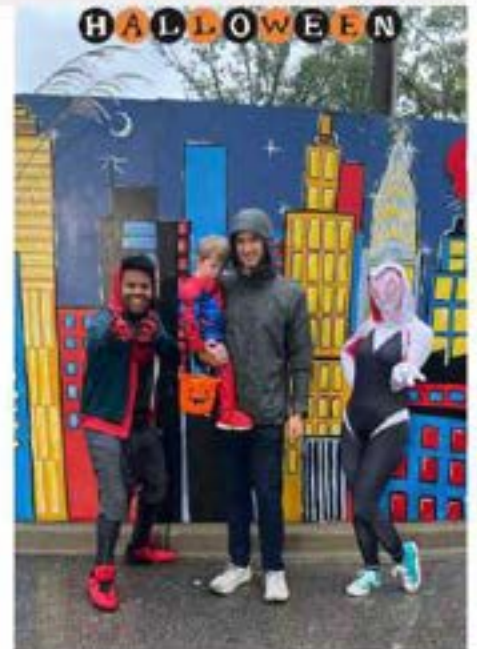
HALLOWEEN FUN WITH SPIDERMAN!