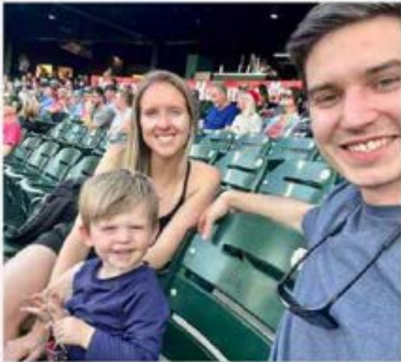
SUPPORTING OUR LOCAL MINOR LEAGUE BASEBALL TEAM