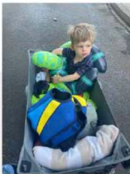
HEADED TO THE POOL