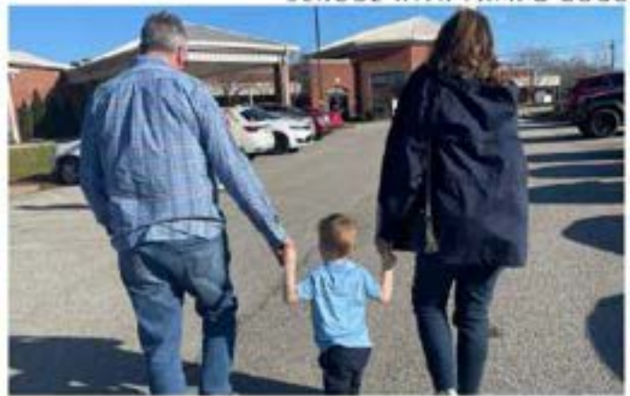
GRANDPARENTS' NIGHT AT SCHOOL WITH PAPA & GOGO