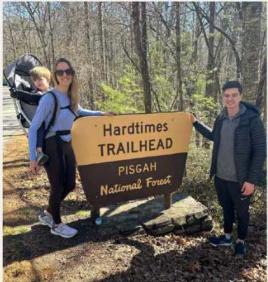
HIKING IN ASHEVILLE, NCI