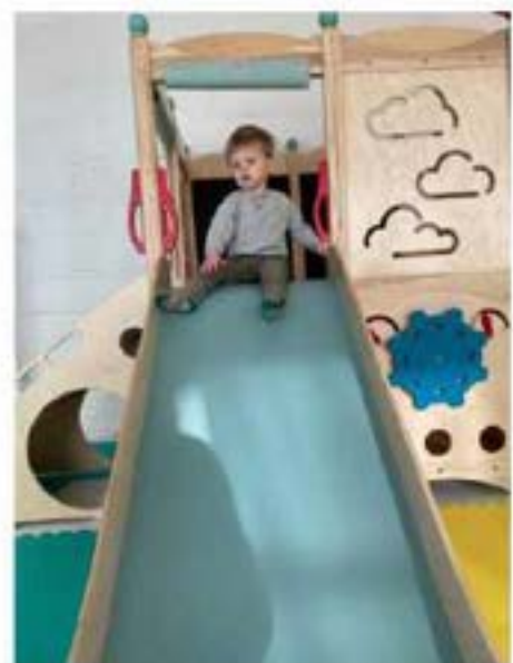
MONTESSORI PLAY CAFE