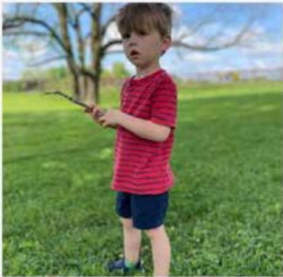
FUN AT THE FARM