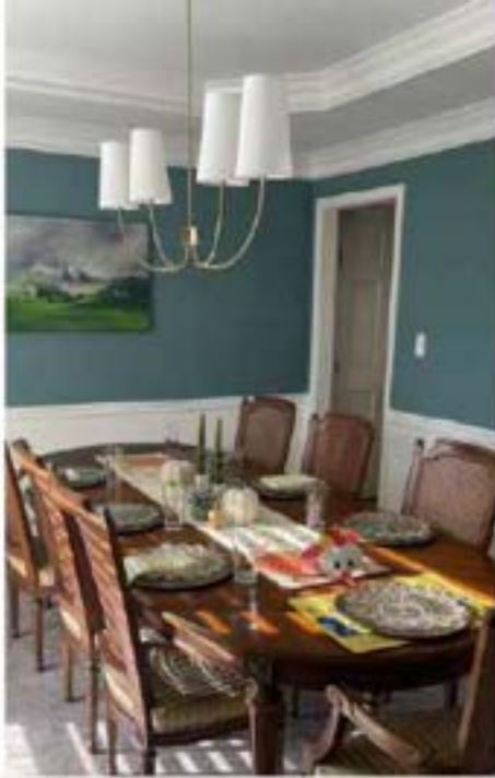
WE LOVE HOSTING FOR THE HOLIDAYS! HERE, THE TABLE IS ALL SET FOR THANKSGIVING