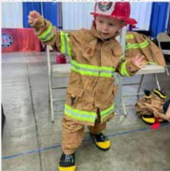
HAVING FUN AT THE STATE FAIR