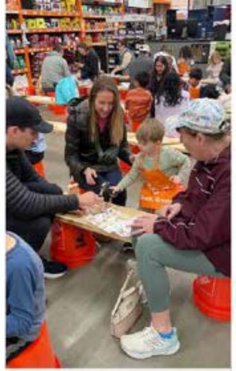
HOME DEPOT'S MONTHLY CRAFT DAY