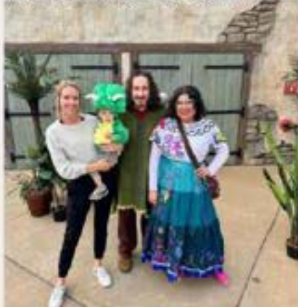
BOO AT THE ZOO WITH MIRABEL AND BRUNO