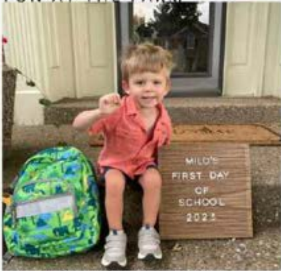
A FAMILY TRADITION!