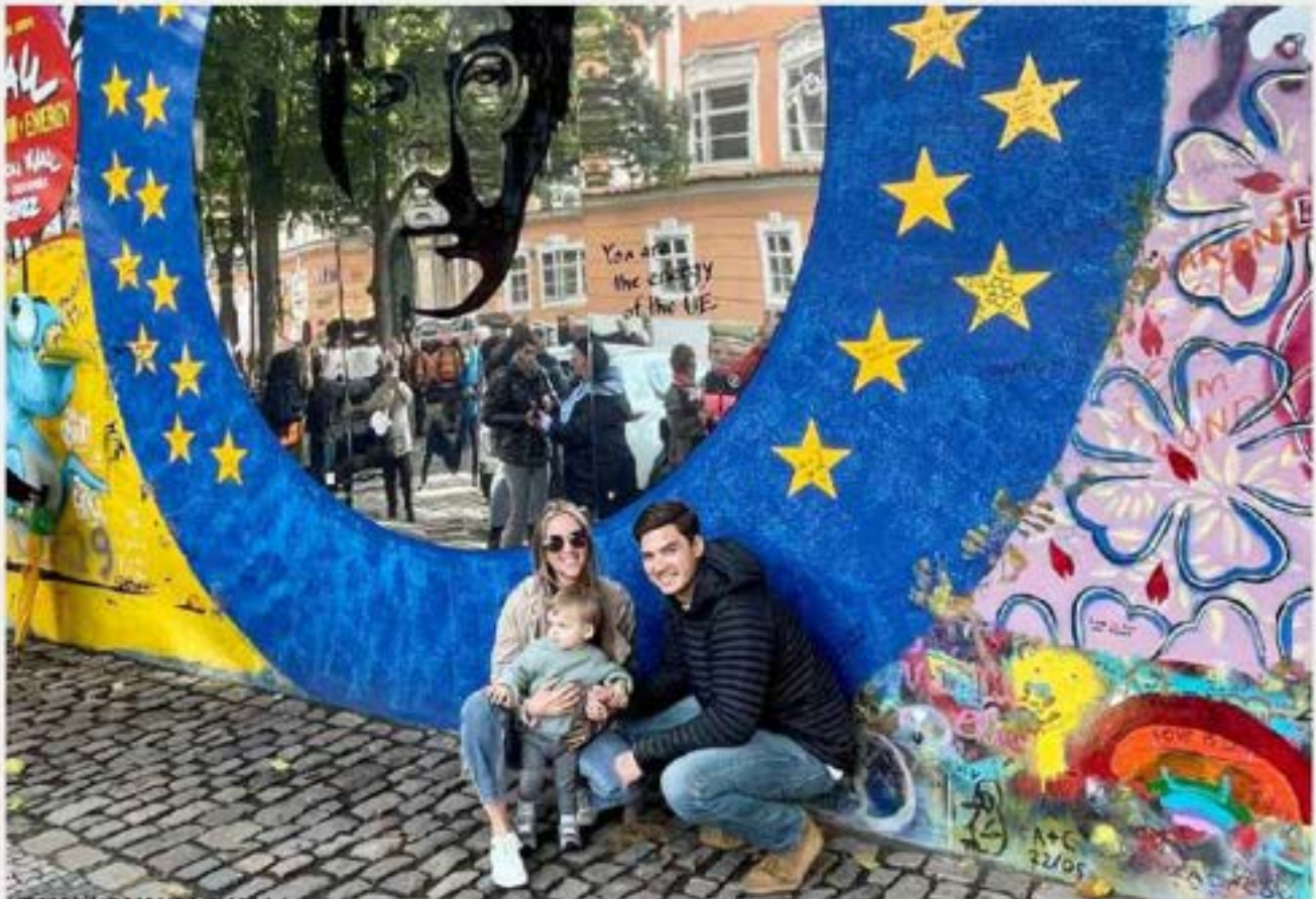
JOHN LENNON WALL