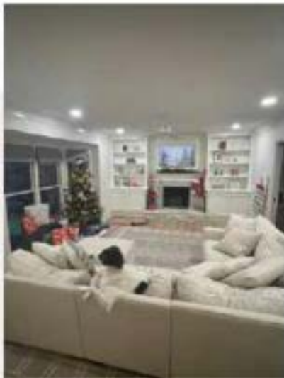
WE LOVE TO DECORATE OUR HOUSE FOR EACH HOLIDAY