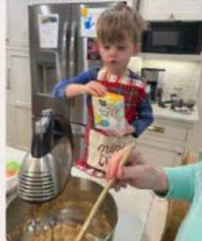
BAKING WITH GRANDMA