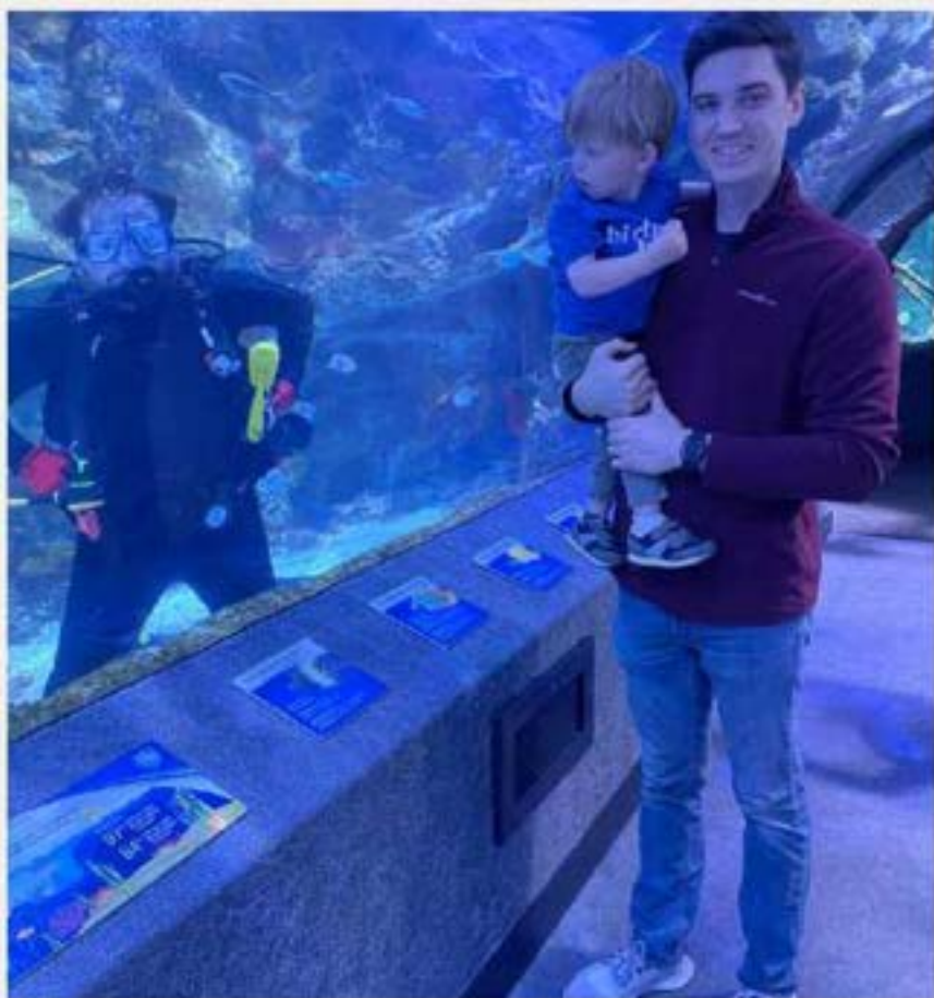
WATCHING A SCUBA DIVER AT NEWPORT AQUARIUM