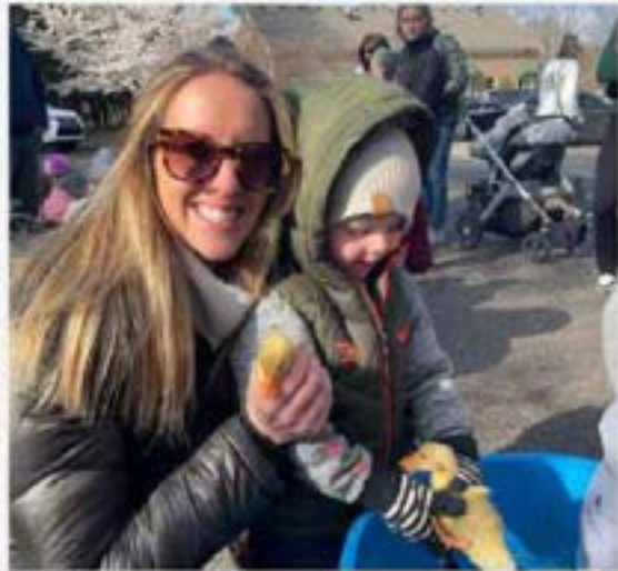
HOLDING BABY DUCKS AT THE NEIGHBORHOOD EASTER PARTY