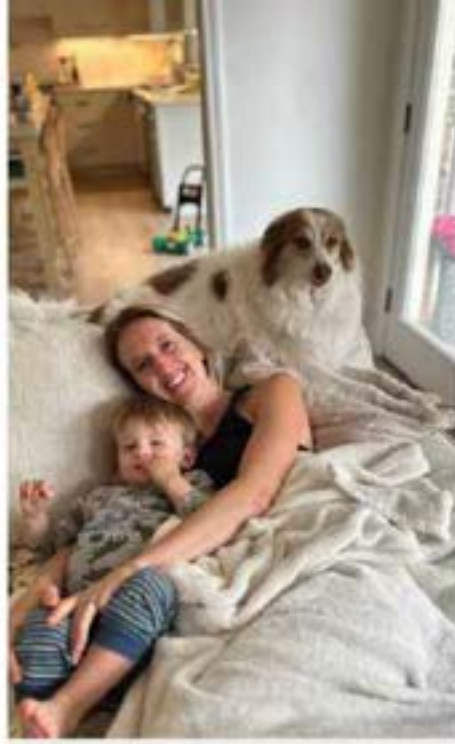
FAMILY MOVIE NIGHT