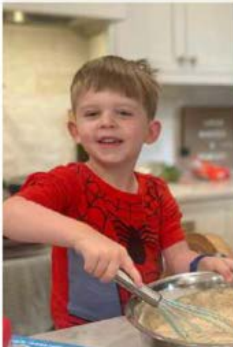
PROUD PANCAKE MAKER!

Our weekend rituals kick off with pizza and popcorn movie nights on Fridays followed by pancake Saturdays. We find so much joy in these simple yet meaningful traditions! They create lasting memories and strengthen the bonds that hold us together.