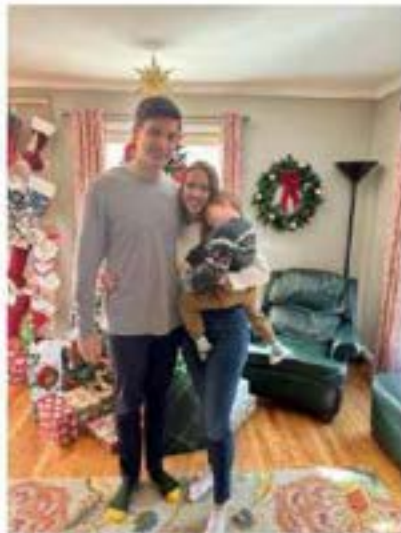
CHRISTMAS WITH NANA AND GRANDBOB