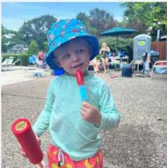
POPSICLES AT THE NEIGHBORHOOD POOL. A SUMMER STAPLE!