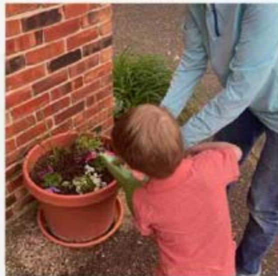
HELPING OUR NEIGHBOR WATER HER PLANTS