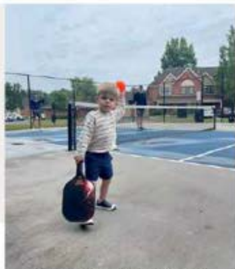
ALL-STAR PICKLE BALLER

Within our community, there are many parks and playgrounds for picnics and play. We frequently go to the Zoo, Science Center, local library, and local farms. We think it is very important for children to explore, learn and socialize, and we love being able to join in on these experiences.