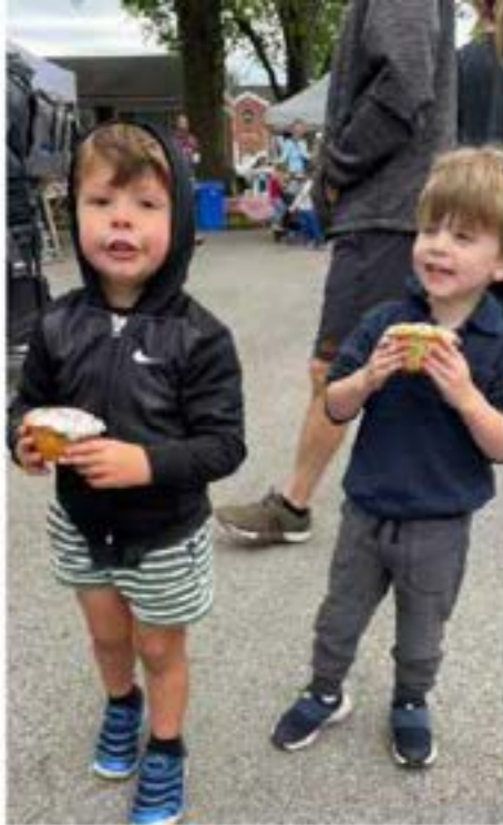
FARMER'S MARKET SATURDAYS TO GET OUR SPRINKLE MUFFINS!