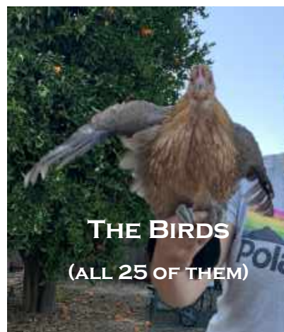
THE BIRDS (ALL 25 OF THEM)