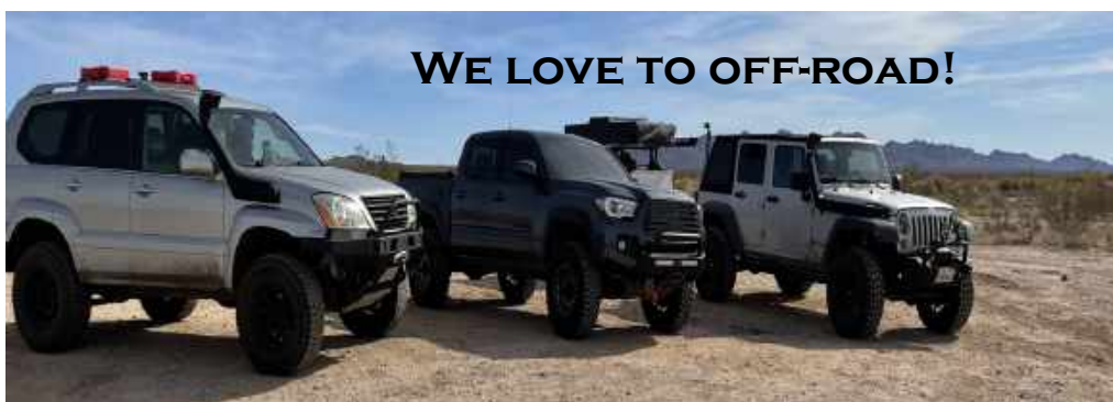
WE LOVE TO OFF-ROAD!