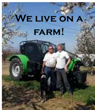
WE LIVE ON A FARM!