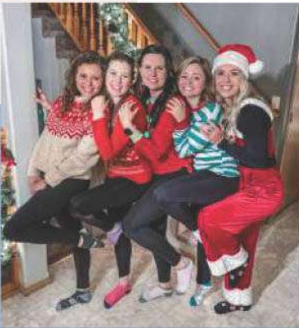
Girls annual Christmas party