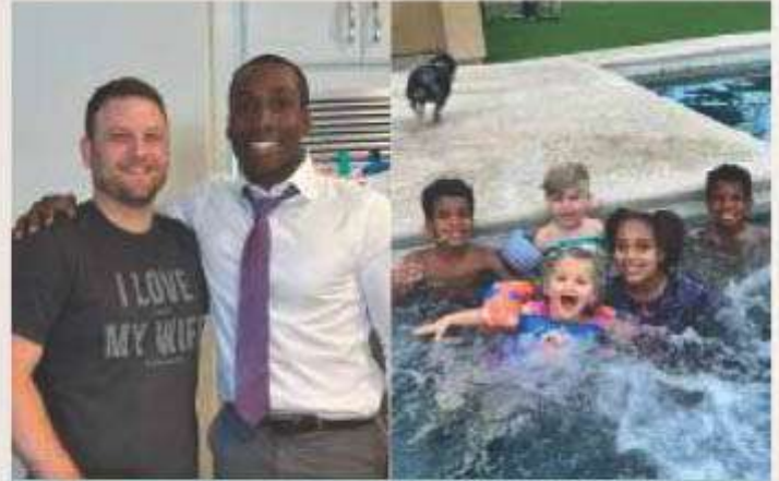
Friends- another source of our happiness

All the cousins know we are hoping to adopt and cannot wait for a new baby to love on.