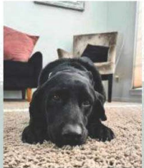
Our dog Skye is a low energy cuddle bug, she's amazing with the kids and we love her so much!