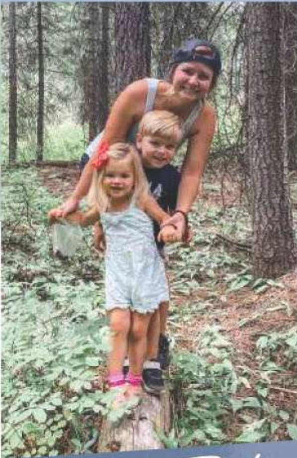
Walking in the woods with the kids