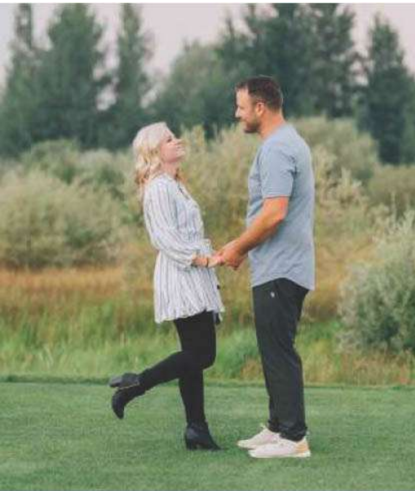
We love to take the family boat out whenever possible