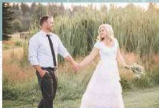
Ten year anniversary celebration