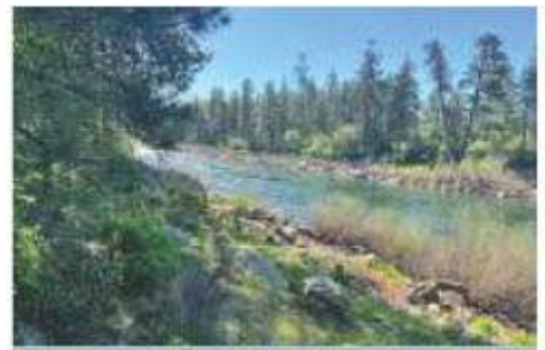
Nearby river with trails that we love to explore