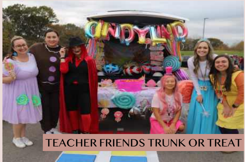
TEACHER FRIENDS TRUNK OR TREAT