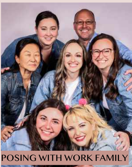
POSING WITH WORK FAMILY