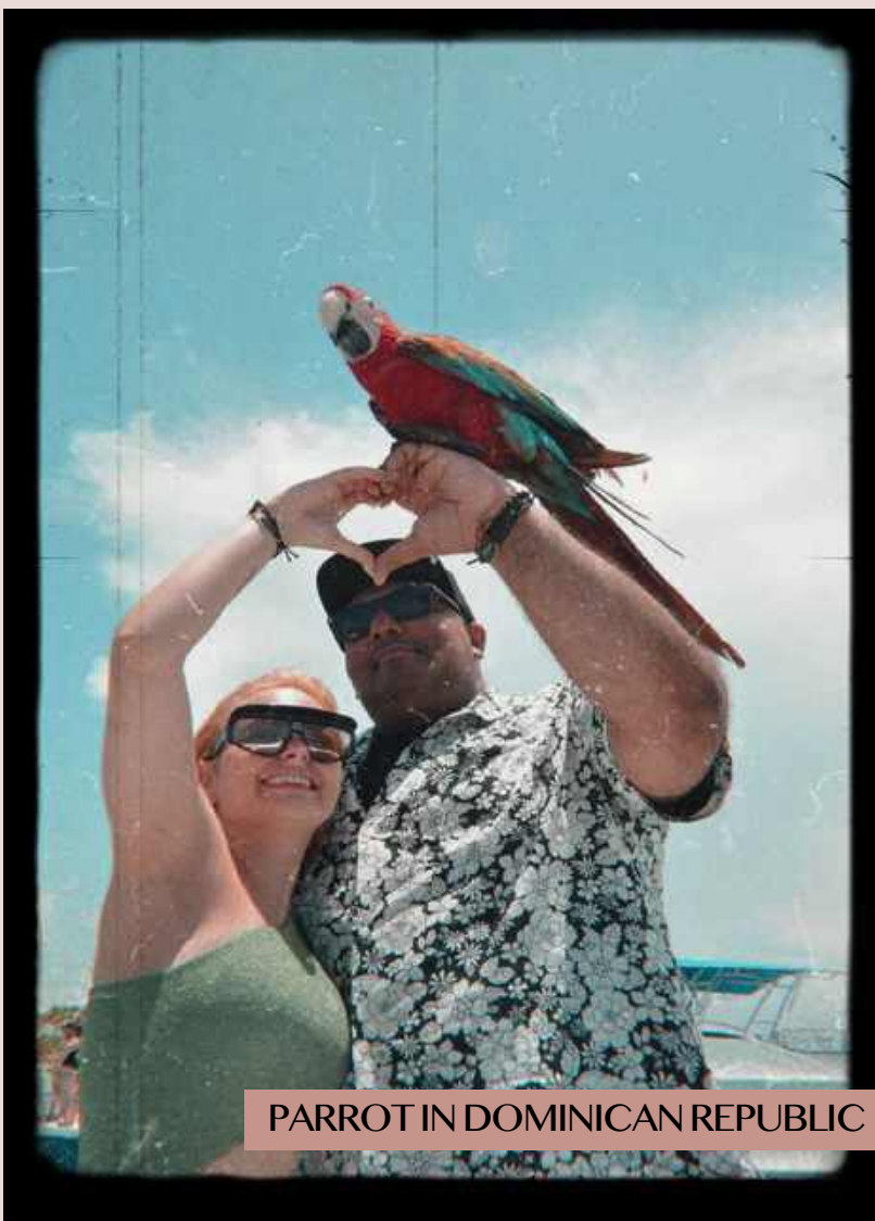
PARROT IN DOMINICAN REPUBLIC

We also love attending sporting events, working out together, and experimenting with new recipes. Whether it's dancing in the living room, building snowmen, or cheering for our favorite team, we can't wait to share these moments of love and laughter with a child.