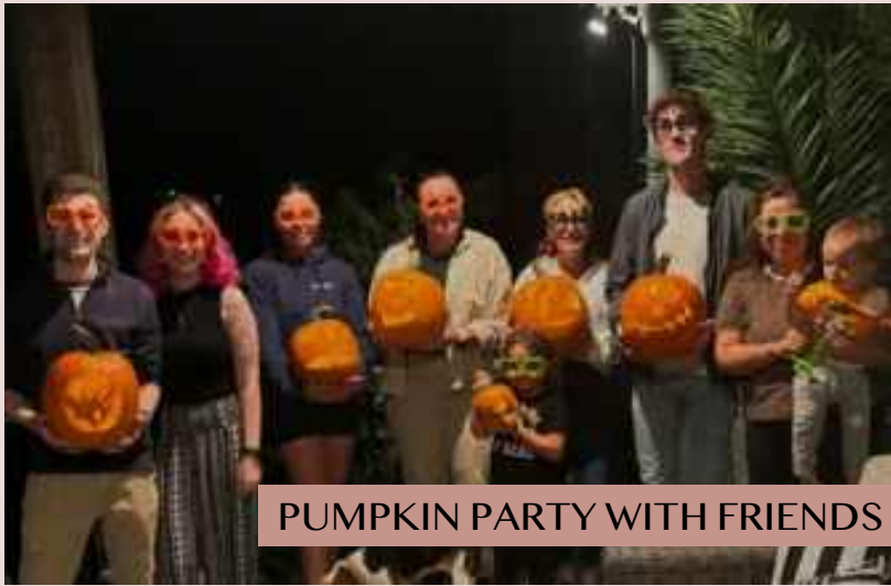
PUMPKIN PARTY WITH FRIENDS