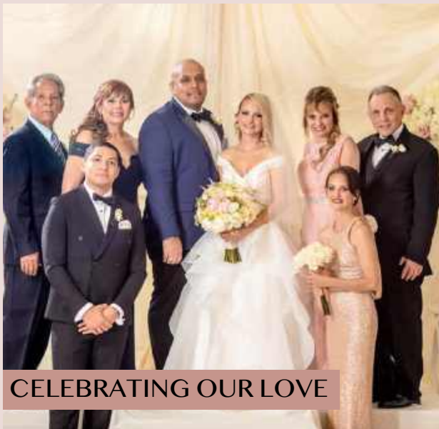
CELEBRATING OUR LOVE