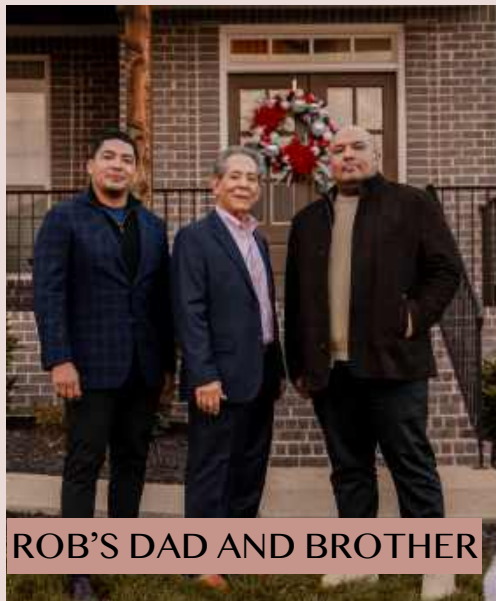
ROB'S DAD AND BROTHER