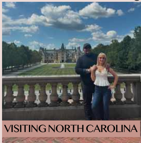
VISITING NORTH CAROLINA

WEEKEND MORNINGS.. You'll catch us working out together