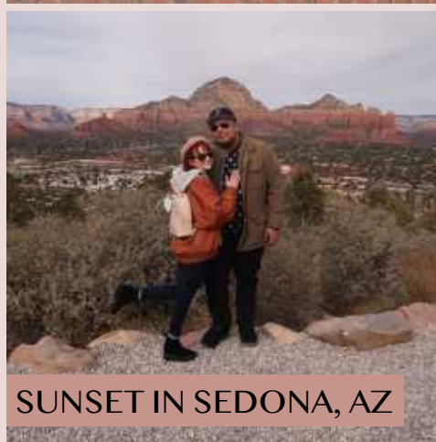
SUNSET IN SEDONA, AZ