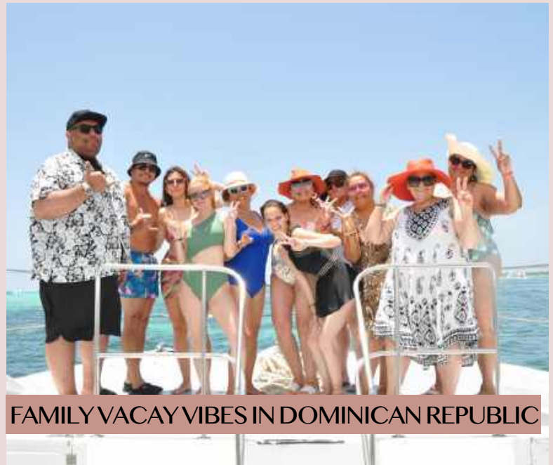
FAMILY VACAY VIBES IN DOMINICAN REPUBLIC