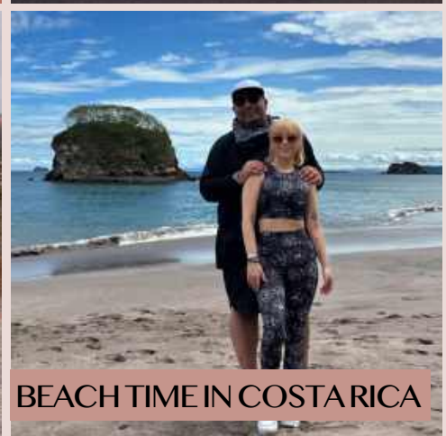
BEACH TIME IN COSTARICA