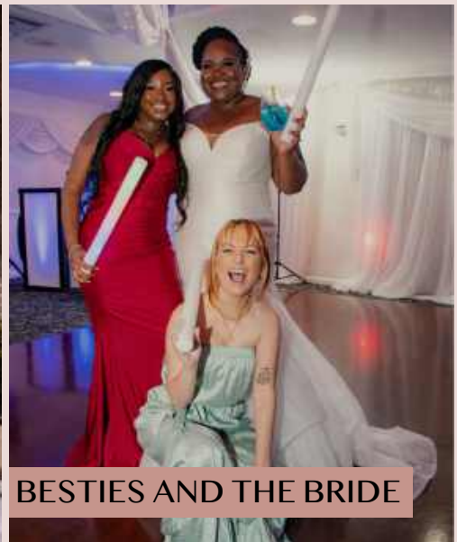
BESTIES AND THE BRIDE