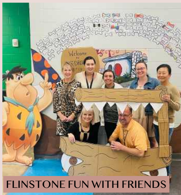
FLINSTONE FUN WITH FRIENDS