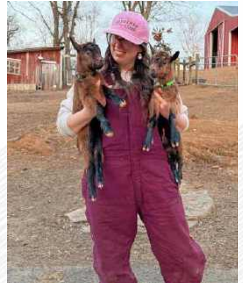
Our two bottle baby goats that lived in our house for 2 weeks while we nursed them back to health