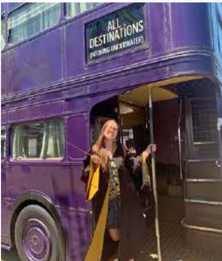
Enjoying a fun day at Harry Potter World