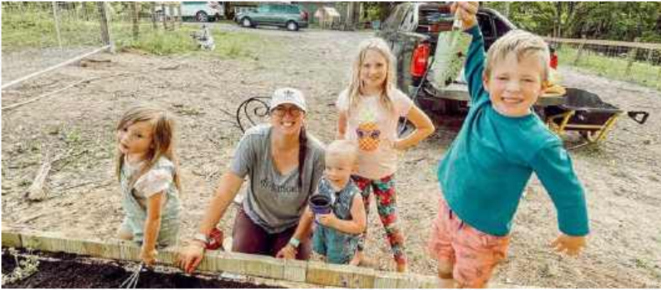
Gardening fun with some of my nieces & nephews