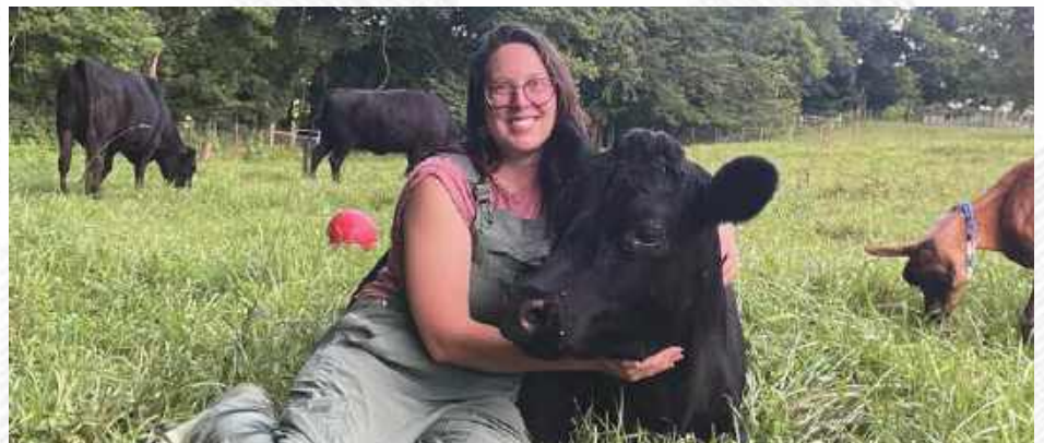
I love hanging out in the pasture with all our animals, especially our sweet Madeline