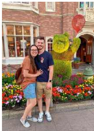
Enjoying the day at Disney World