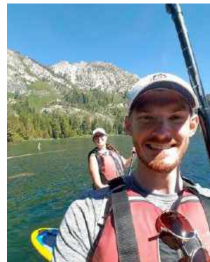
Paddleboarding on Lake Tahoe