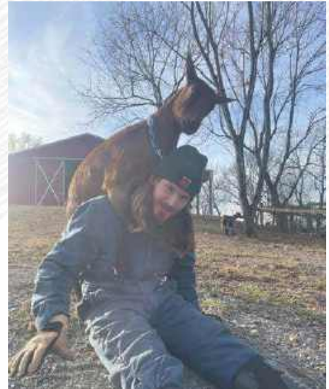
Farm life is a full time job but we love being able to hangout with our animals