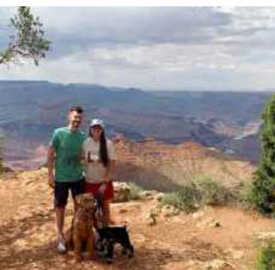
Visiting the Grand Canyon