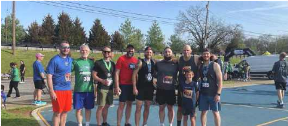
Snapshot of the running group after a 5k