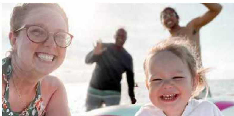
Hanging out at the beach on Dauphin Island with our family