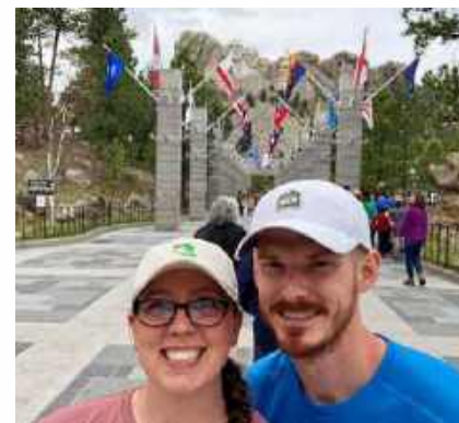
Visiting Mount Rushmore