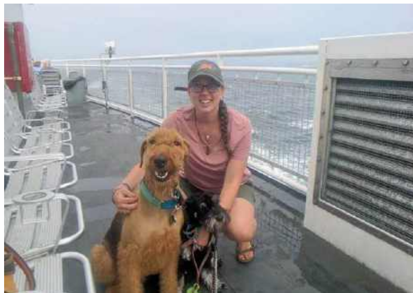
Taking the ferry to Martha's Vineyard