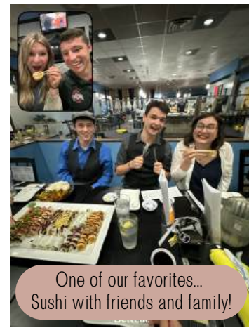
One of our favorites... Sushi with friends and family!