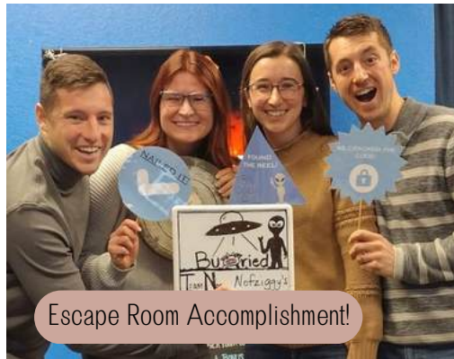
Escape Room Accomplishment!