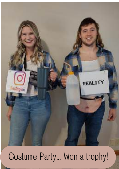
Costume Party... Won a trophy!