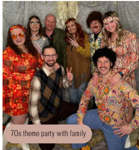
70s theme party with family