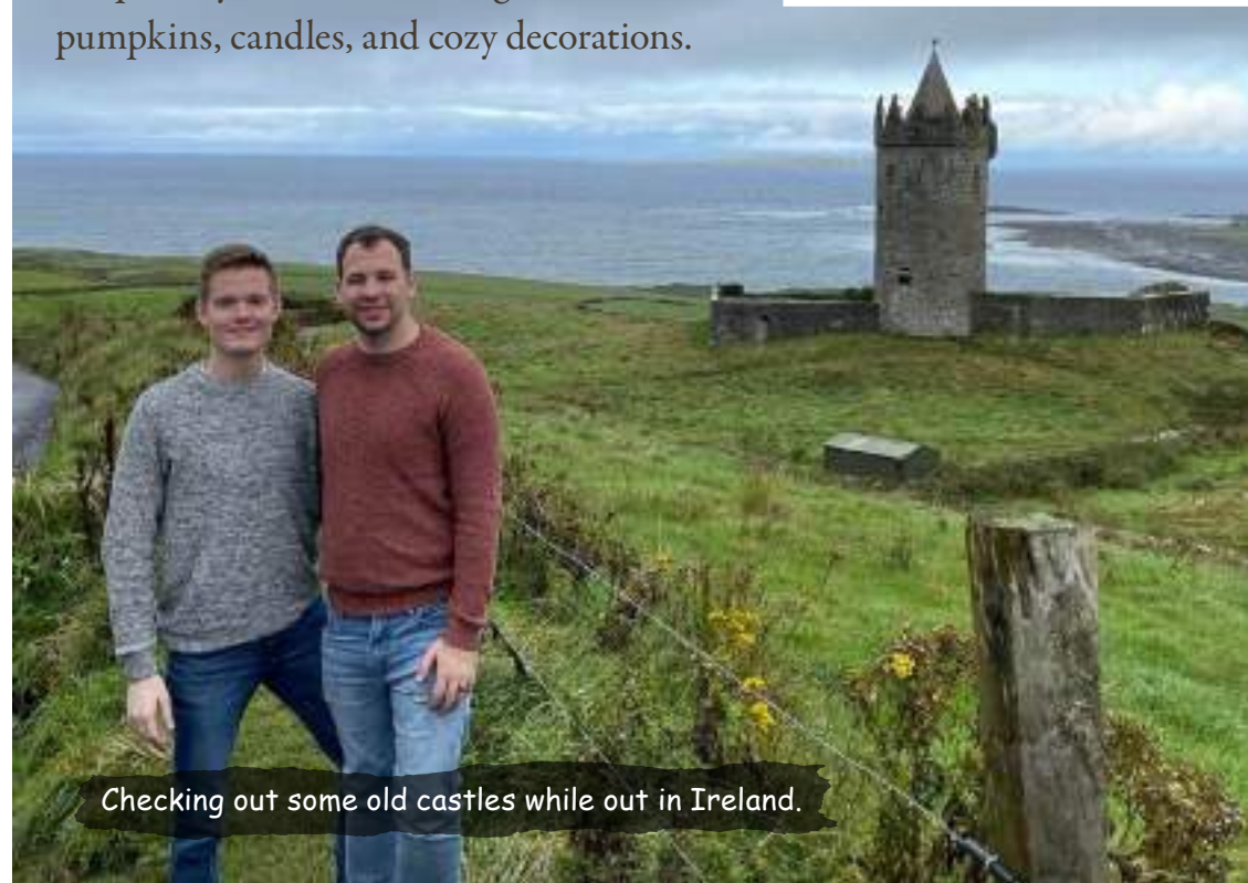
Checking out some old castles while out in Ireland.