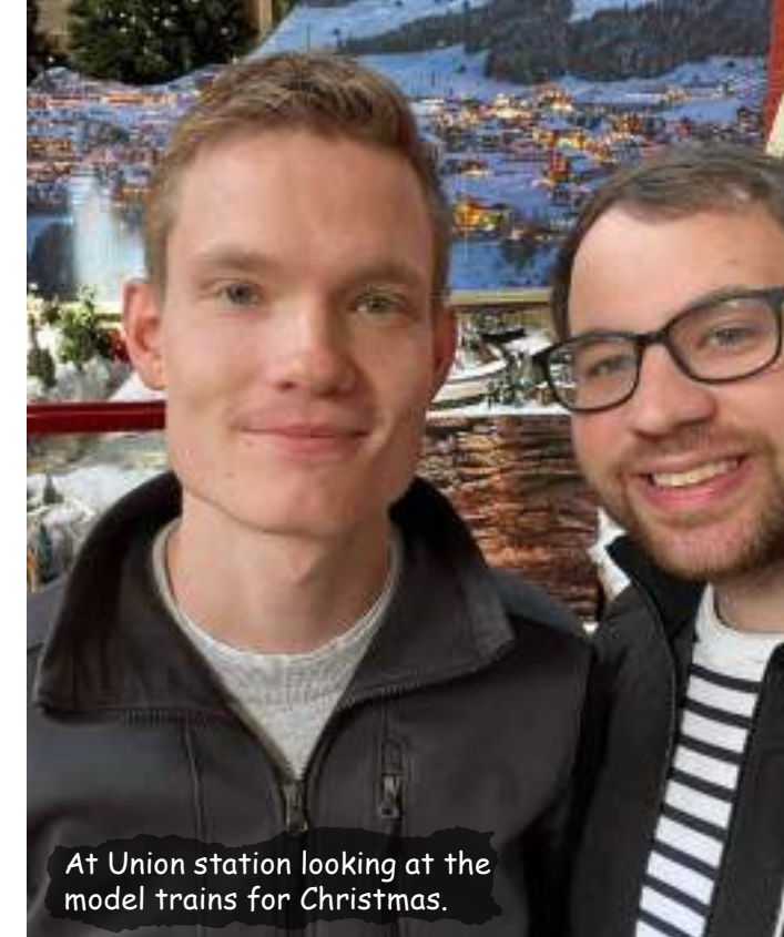
At Union station looking at the model trains for Christmas.

As a gay couple, we've always known that having biological children wasn't in the cards for us. Since the beginning, we've talked about adoption as the path we wanted to take.