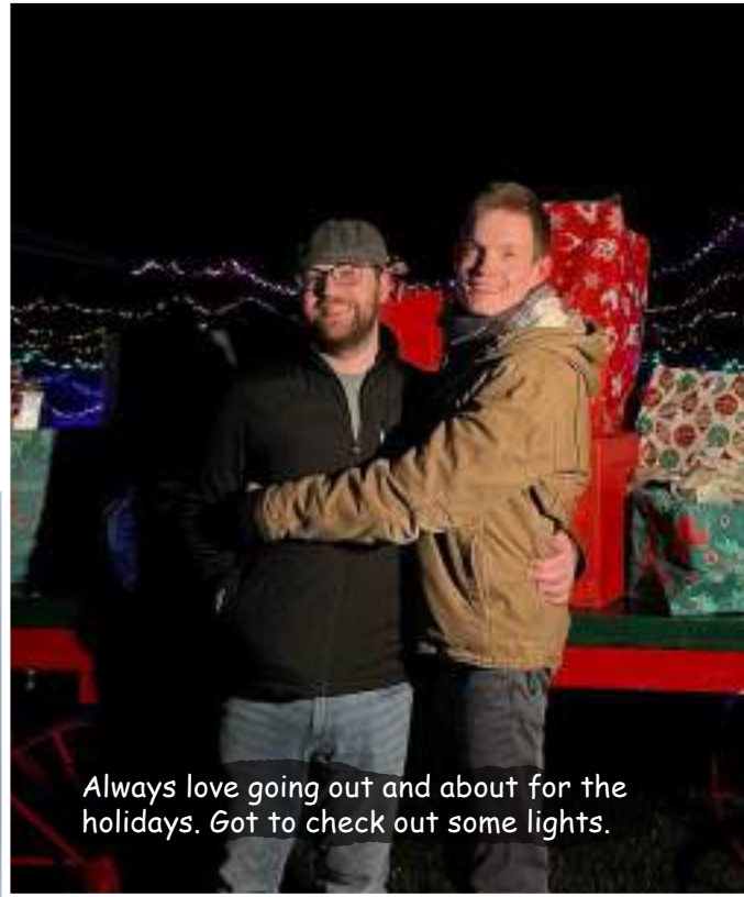
Always love going out and about for the holidays. Got to check out some lights.

Closer to home, we love hosting. Thanksgiving and Christmas are especially big in our household, with both sides of the family coming together for food, games, and lots of laughter. Decorating the house is one of our favorite shared rituals – especially in fall, when we go all out with pumpkins, candles, and cozy decorations.