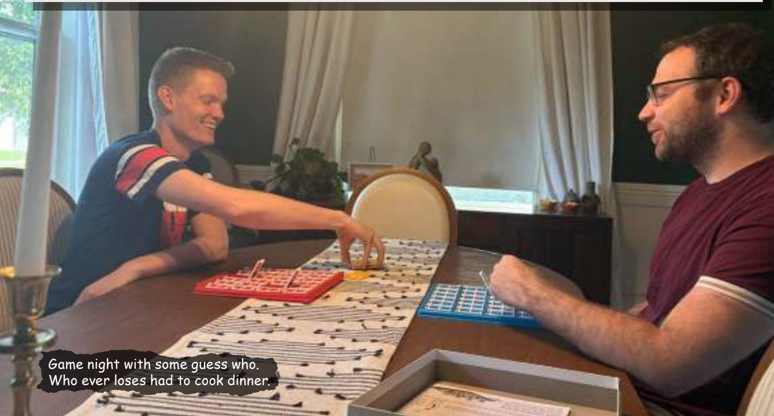
Game night with some guess who. Who ever loses had to cook dinner.

Our community offers so much – great schools, parks, libraries, and family-friendly events throughout the year. It's the kind of place where kids can thrive and feel safe. We are very lucky to live here and can't wait to share our home and community with a kiddo.