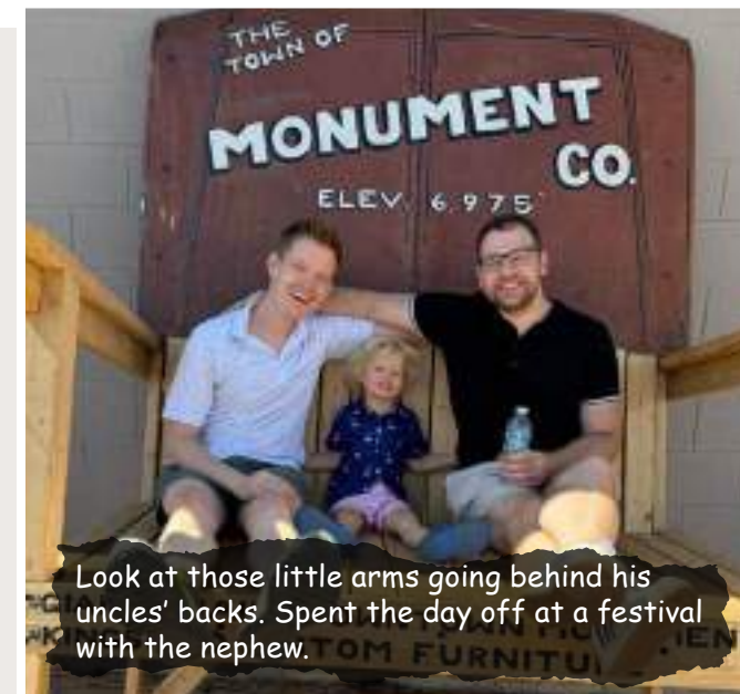
Look at those little arms going behind his uncles' backs. Spent the day off at a festival with the nephew.

Our families are both excited and fully supportive of our decision to adopt. They've already begun dreaming about the roles they'll play: grandparents planning sleepovers, aunts and uncles talking about holiday traditions and "borrowing" the kiddos for a visit to the zoo, and cousins eager for a new playmate.