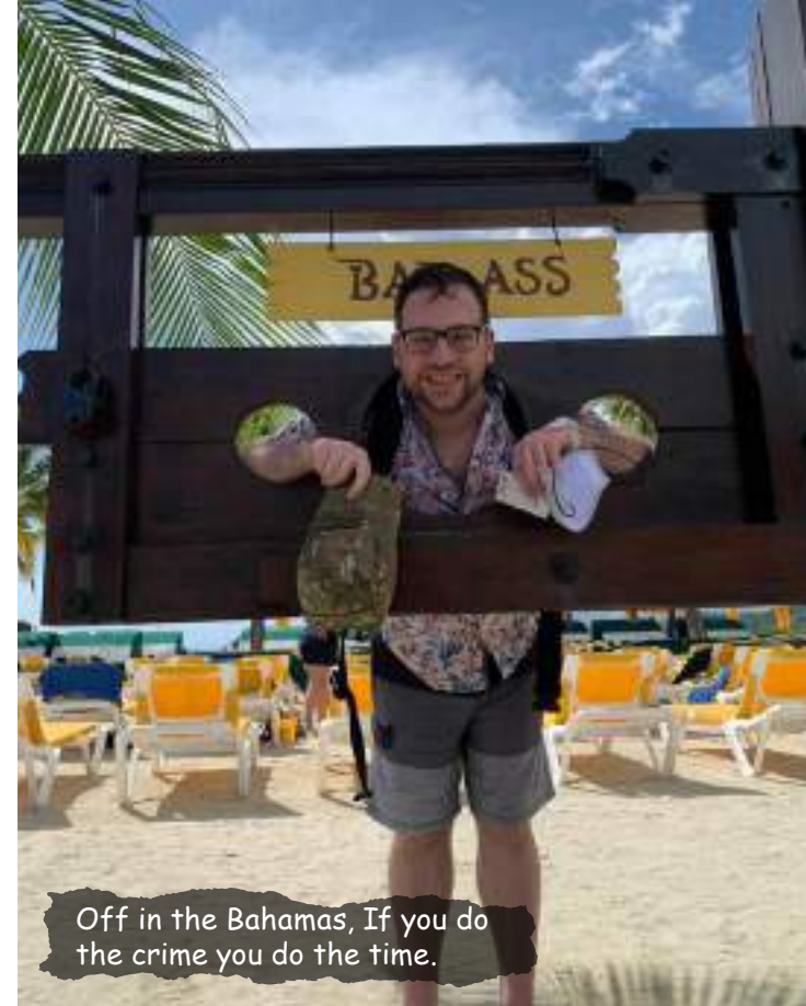
Off in the Bahamas, If you do the crime you do the time.