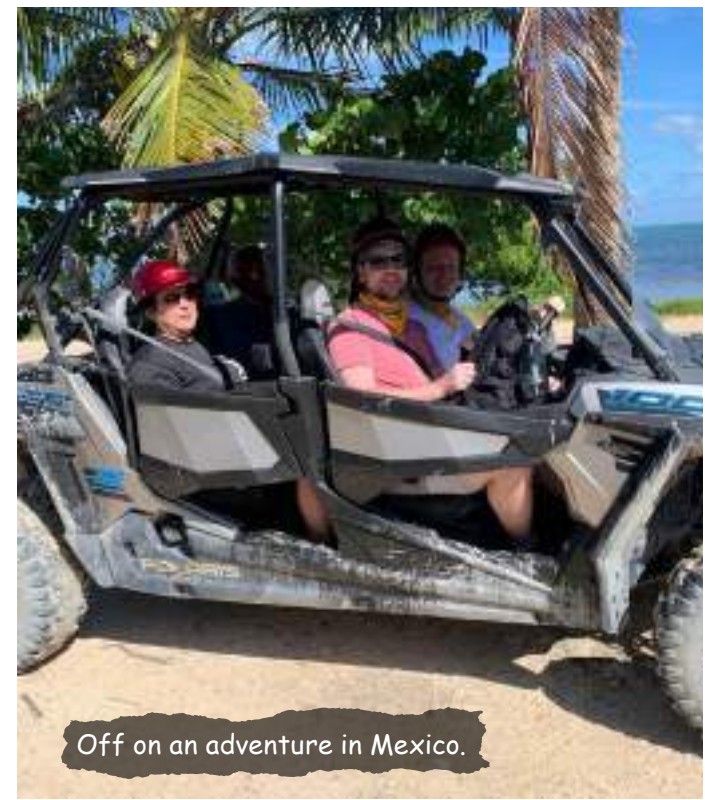
Off on an adventure in Mexico.