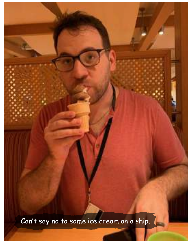
Can't say no to some ice cream on a ship.