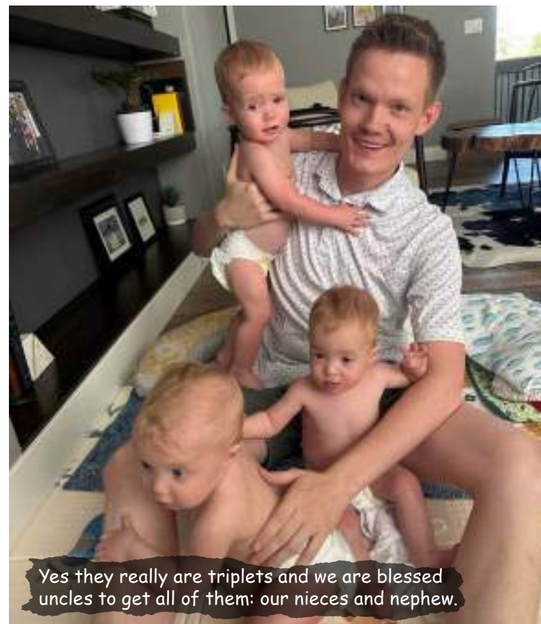
Yes they really are triplets and we are blessed uncles to get all of them: our nieces and nephew.

Whether we're gathered around the dinner table, hosting, or playing board games, there's always love, laughter, and a deep sense of belonging.