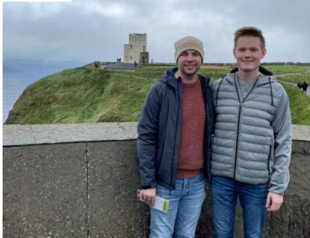
At the Cliff of Mohr in Ireland, honest so beautiful there.