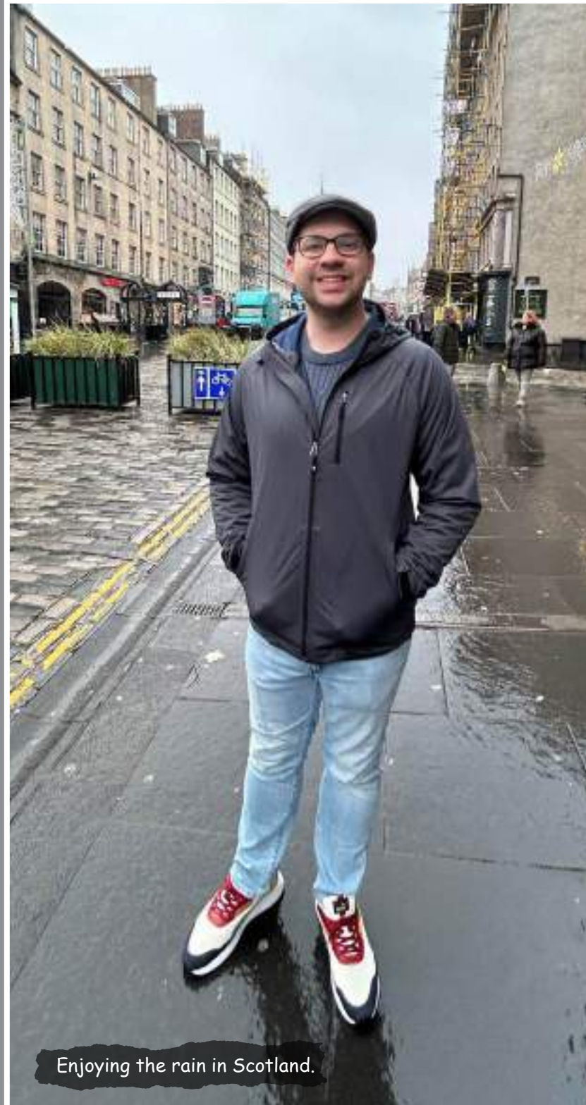
Enjoying the rain in Scotland.

In high school, I discovered a love for computers after randomly signing up for a programming class. I enjoyed it so much that I decided to pursue this career path in college. I now work in the healthcare technology sector for the government. I also served in the military as a jet mechanic for several years, including two deployments, before finishing my contract.