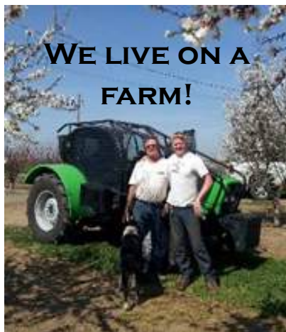
WE LIVE ON A FARM!