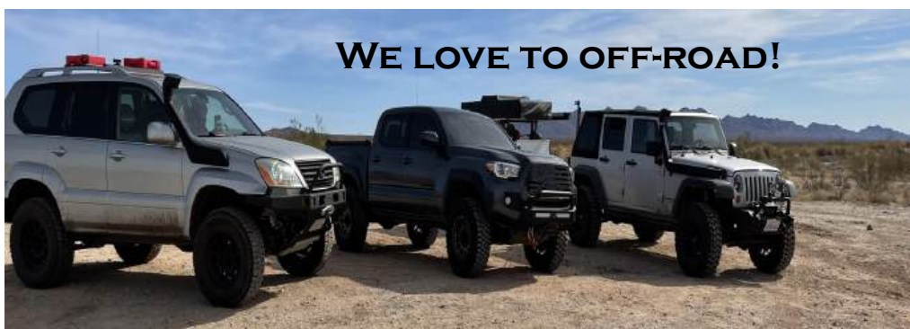
WE LOVE TO OFF-ROAD!