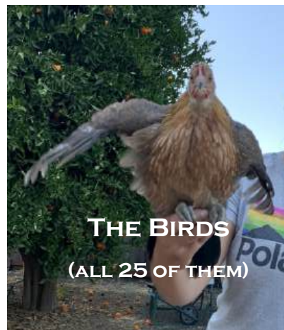
THE BIRDS (ALL 25 OF THEM)