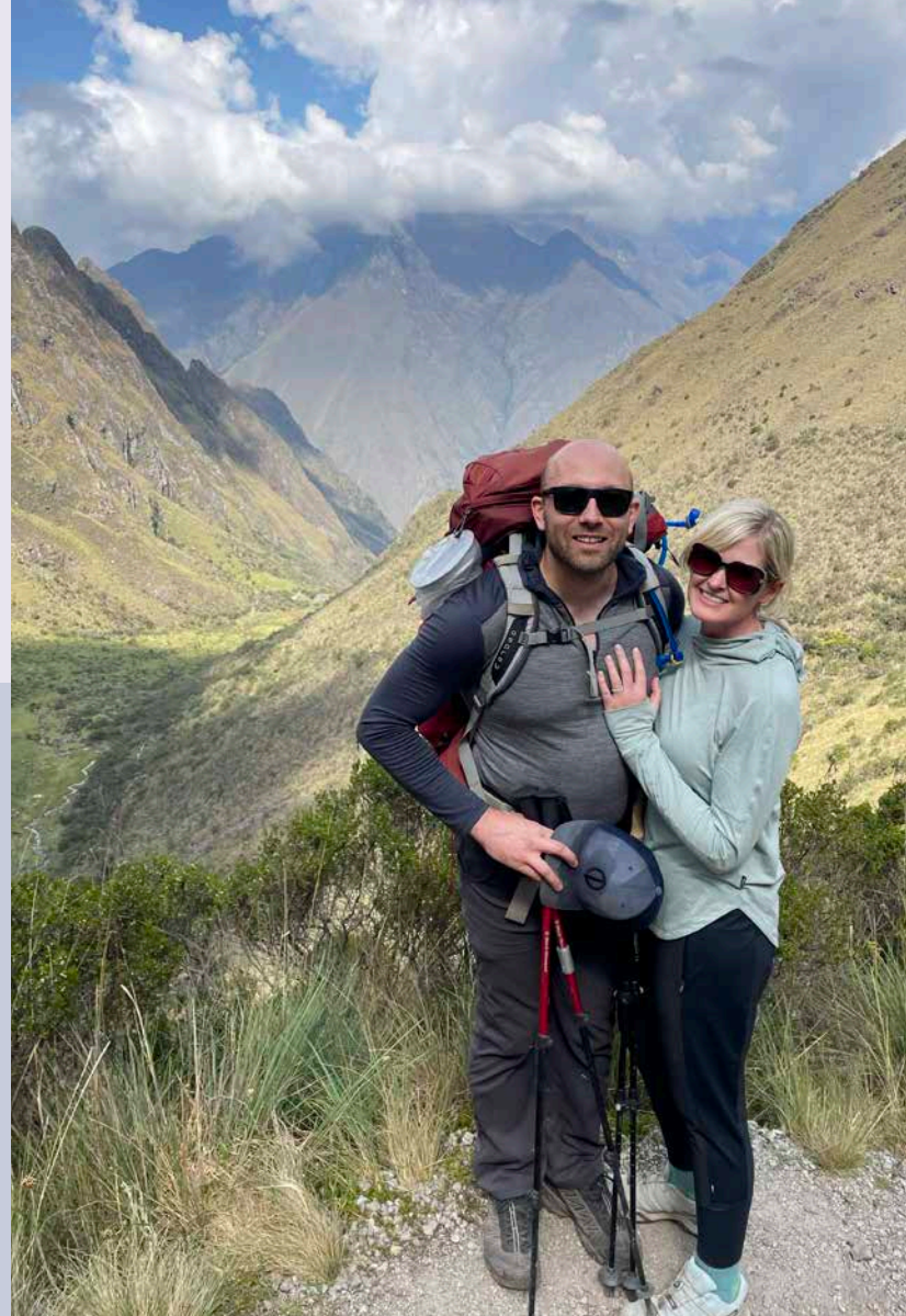
Inca Trail in Peru