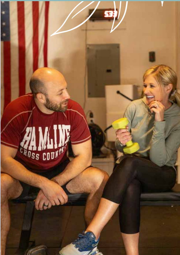
Working out together in our home gym