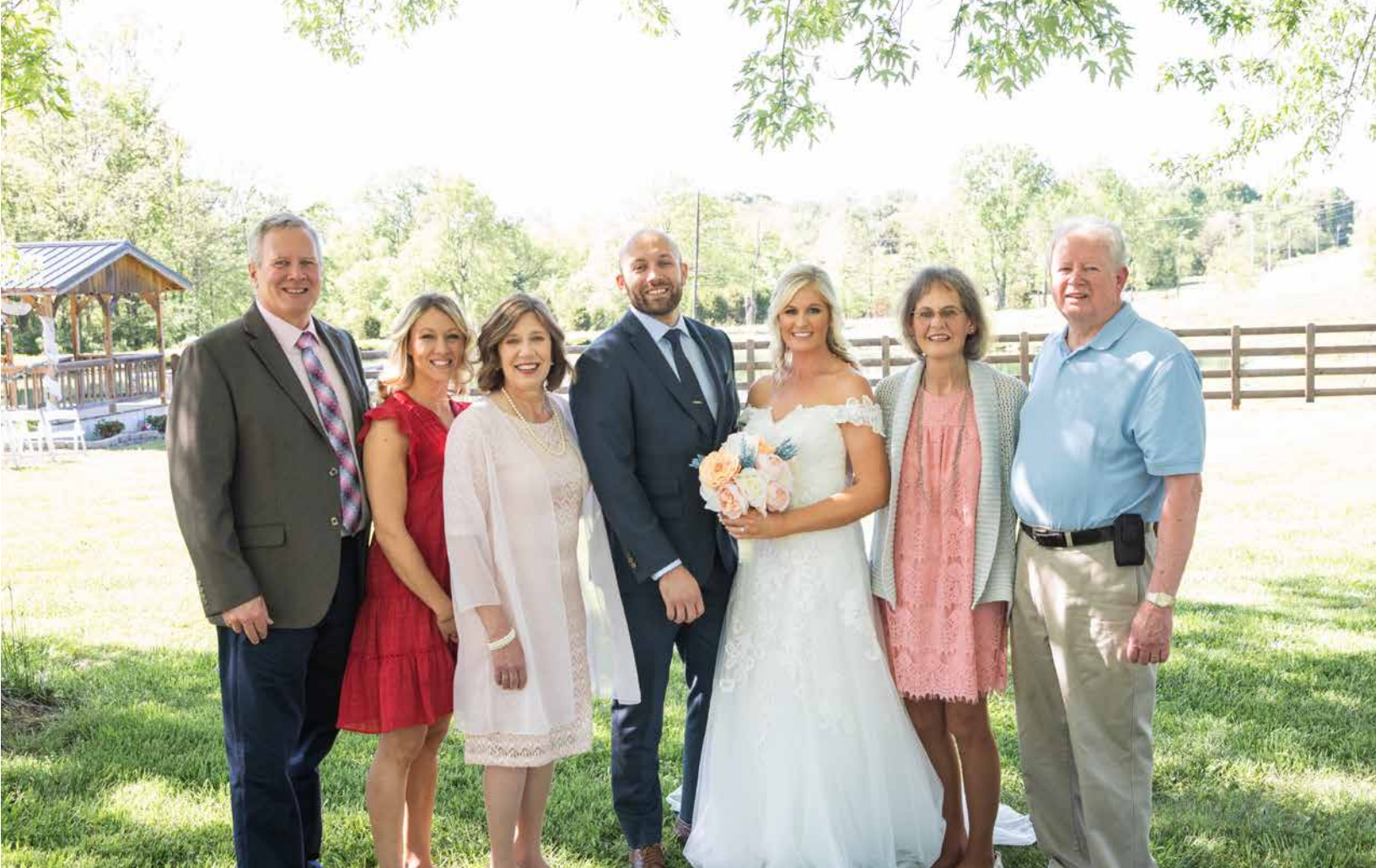
Both of our families together at our wedding