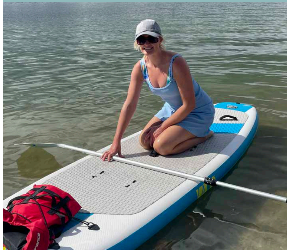
Paddle boarding on Lake Havasu