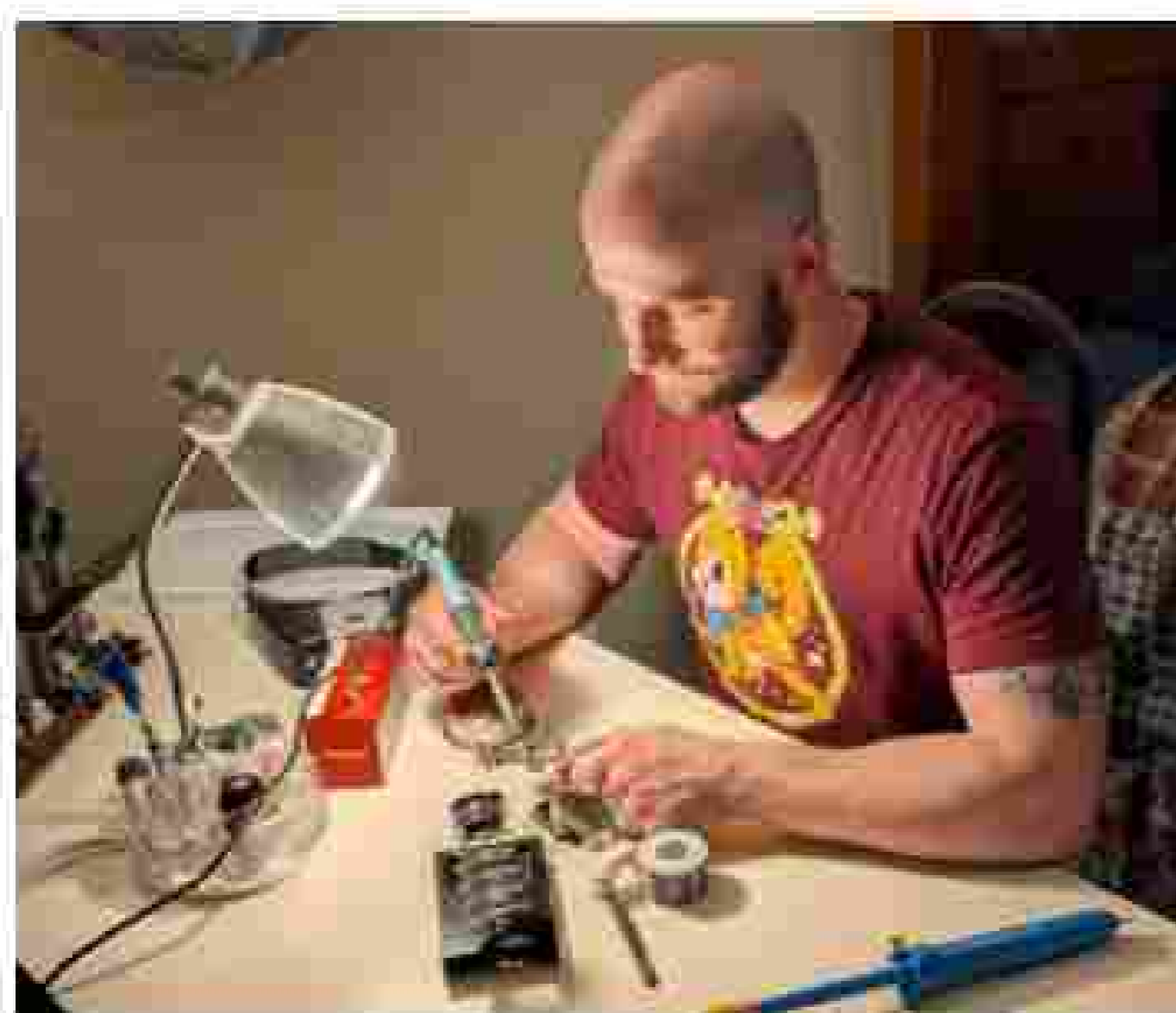
WORKING ON A HOBBY