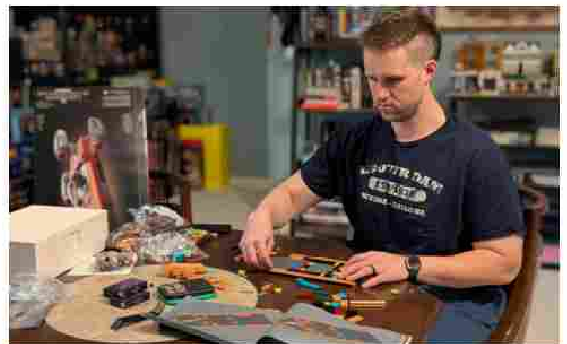
WORKING ON A HOBBY