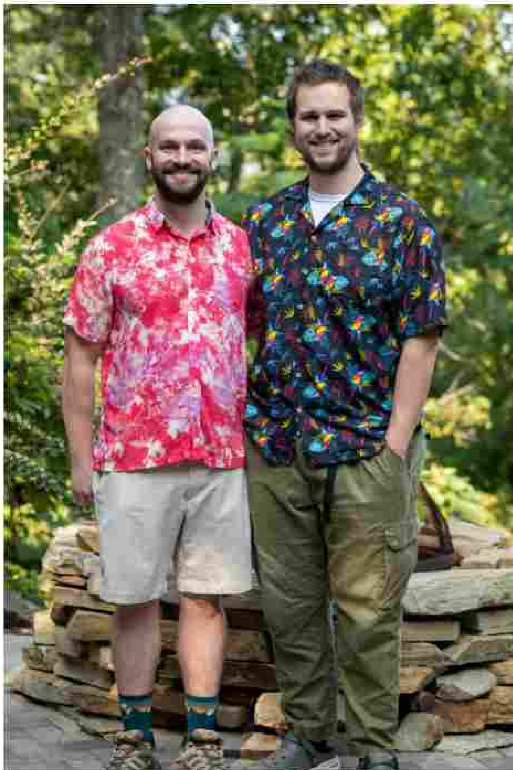
BLUE RIDGE MOUNTAINS