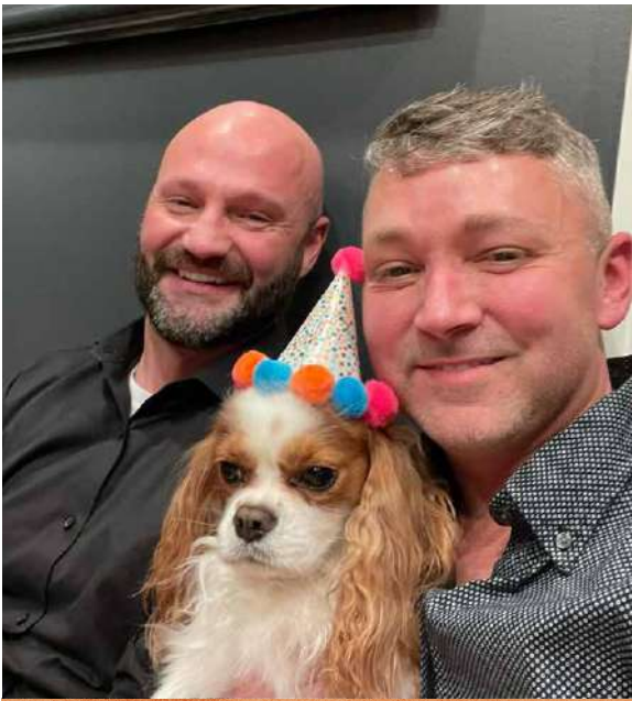
CELEBRATING OUR PUP'S BIRTHDAY