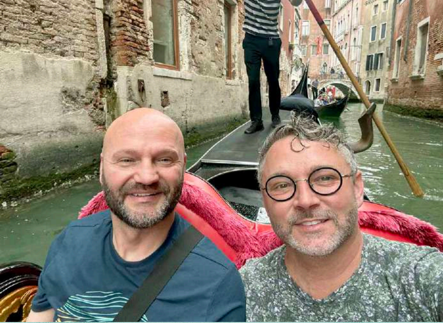
GONDOLA RIDE IN VENICE, ITALY