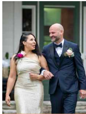
JOEY AND ELAINE