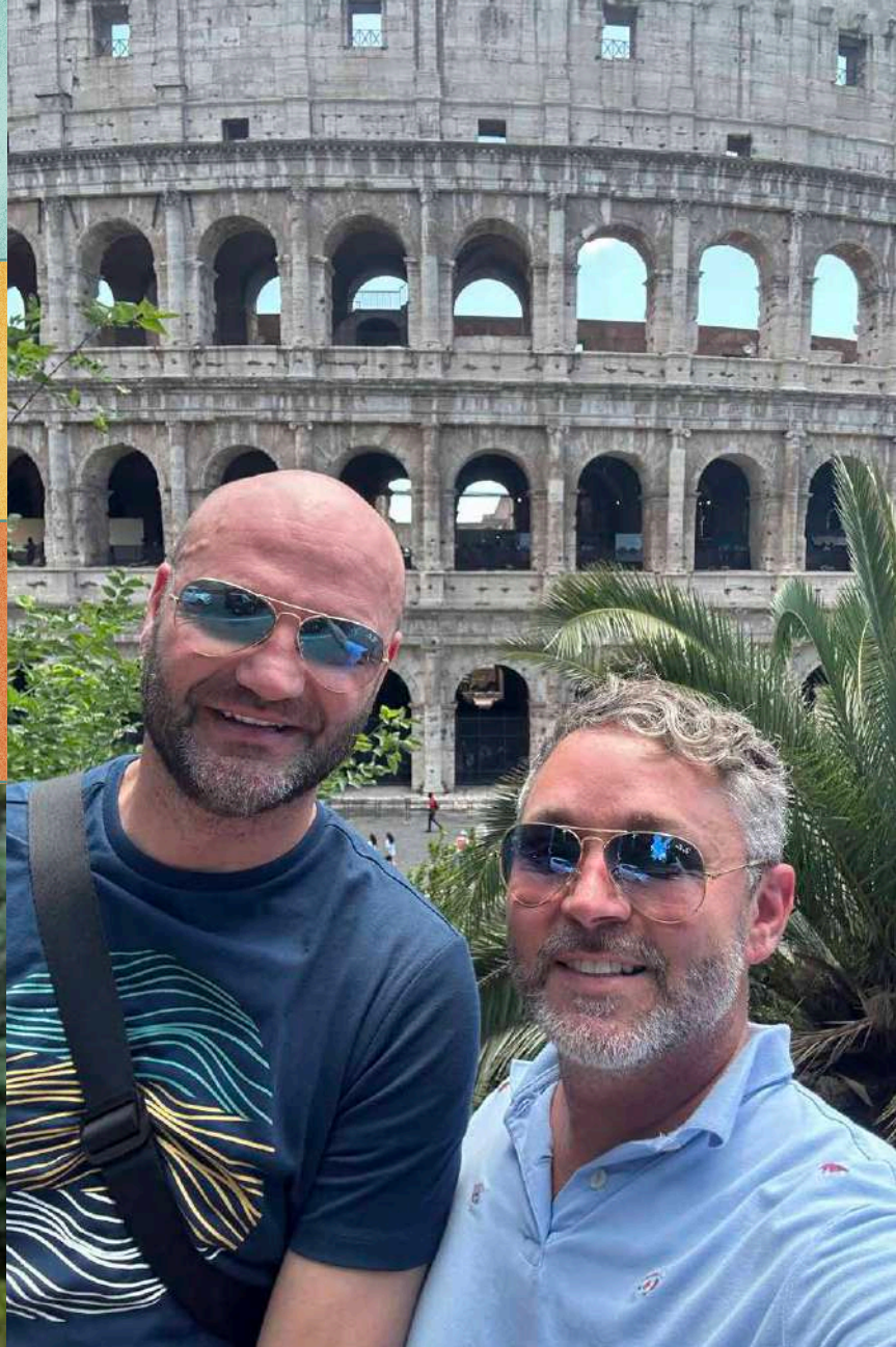
TOURING THE COLOSSEUM IN ROME, ITALY

We know this is such an emotional journey, and while we can't fully understand everything you're feeling, what we do know is the love and lifelong connection we hope to share with your child. Our dream is to be caring dads, patient teachers, and a constant source of support as they grow.